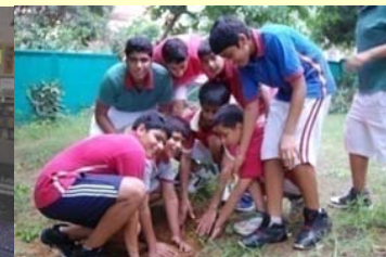
We are Aware