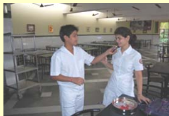
We Love and Care