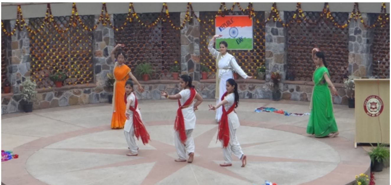
Rhythm of patriotism