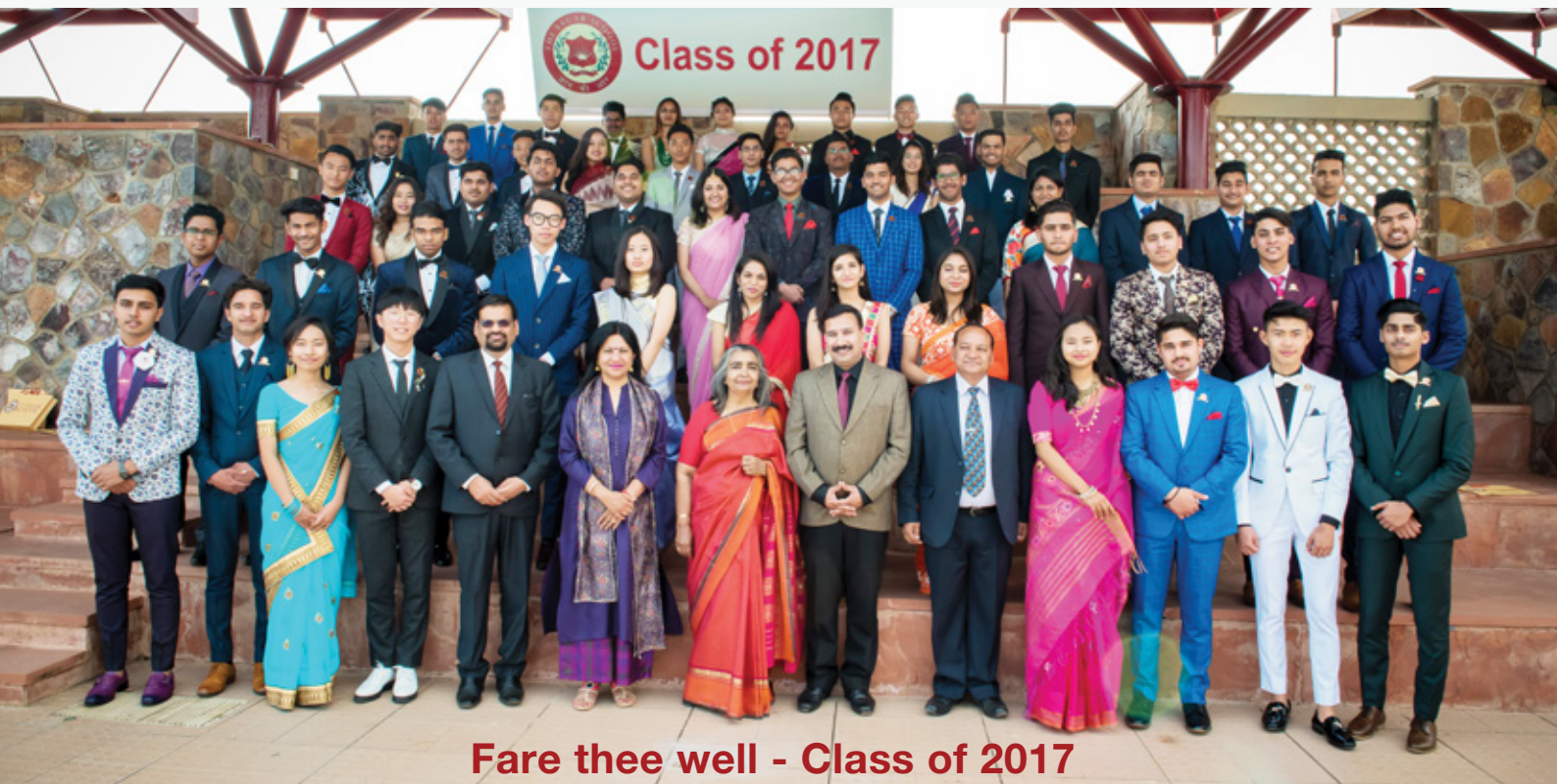
Fare thee well - Class of 2017

"Embrace the season of life you are in whether it is a season of rain or a season of sunshine. God is using it to shape you and prepare you for the future!"