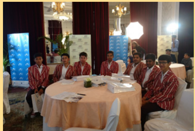
One globe- one world