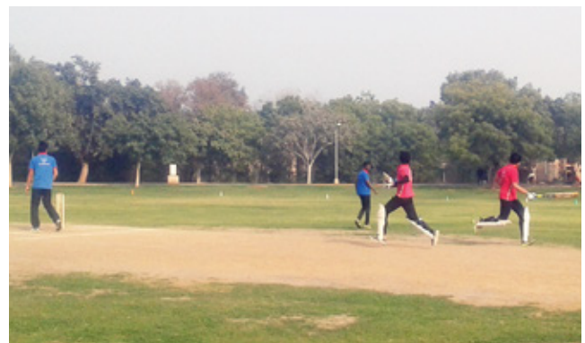
Running between the wickets