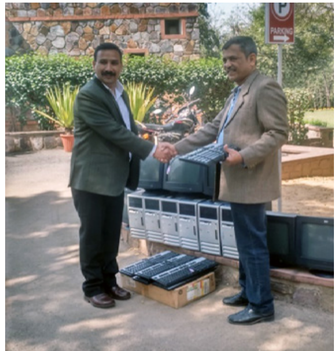
Donating Computers for a cause