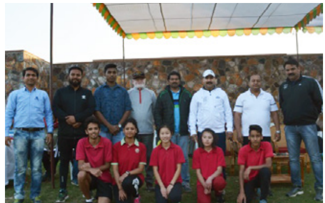
The quest to win