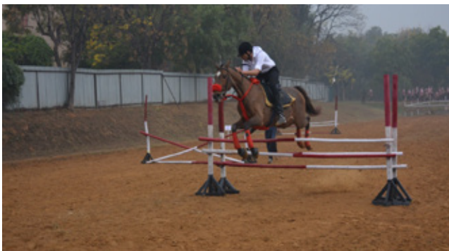
Trained to perfection