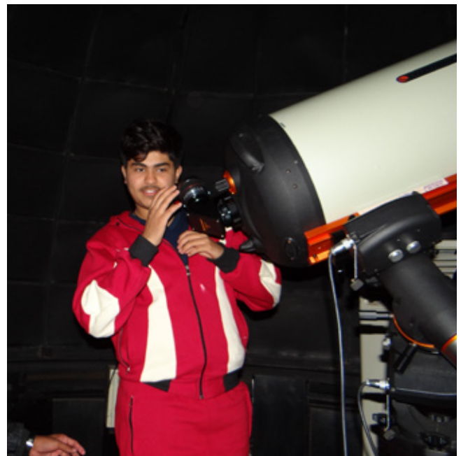
Eye the sky...

It was a lifetime experience for me as I witnessed the alignment of the eight planets, including the dwarf planet Pluto being aligned within a time period of 12 hours. Many other schools had also come over to view the same. I felt lucky for my school had the equipment to witness the same. Being the head of photography for the event, I watched each of the planets clearly. The doubt I always had while drawing the planets in the notebook was clarified. The planets along with the thousands of other stars hold many untold secrets of the universe.