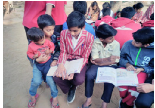
Towards the society

The IAYP volunteers donated their time and efforts towards assisting the children of the nearby Maliyar Village in studies.