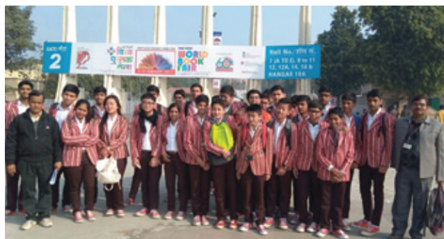
For the love of books