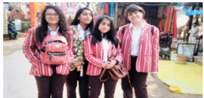
Reliving the roots

theatre. It was a day well spent and an unforgettable experience.