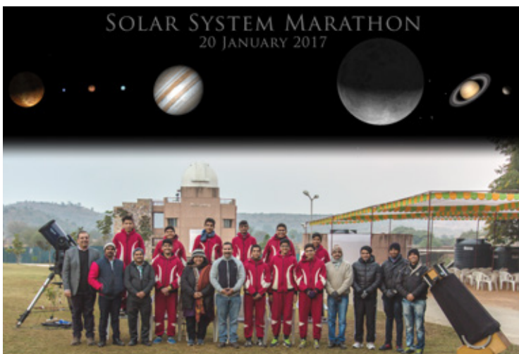
The grand celestial event