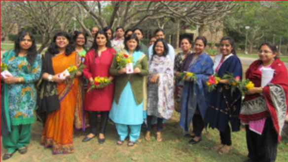
Sagarian Girl Power!

March 8 - Celebrating, the essence of womanhood, Women's Day was observed at The Sagar School. The lady staff members were greeted with beautiful handmade bouquets and cards. A special musical interlude seasoned with sumptuous snacks was organised by the male counterparts of the faculty.