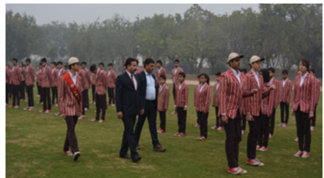
Guard of honour