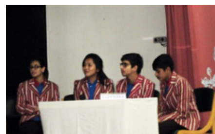
teamed up for victory