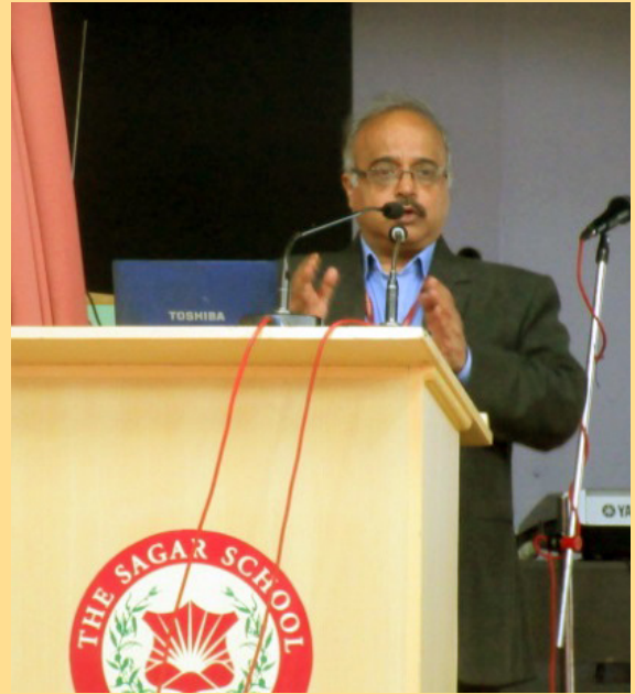
Where to from here!