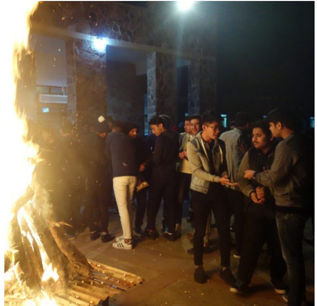
Sweets and warmth