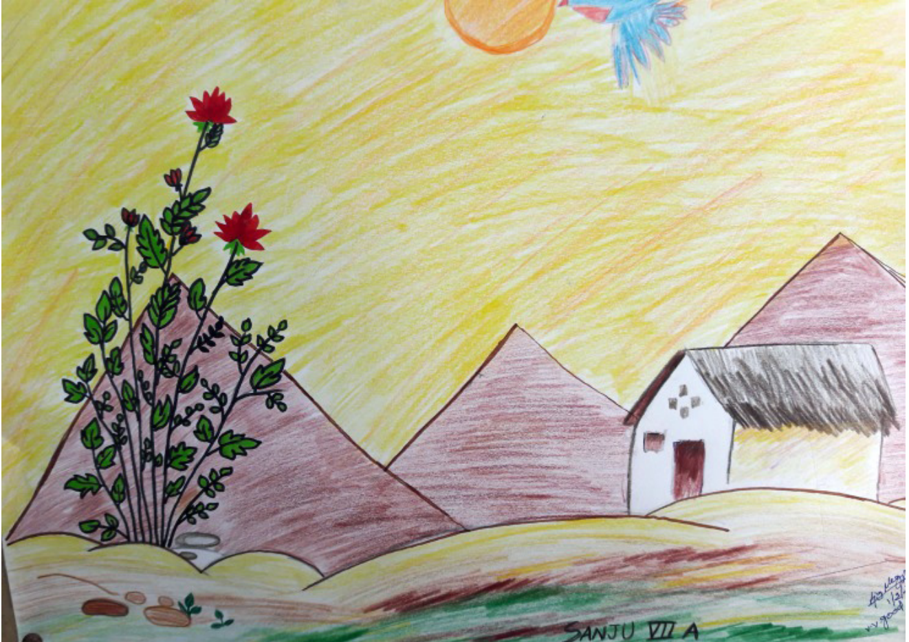
Sanju Bharati, class VII