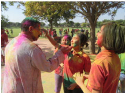
Colours of love

March 13 - Holi, the Spring festival was celebrated with colourful enthusiasm on the full moon day in the month of Phalgun which is March according to the Gregorian calendar. The students and staff applied bright colours of abeer, gulal and coloured water over each other with gay abandon. The peppy music made all toes tap to its rhythm and the awesome sweet delicacies and thandai was enjoyed by all.