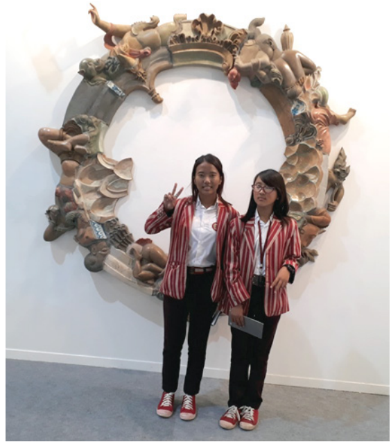
Art and appreciation