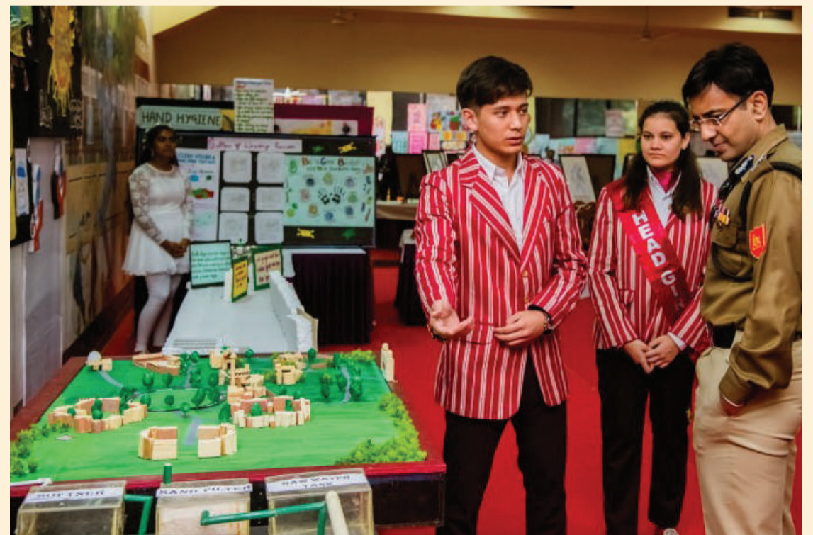
THE PRIDE OF BEING RECOGNISED AS A ROUND SQUARE SCHOOL