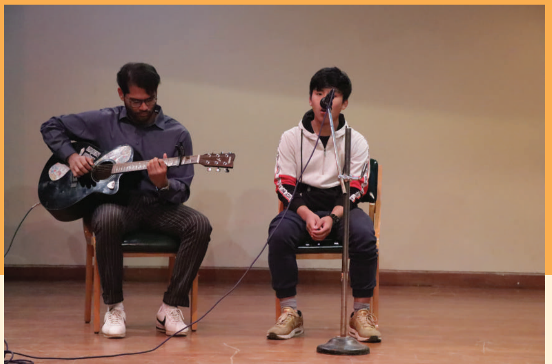
A GUITAR AND A MICROPHONE CAN CREATE MAGIC