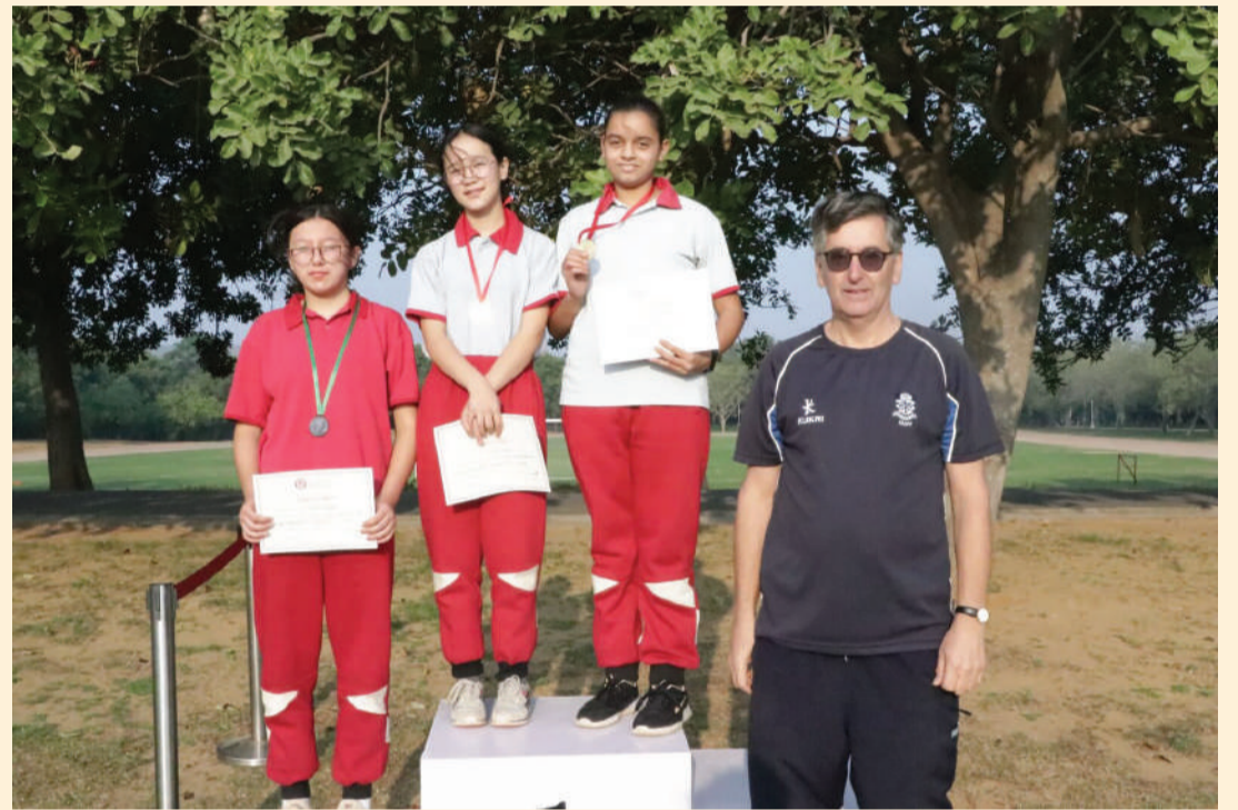
WINNERS- SHARING THE VICTORY STAND