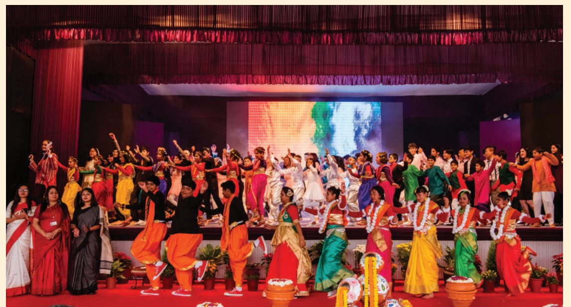
THE GRAND FINALE, RICH COLOURS TELLING A TALE