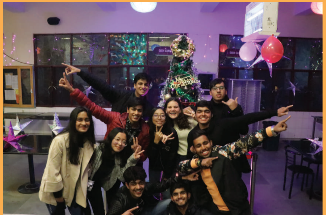
LOOK CAREFULLY. YOU WILL SEE MANY STARS