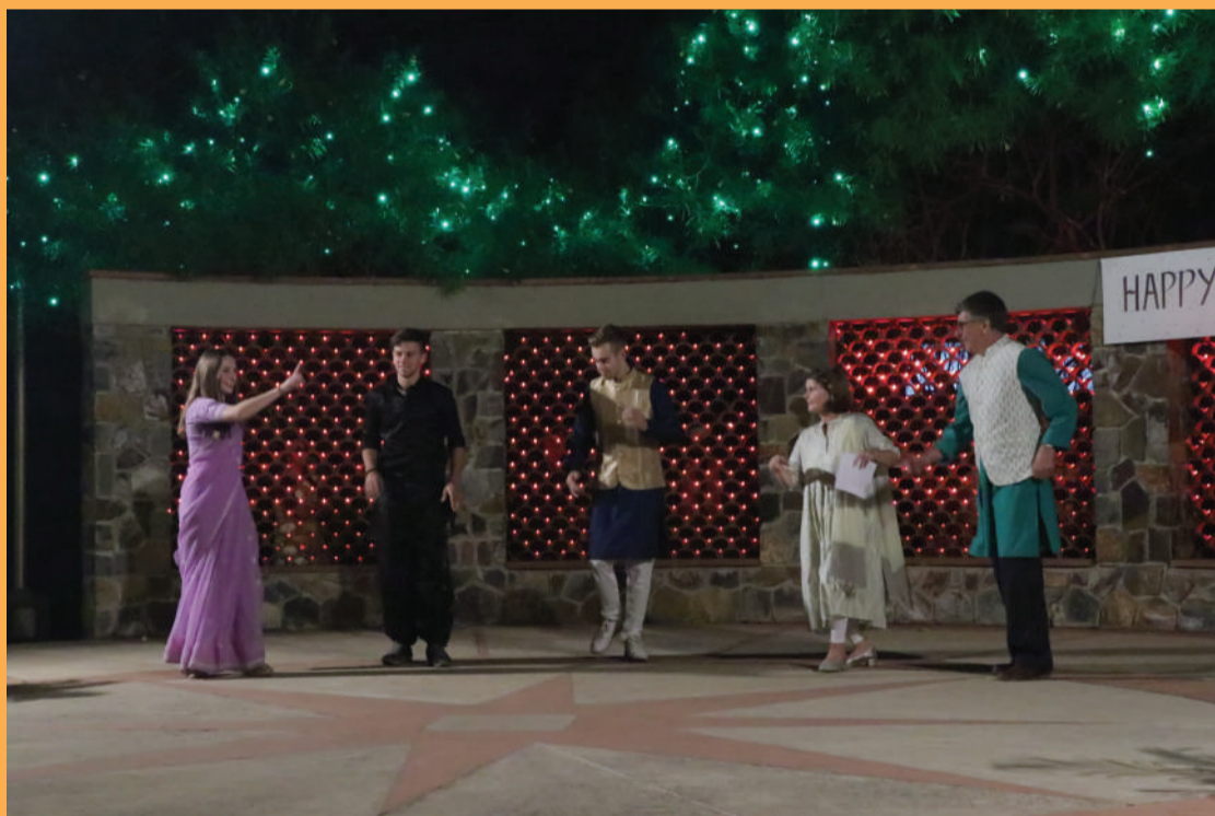
THE EURO BUNCH GELLING WELL IN A DESI-STYLE!