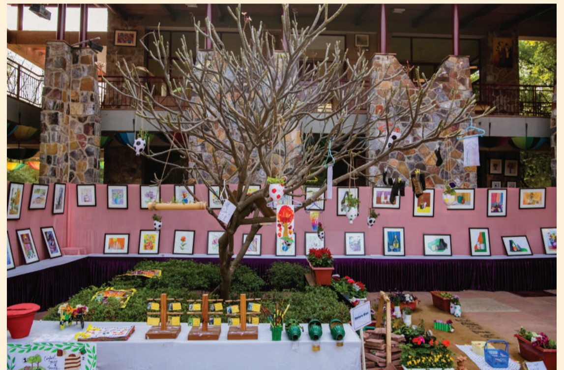
REVISITING THE PAST