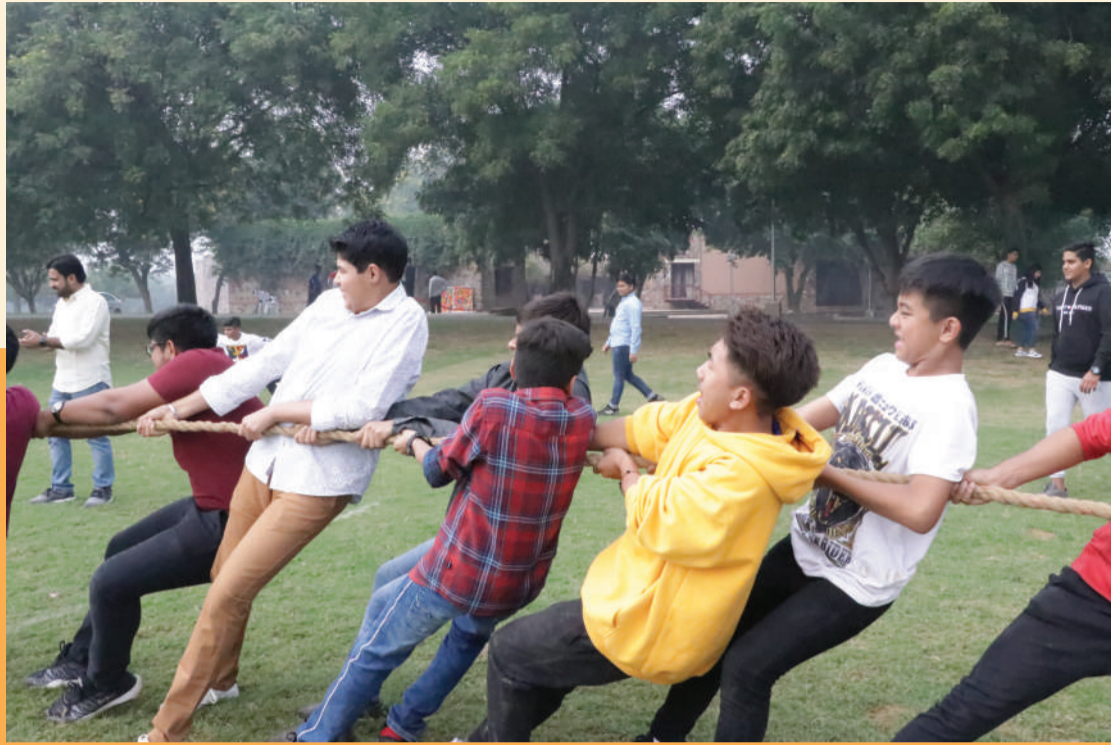
TOGETHER WE CAN DO SO MUCH!