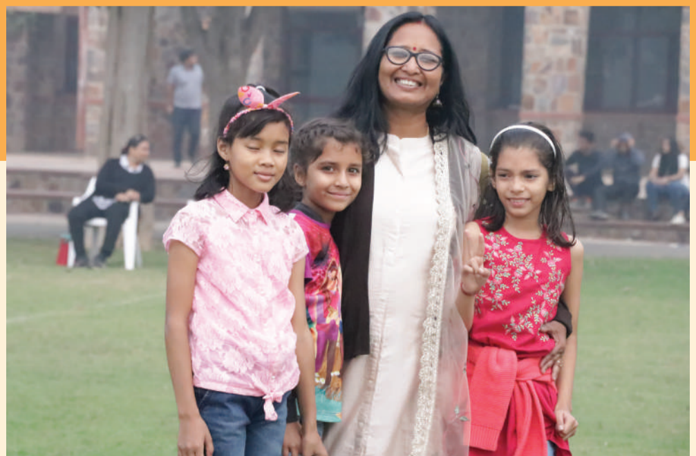
A BOND SO STRONG!