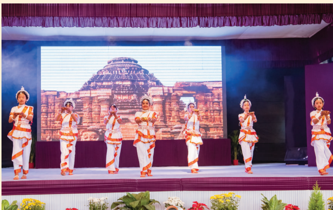
AN EXUBERANT DISPLAY OF GRACE AND COLOUR TO DISPEL THE DARKNESS AND IGNITE THE LIGHT OF TRUTH