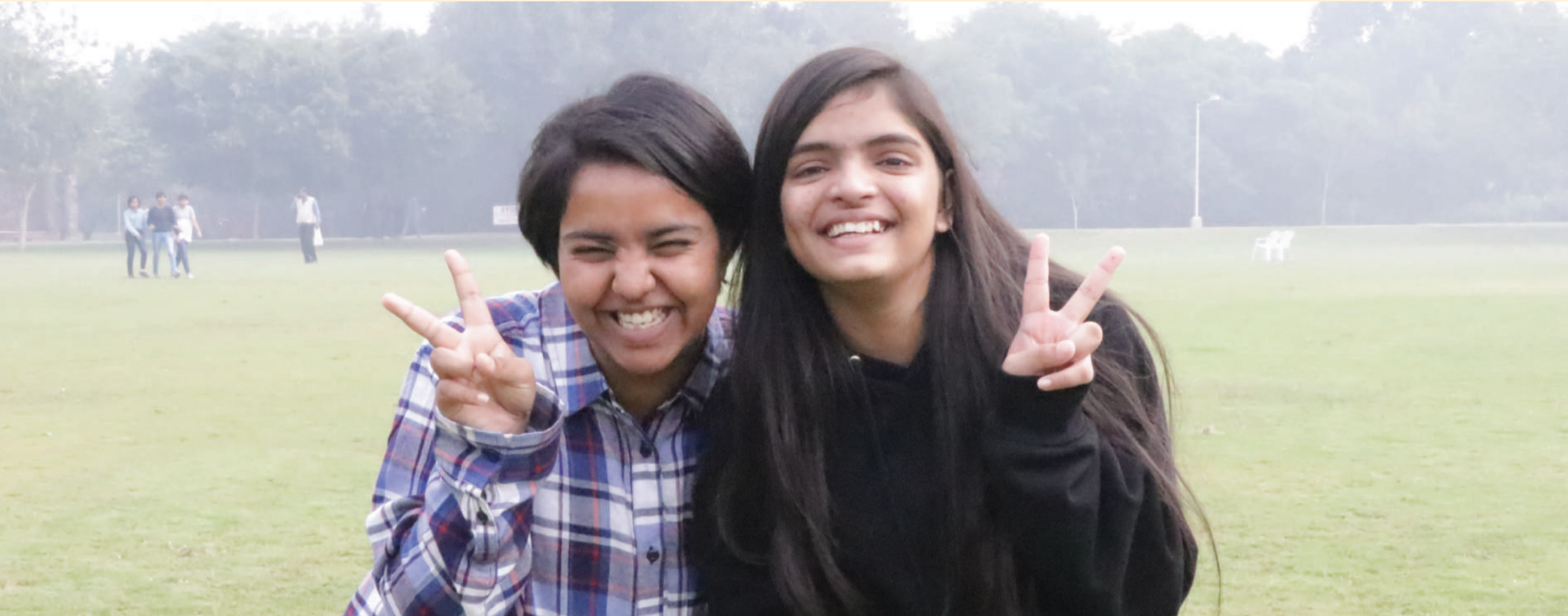
WHAT A BEAUTIFUL PLACE TO BE WITH FRIENDS!

Colourful balloons, paper planes, cotton candies, bruised knees and grandpa's stories, are reminiscences of a naughty childhood. Growing up is a wonder and necessity, but we keep carrying these pieces of childhood with us as nostalgia and flashbacks. Every year, on this day, we eagerly wait to find the keys of our childhood locker and let go of the free spirit that was once a part of our being. It's a day dedicated to innocence, playfulness and mirth.