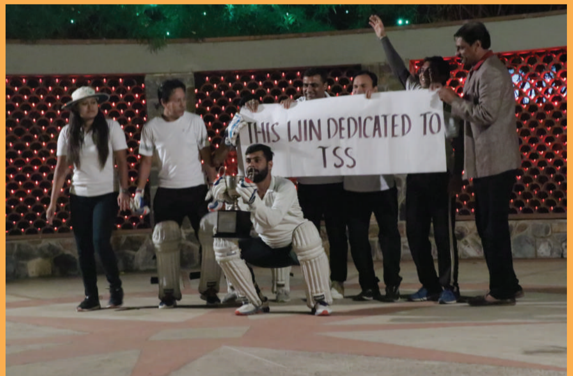
WORLD CUP PERFORMANCE BY THE SPORTS COACHES

Children’s Day was replete with exhilaration and vibrant enthusiasm. A day full of excitement and enjoyment was furthermore accentuated with the cultural evening. The children appreciated the varied performances dedicated to them by their teachers. Ranging from a spooky theme to a hilarious presentation of advertisements, the teachers left everyone amused! This was followed by a dance party and a delicious menu.