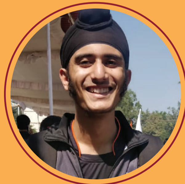
SAGARIANS – CREATING A SAGAR OF ACHIEVEMENTS