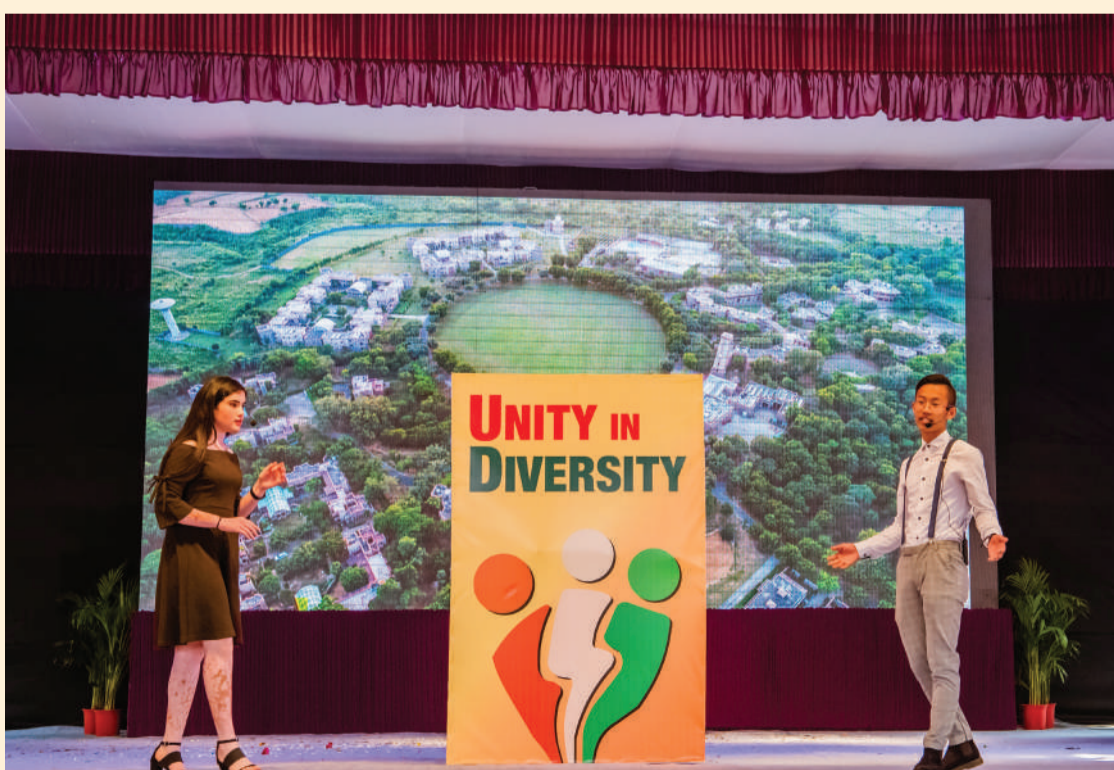
TO COMMEMORATE THE 150 th BIRTH ANNIVERSARY OF MAHATMA GANDHI, THE STUDENTS OF CLASS XII TOOK THE ONUS OF PRESENTING HIS IDEALS AND CONTRIBUTIONS TO THE NATION IN THE FORM OF A MIME ACT THAT LEFT THE AUDIENCE SPELLBOUND