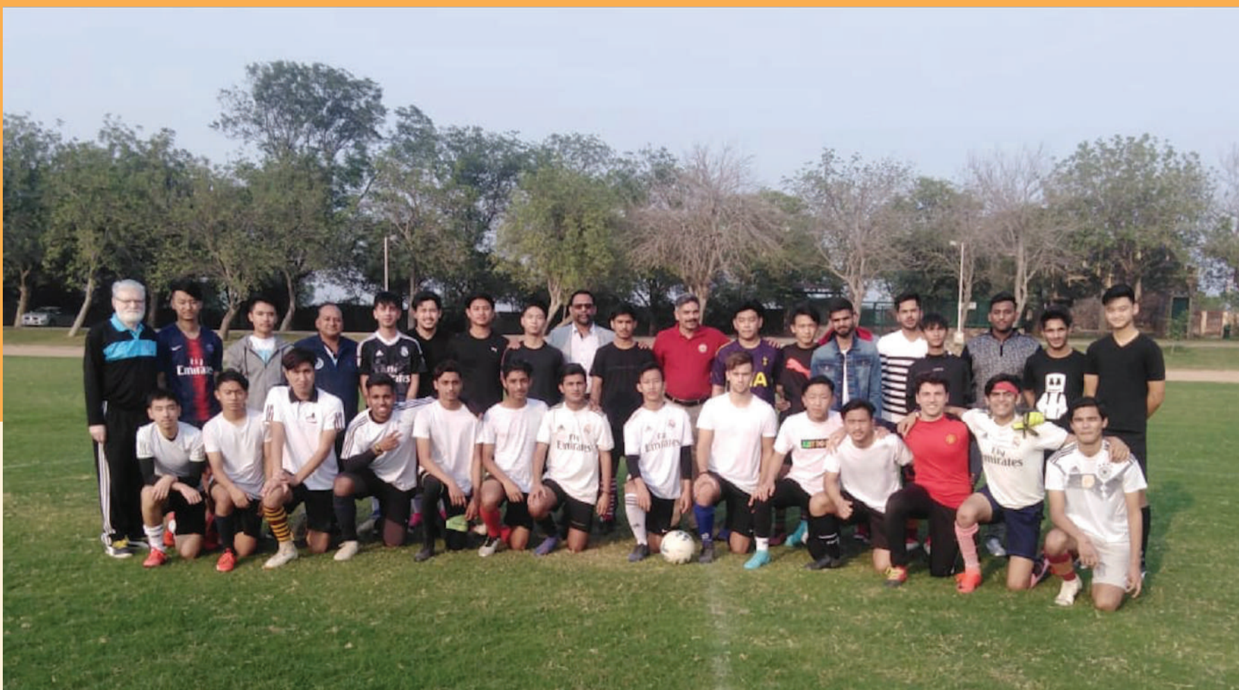
FRIENDSHIP - AN ALBUM OF VICTORY AND SOARING HIGH