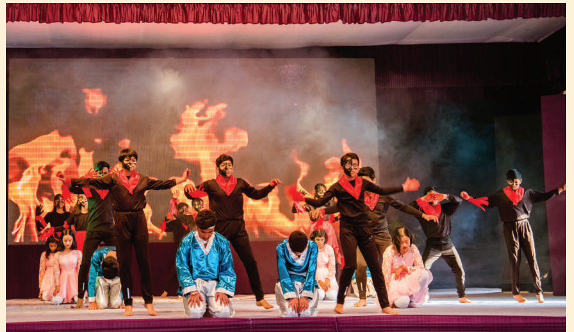
WHAT A SCINTILLATING PERFORMANCE IT WAS!