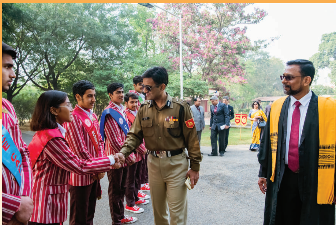
CHIEF GUEST, AMIT LODHA, IPS INTERACTING WITH THE STUDENTS