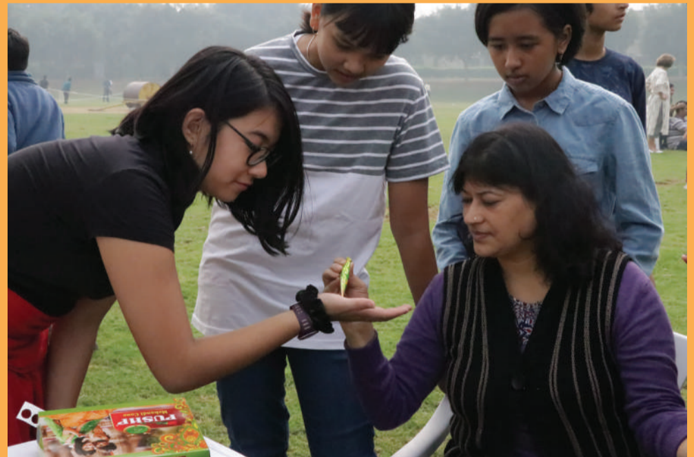
ADORNING THE PALMS AND LIVES...