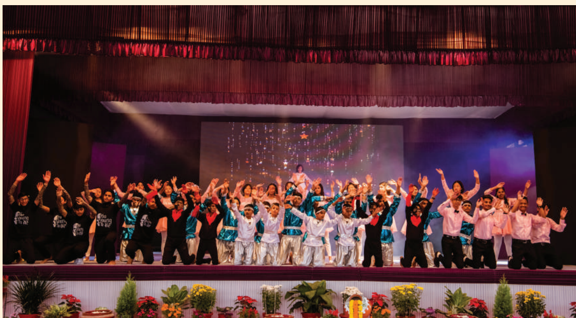
A CELEBRATION OF TEENAGE AND LIFE