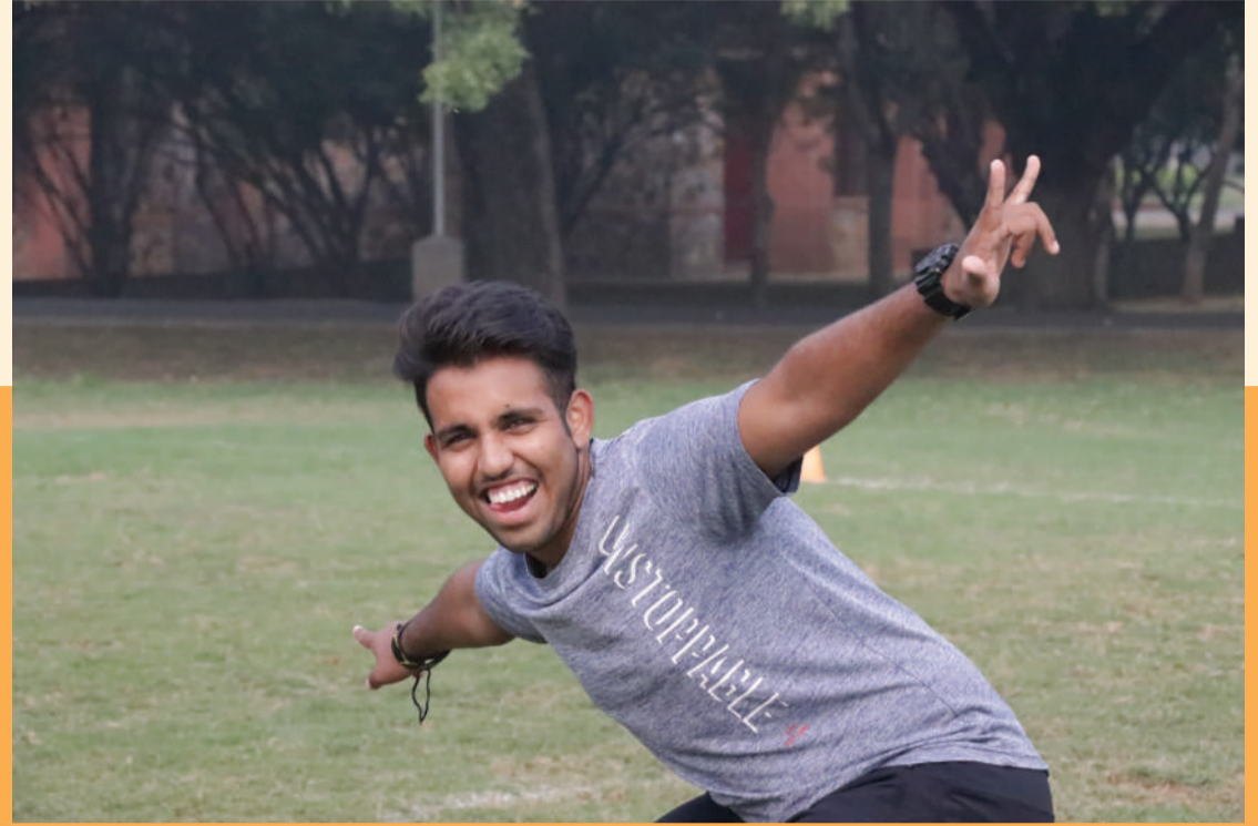
THE VICTORIOUS FLIGHT...