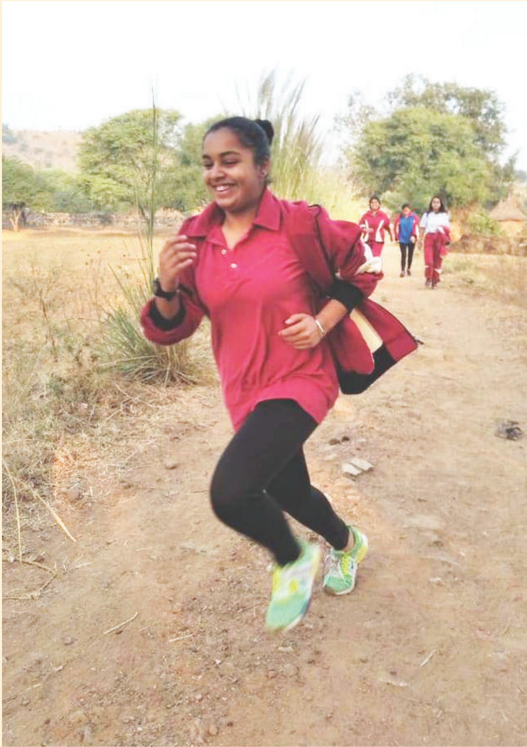
A GOOD LAUGH AND A LONG RUN...