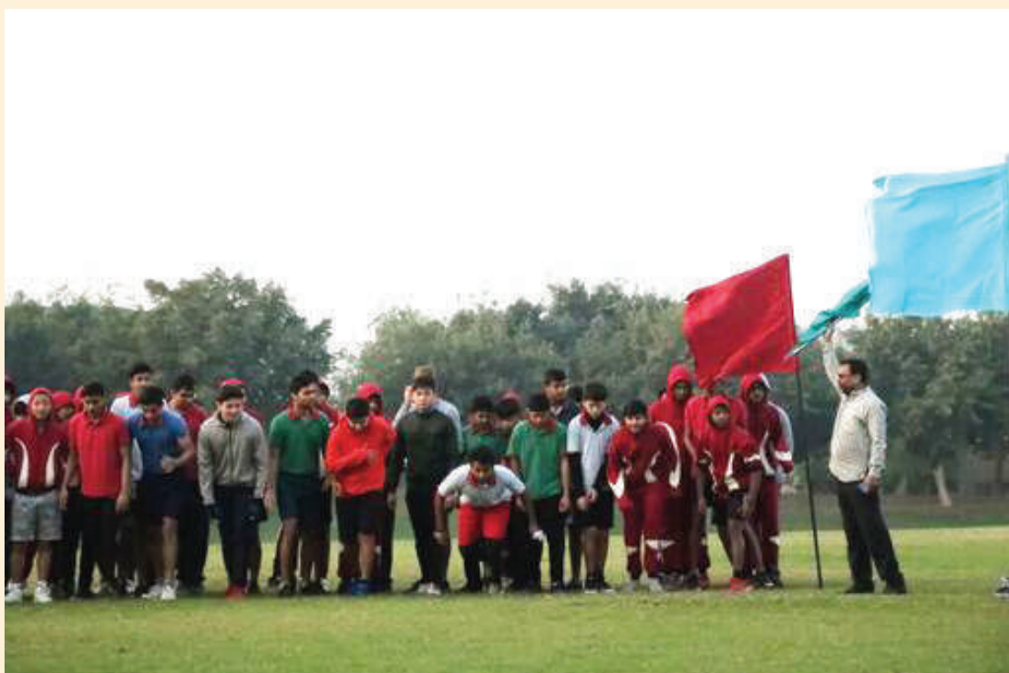
READY STEADY GO...