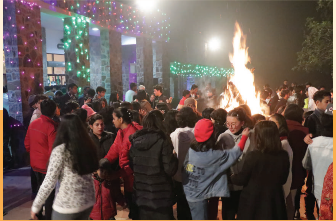
KINDLING BONFIRE TO LIGHT UP HEARTS