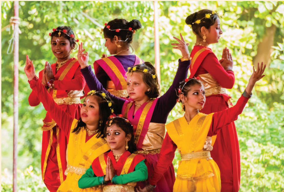
A STRONG SOCIAL MESSAGE BRILLIANTLY CONVEYED: STUDENTS PERFORMING RABINDRANATH TAGORE'S MUSICAL PLAY 'CHANDALIKA'