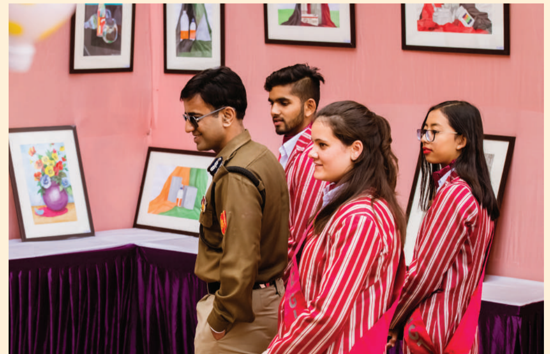
THE ART GALLERY: A SPECTACULAR DISPLAY OF PAINTINGS MADE BY SAGARIANS