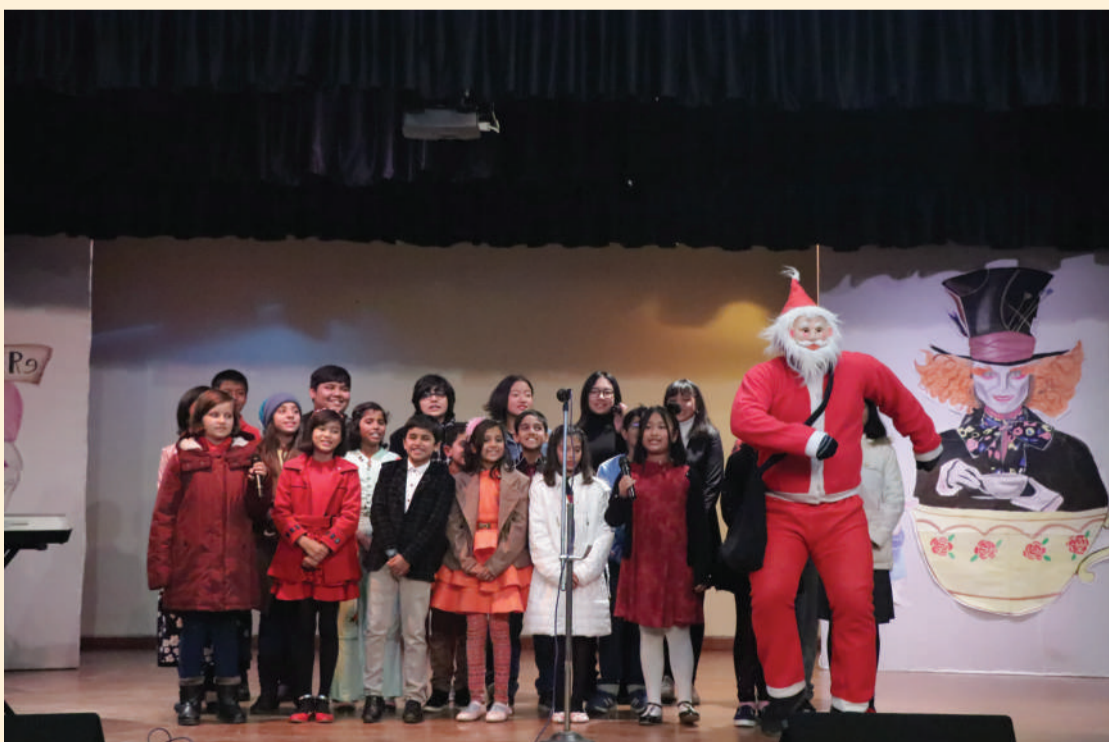
DASHING THROUGH THE SNOW WITH THE SCHOOL CHOIR AND SANTA