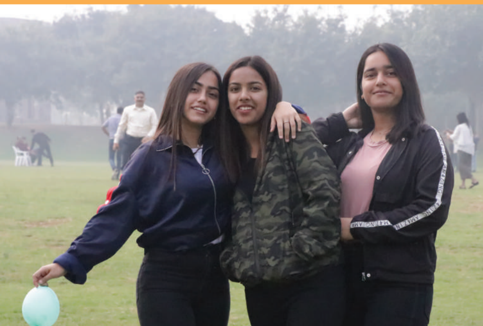
THE TANTALISING TRIO!