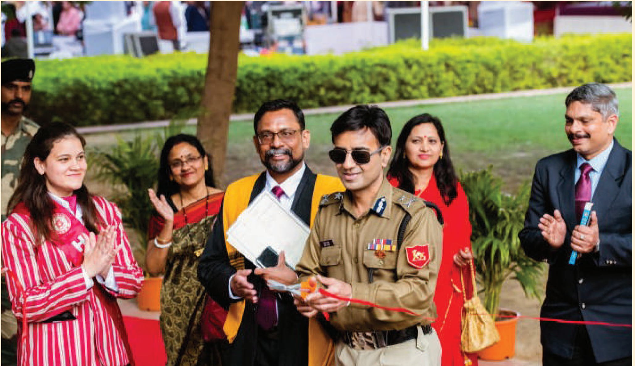
THE CHIEF GUEST INAUGURATING THE EXHIBITION ARENA

Every year the exhibits put up by the Sagarians are appreciated and acknowledged by the esteemed guests who visit the school to witness the Founder's day celebrations. Following tradition this year too the exhibition was spectacular. The display involved a month long preparation and the outcome was immensely creative, astounding and top-notch.