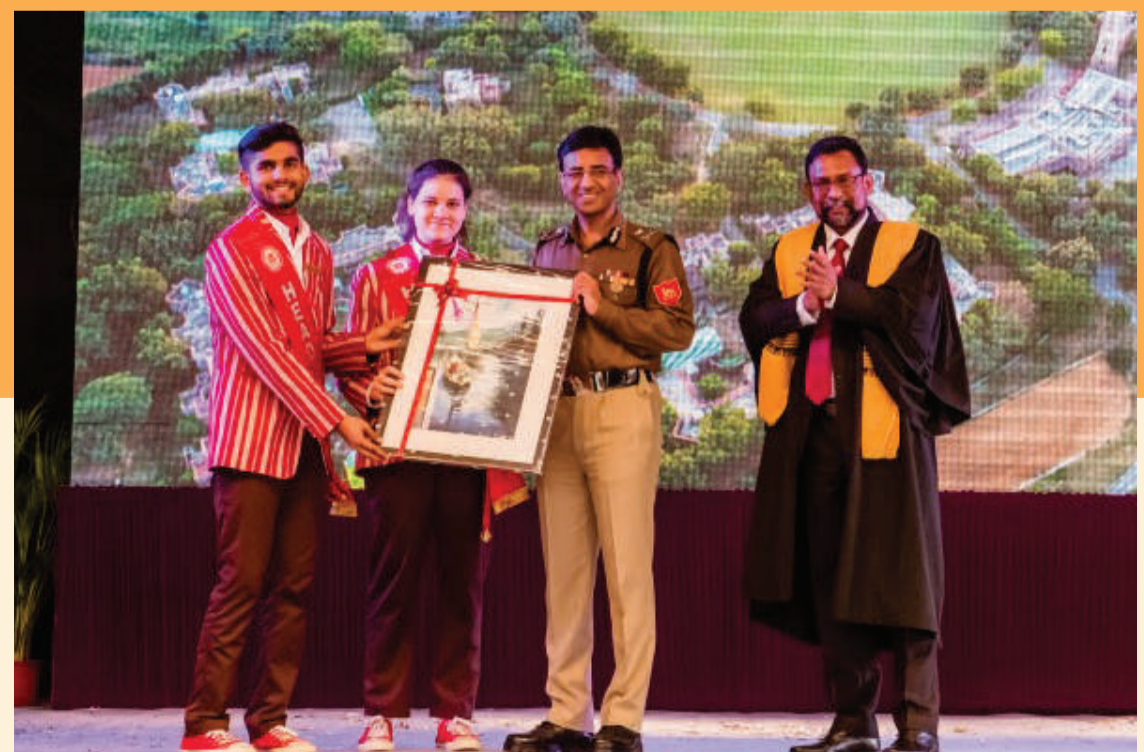
THE CHIEF GUEST BEING FELICITATED BY THE HEAD BOY AND HEAD GIRL