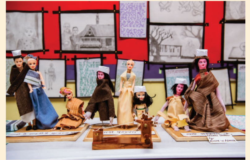
EXHIBIT COMMEMORATING THE 150 th BIRTH ANNIVERSARY OF THE FATHER OF THE NATION