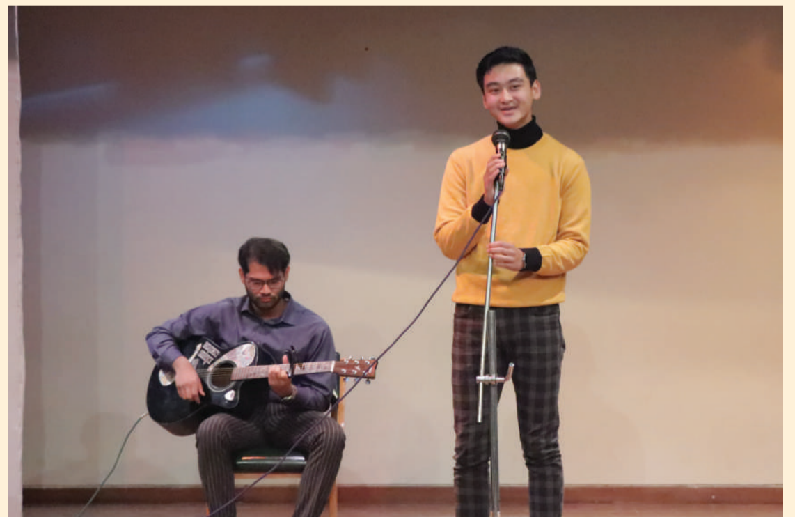
RECALLING THE MELODIOUS LYRICS OF 'IMAGINE' BY JOHN LENNON