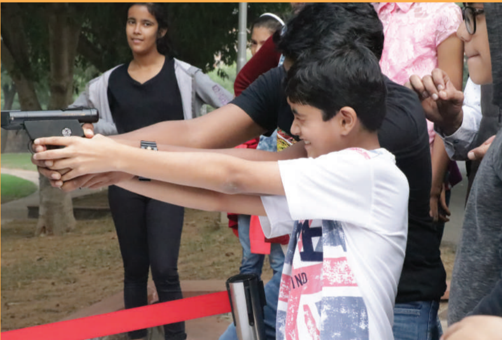
RAISE. AIM. SHOOT!

Colourful balloons, paper planes, cotton candies, bruised knees and grandpa's stories, are reminiscences of a naughty childhood. Growing up is a wonder and necessity, but we keep carrying these pieces of childhood with us as nostalgia and flashbacks. Every year, on this day, we eagerly wait to find the keys of our childhood locker and let go of the free spirit that was once a part of our being. It's a day dedicated to innocence, playfulness and mirth.