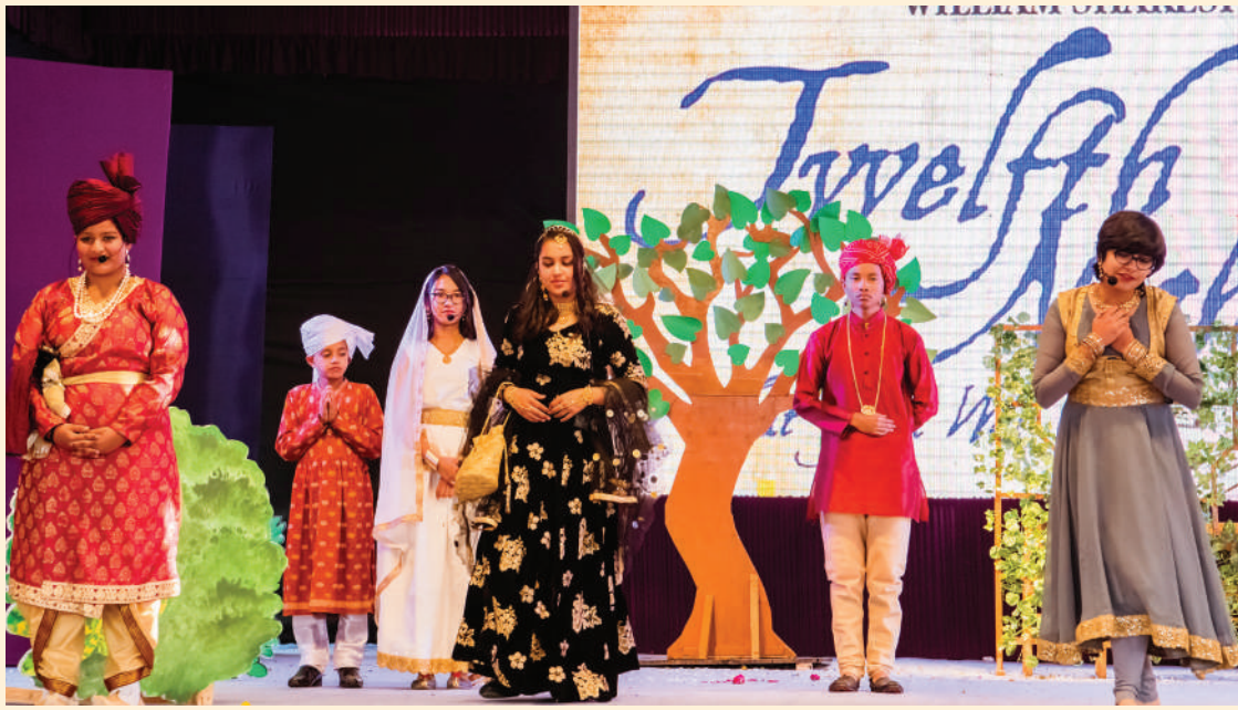
'ACTIONS SPEAK LOUDER THAN WORDS'- A THEATRICAL REPRESENTATION WITH A DIFFERENCE. OUR GUEST FACULTY FROM CANFORD SCHOOL, ENGLAND PRESENTED SHAKESPEARE'S 'THE TWELFTH NIGHT' IN AN INDIAN LIGHT. ITS DISTINGUISHING FEATURE WAS THAT IT WAS PERFORMED LIVE BY THE STUDENTS.