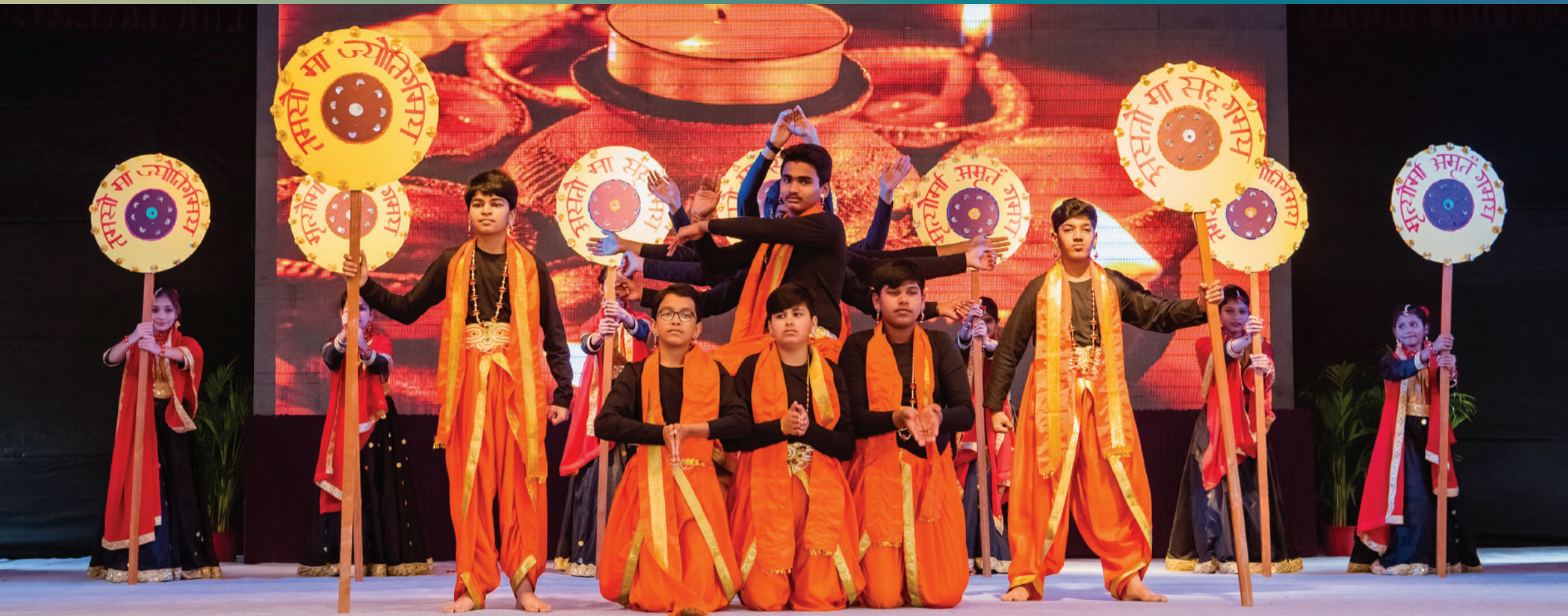
OPENING DANCE: A POWERFUL RENDITION OF "ASTO MA SAD GAMYA..."

WINNER OF THE GREEN SCHOOL OF THE YEAR AWARD (NORTH) & THE BEST INFRASTRUCTURE (JURY CHOICE) AWARD AT THE GLOBAL EDUCATION AWARDS 2019