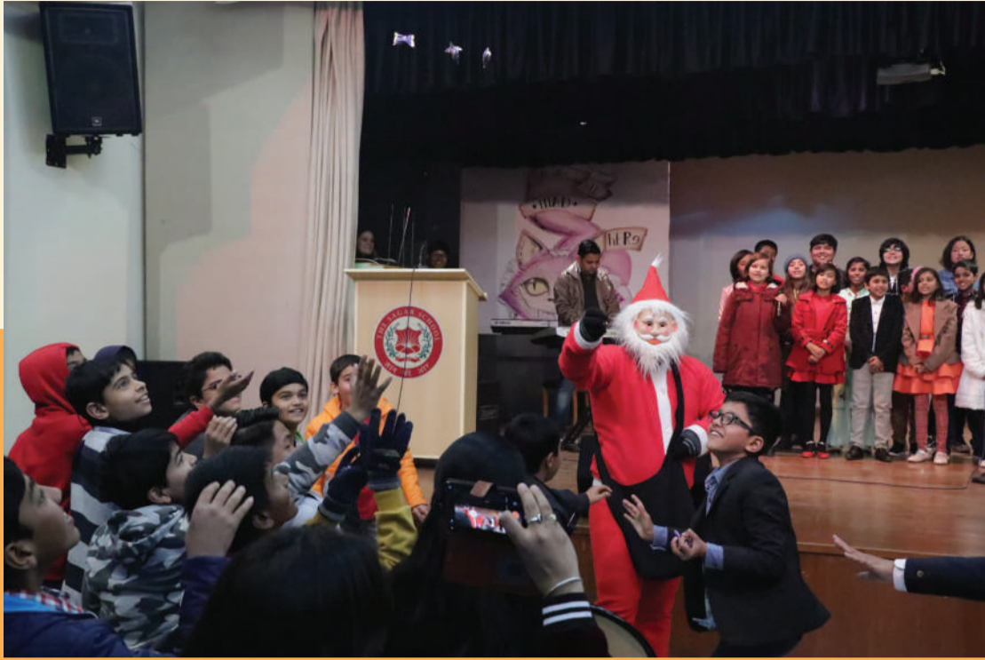
LAUGHING ALL THE WAY INCORPORATES CHOCOLATE DISTRIBUTION BY SANTA