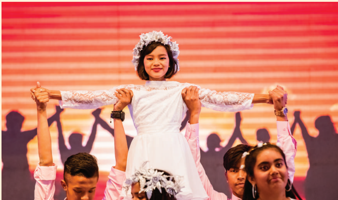
'FEEL THE LIGHT, SHINING IN THE DARK OF THE NIGHT'