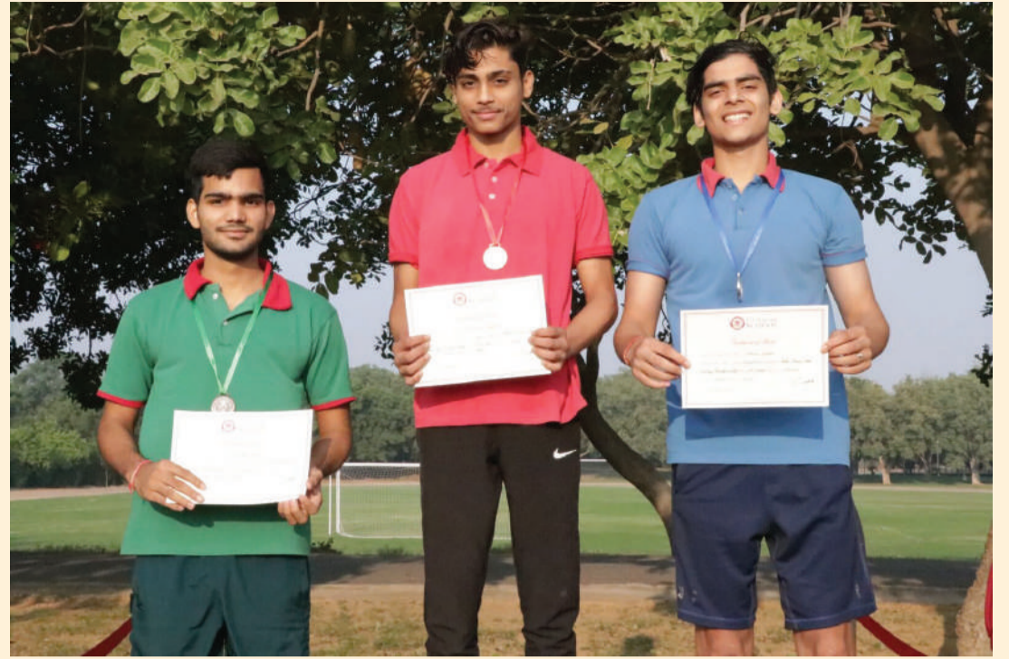
HARD WORK CALLS FOR SOME SMILE AND PRAISE...