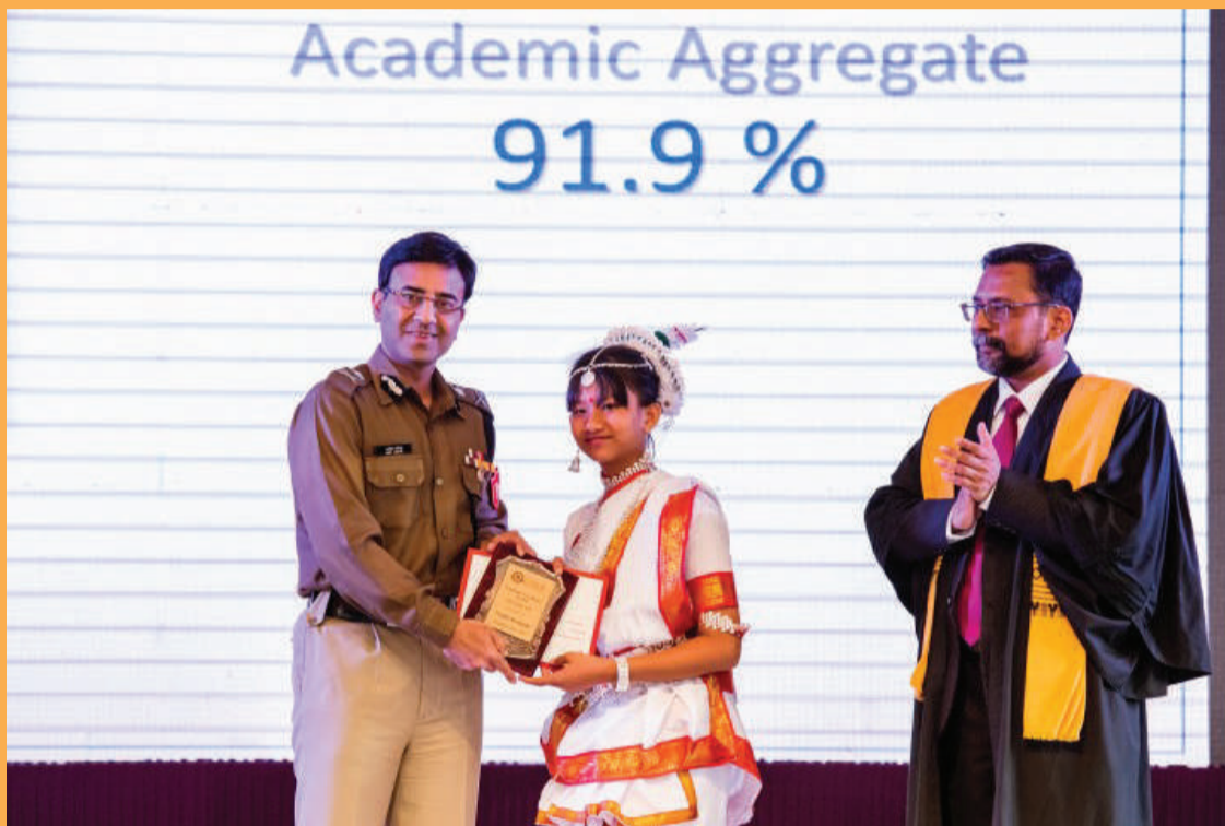
ACADEMIC ACHIEVERS BEING FELICITATED BY THE CHIEF GUEST

Awards were handed over to students securing 90% and above in Academics which was indeed an incentive for their hardwork and encouraged other students who witnessed the award ceremony. CBSE Toppers were felicitated by the Chief Guest and the Principal. The Chief Guest impressed the young and the old with his impeccable sense of humour. The interactive session between him and the audience was informative and interesting.