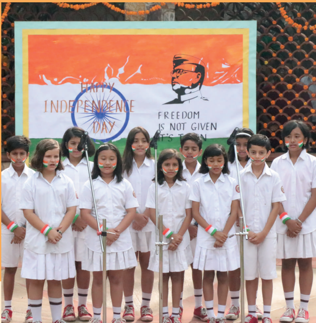
EXPRESSING PATRIOTISM THROUGH MUSIC