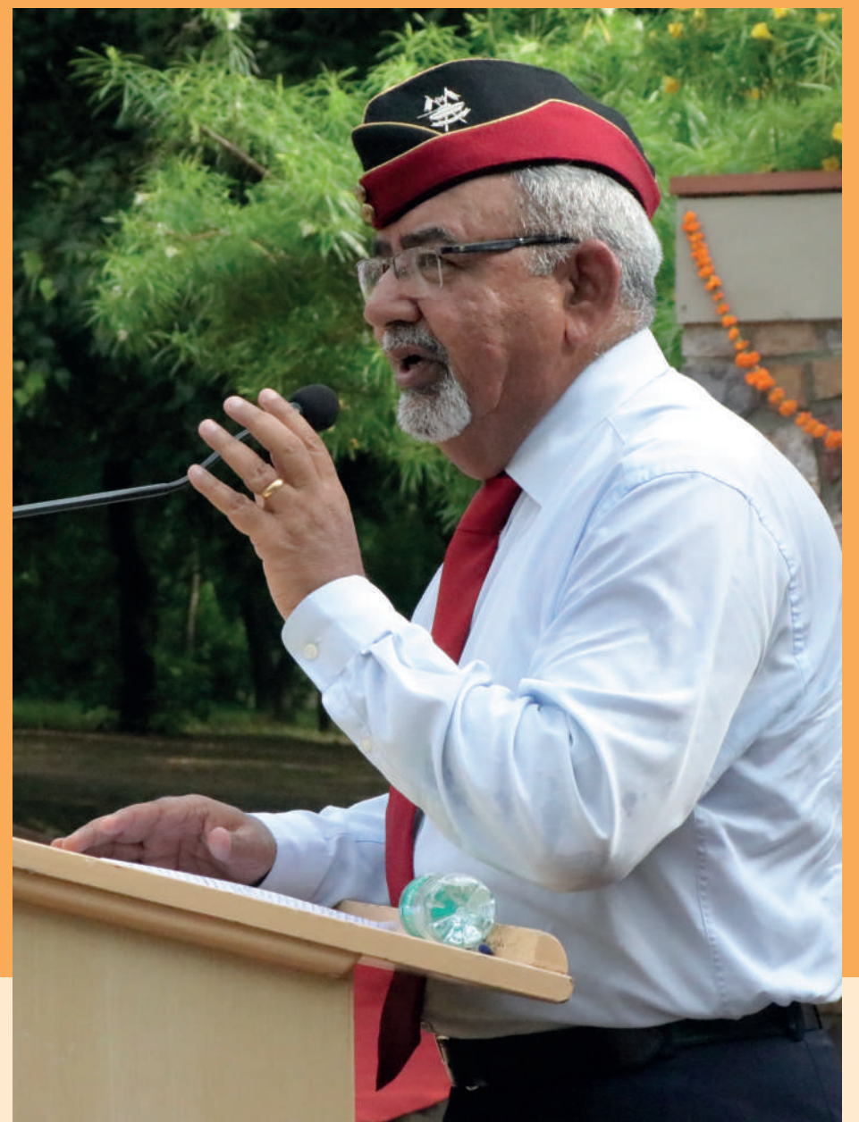
INSPIRING SPEECH BY LT. GEN. RAJEEV TEWARI