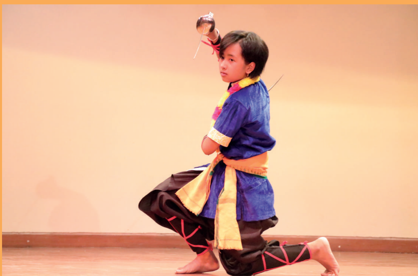
SHOWCASING HER SKILLS IN MARTIAL ARTS