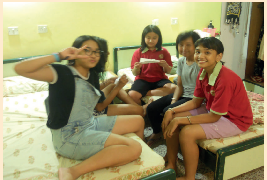
NOTHING IS AS CHARMING AS THE COMPANY OF GOOD FRIENDS...