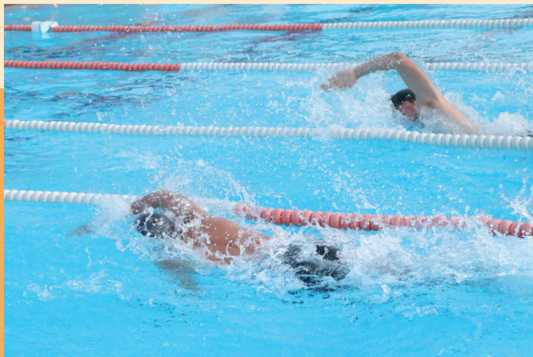
MAKE WAVES AND TURN HEADS....