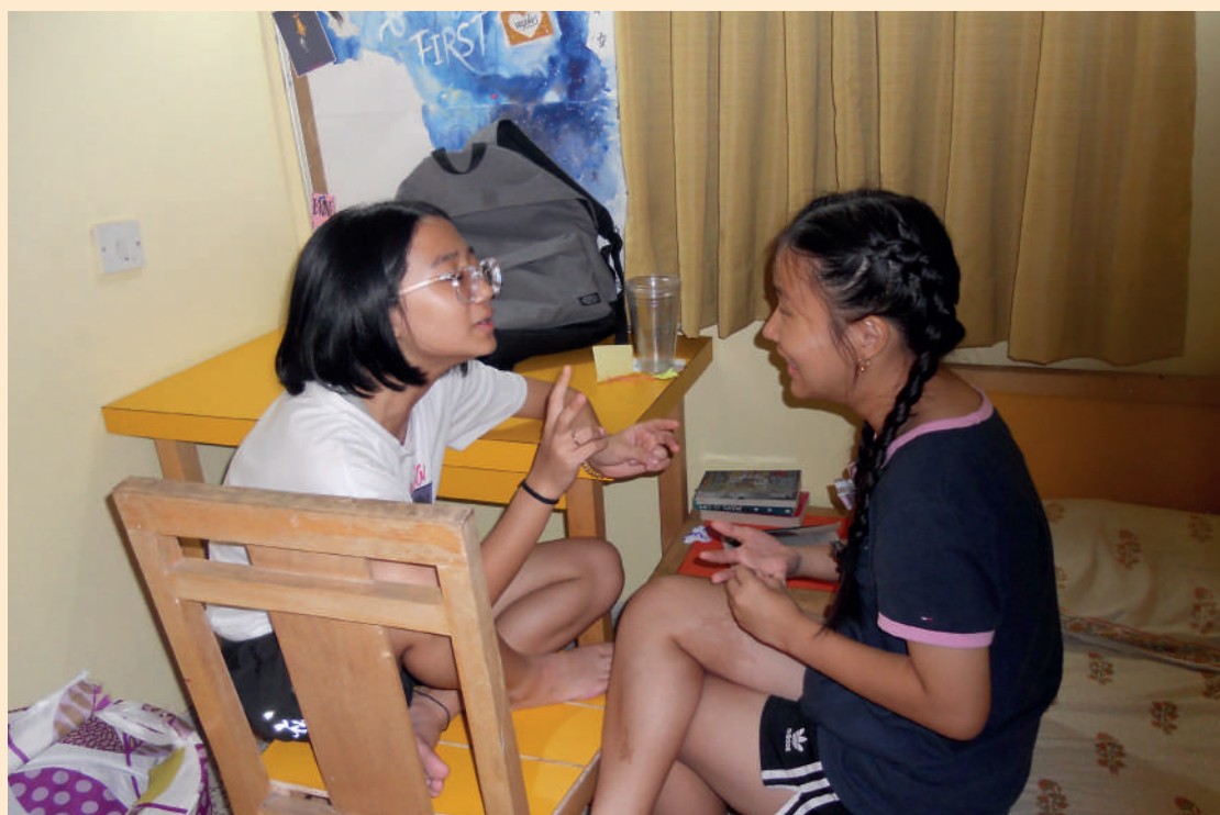
AND THE GOSSIPS...TO BE CONTINUED!