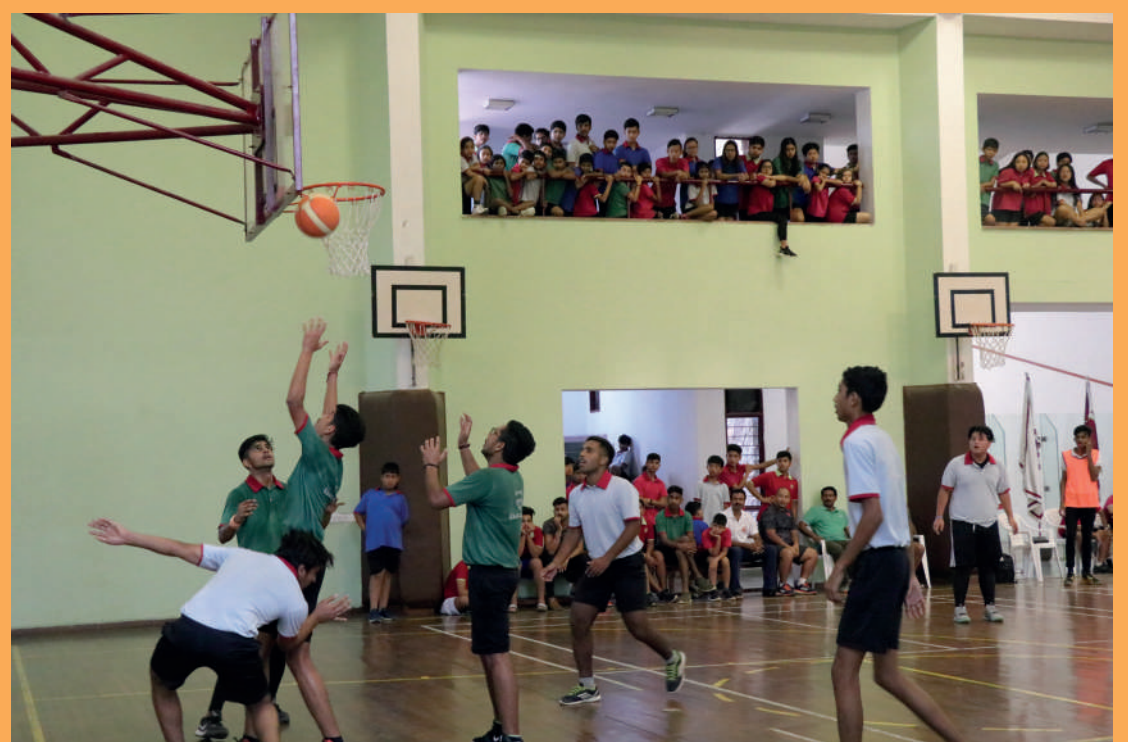
KEEP CHASING PERFECTION