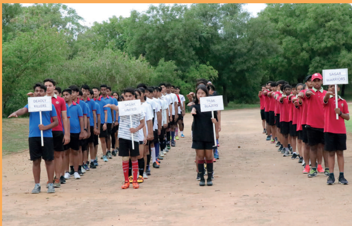
OATH OF SPORTSMANSHIP...