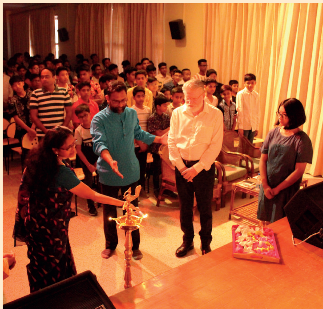
AN AUSPICIOUS BEGINNING