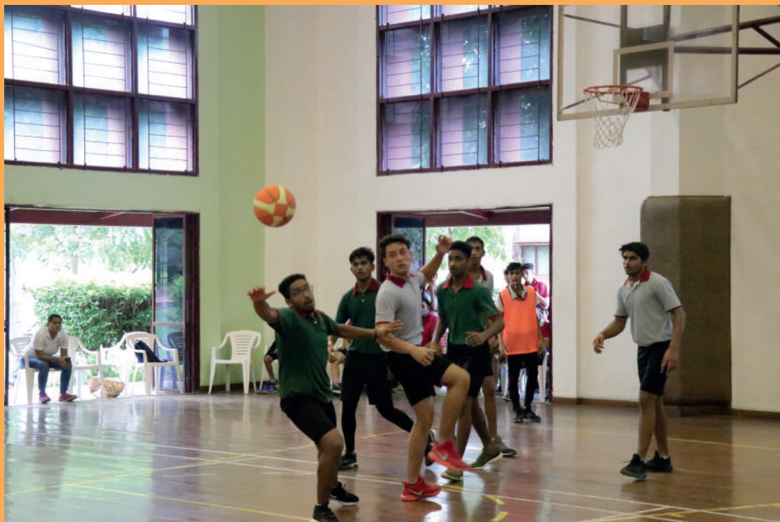
CHAMPIONS KEEP PLAYING...