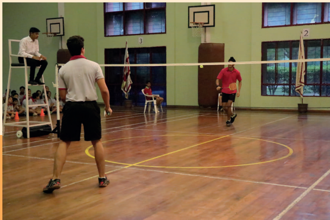
SERVE IT, SMASH IT, WIN IT, LOVE IT!

In an interesting contest held in five categories – Boys Under 19, 17 and 14; Girls Under 19 and 14 – three houses namely Diamond, Ruby and Sapphire shared the first position while the Emeralds had to be content with the fourth position.