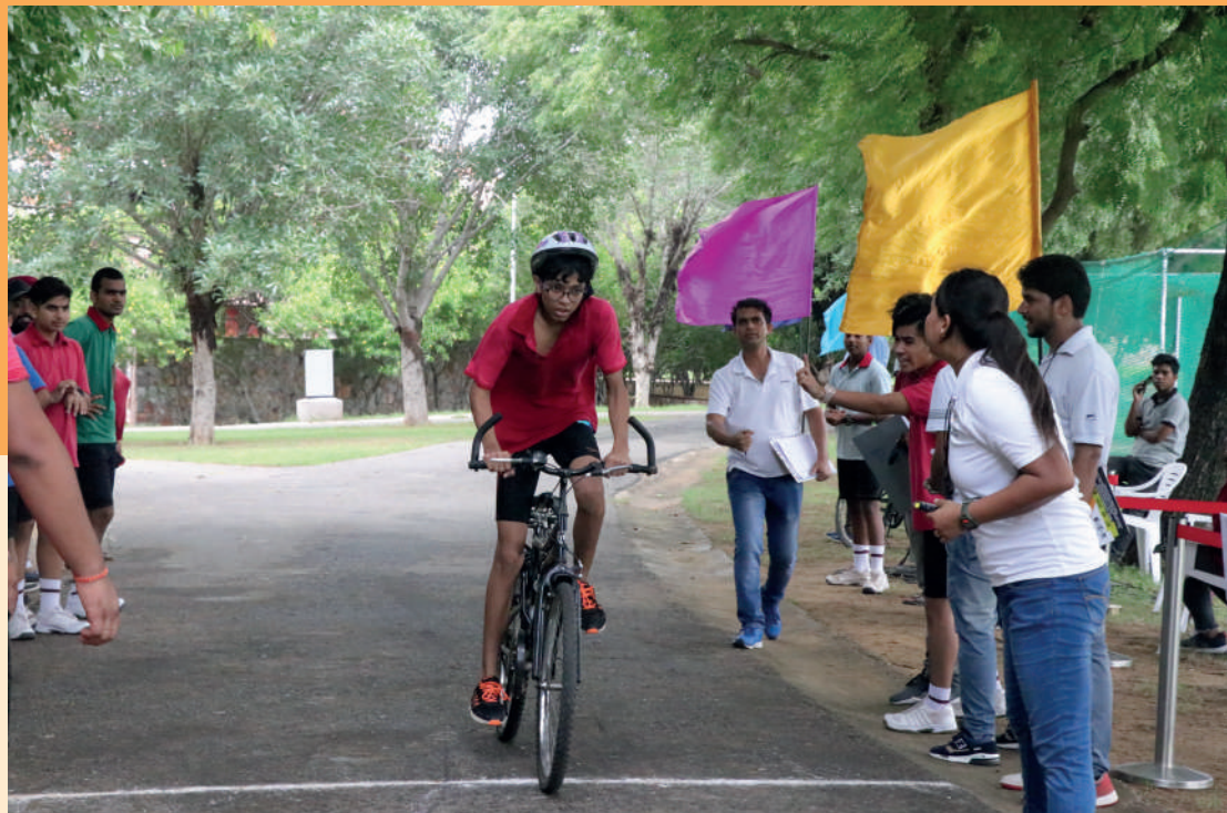
SHOW OF STAMINA AND PERSEVERANCE