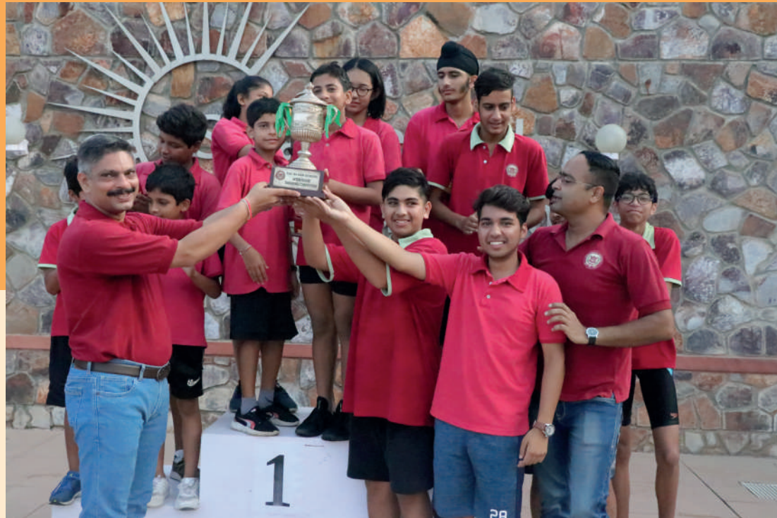
AND HARD WORK GETS REWARDED... WELL DONE!