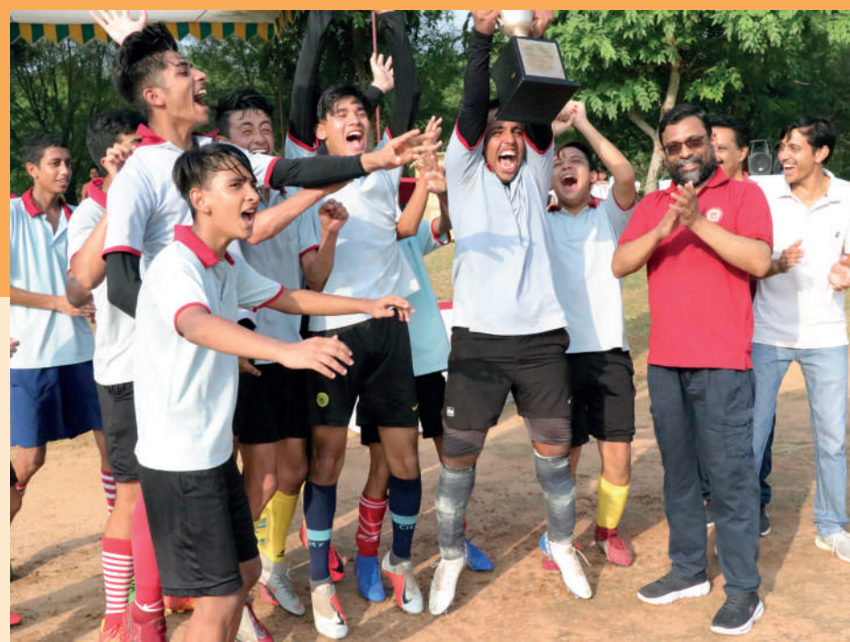
PRIDE, PASSION...AND VICTORY!