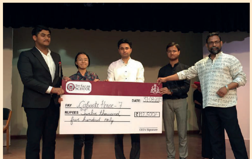
REWARDS ARE ALWAYS SO MOTIVATING...