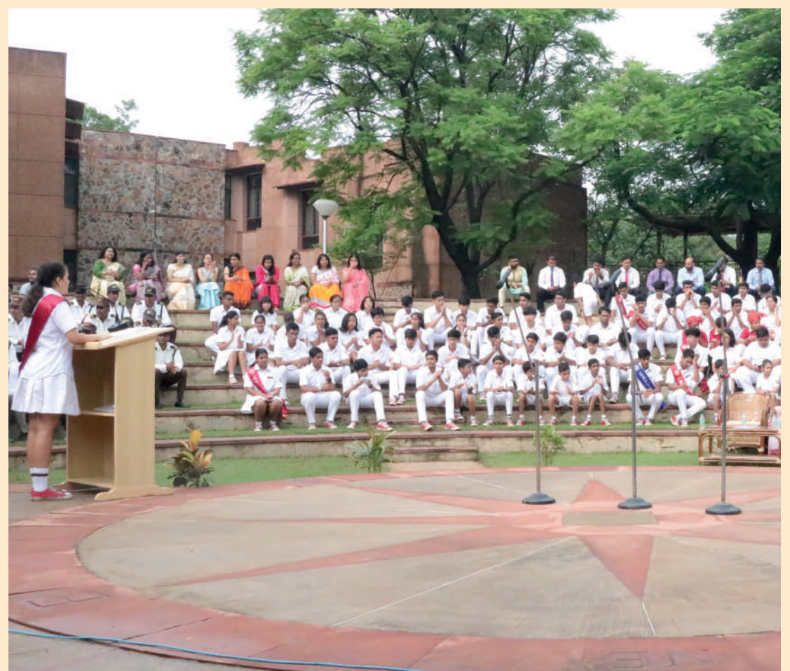
INTRODUCTORY SPEECH BY HEAD GIRL