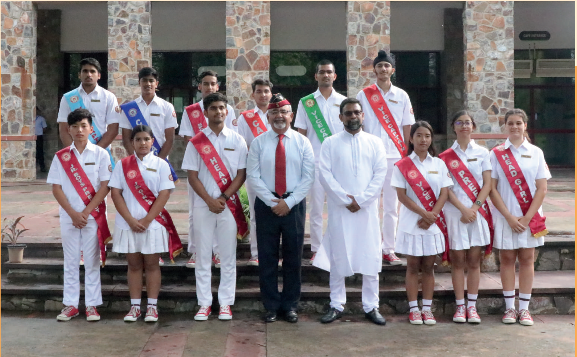
HON'BLE CHIEF GUEST WITH THE SCHOOL REPRESENTATIVES