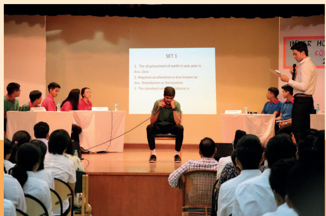
THINKING THROUGH THE ANSWERS