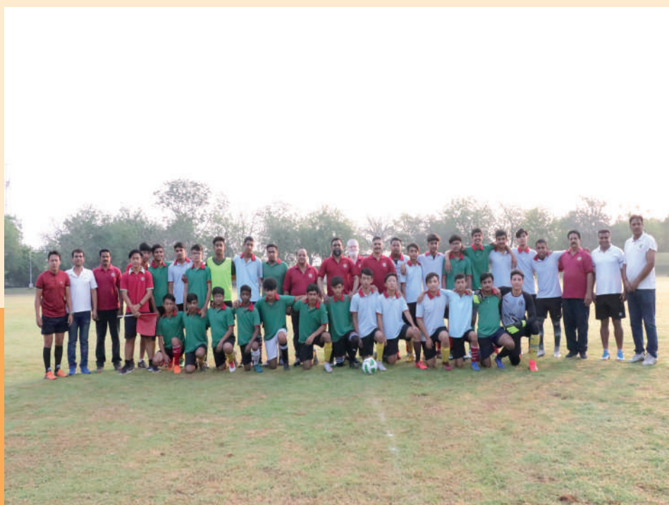
ALL GEARED UP... GET SET GO!