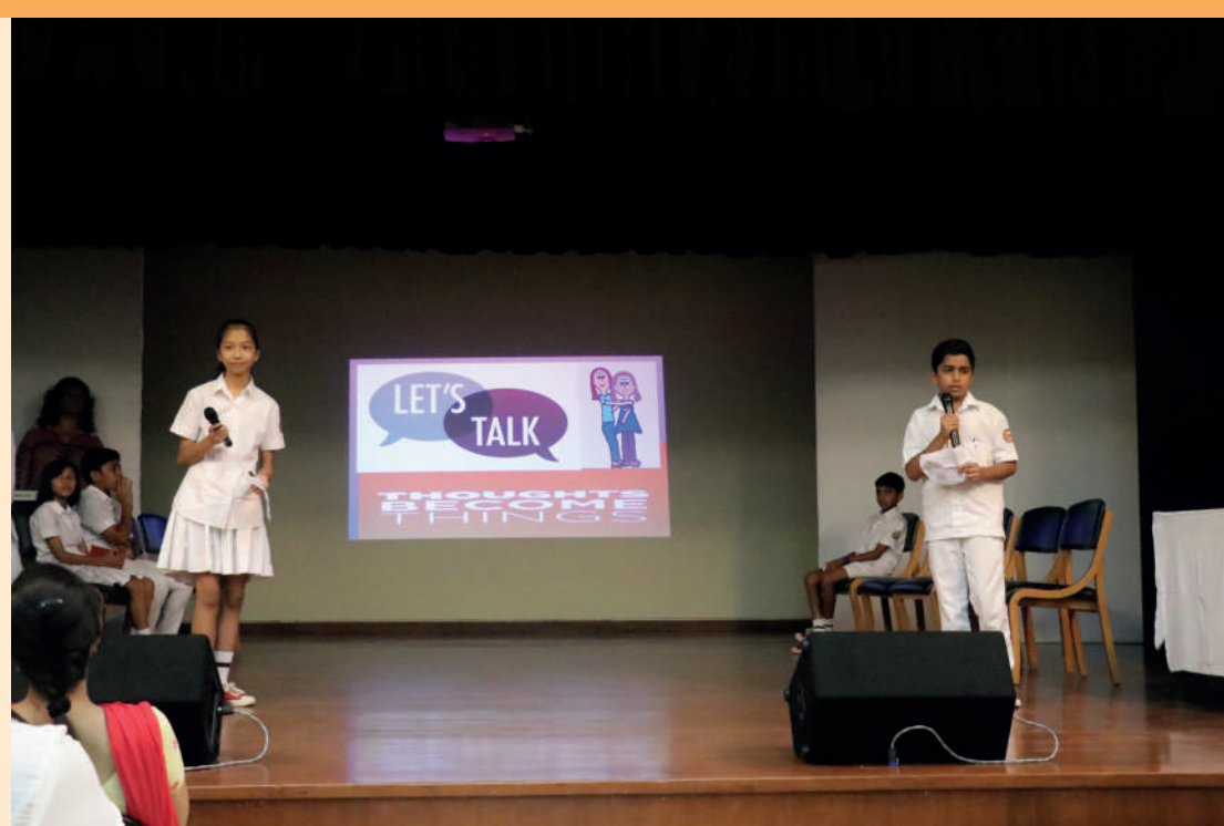
ARE YOU READY TO TAKE THE CHALLENGE?