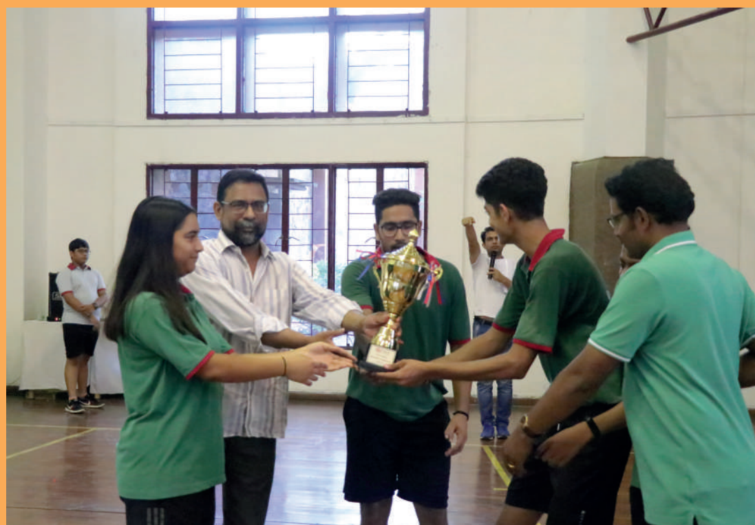
THE WINNERS WITH THE TROPHY