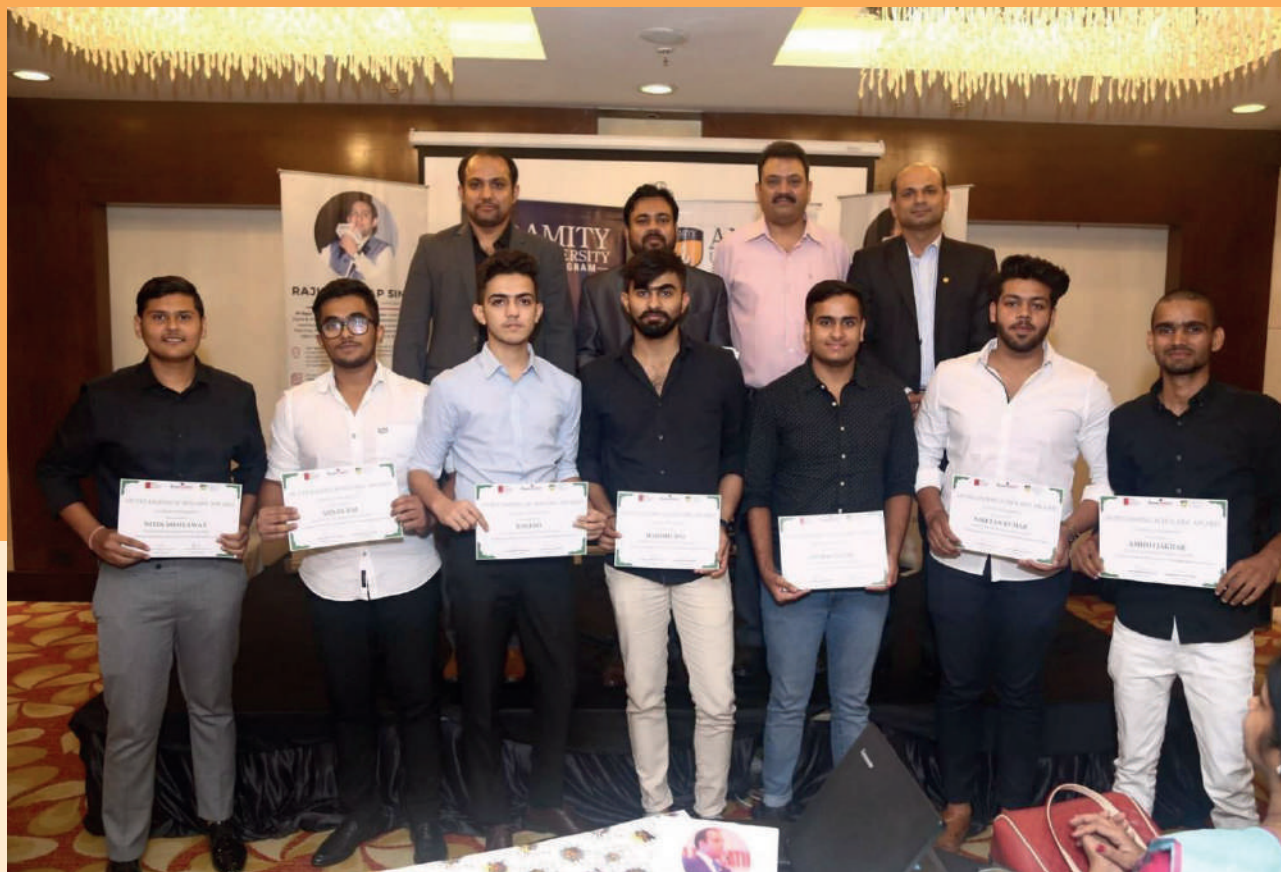
ACHIEVERS BEING REWARDED...