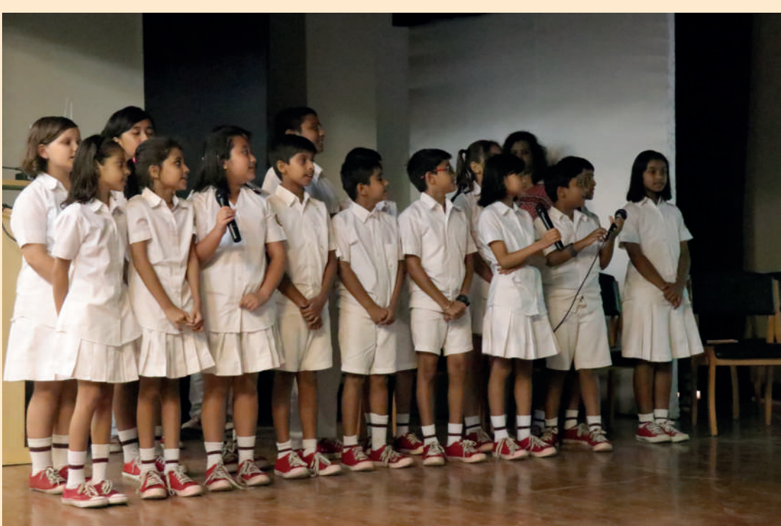
SOME BONDS ARE BEST EXPRESSED THROUGH MUSIC