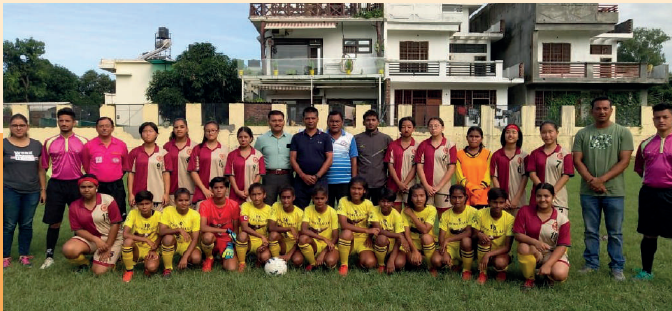
THE PARTICIPATING TEAMS...

Our Girls' Under-17 Team participated in Subroto Cup Nationals Qualifying Tournament held at Dehradun and secured third position. Better luck next time.