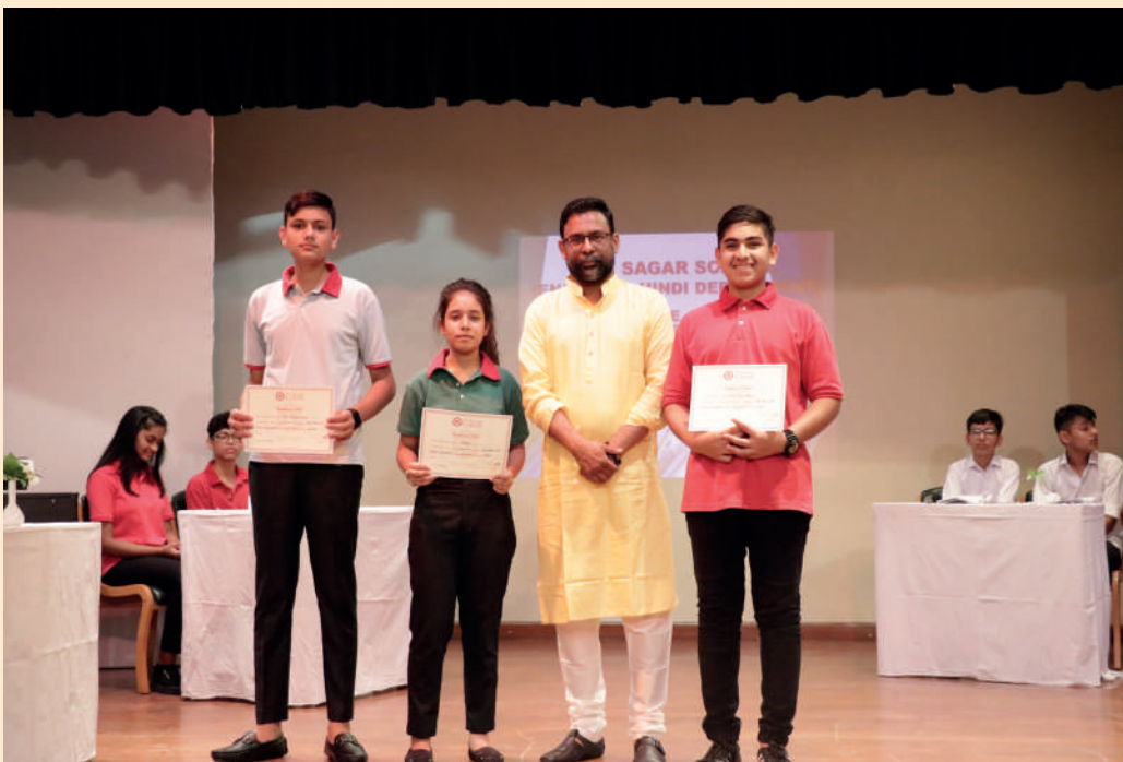
BRILLIANT SPEAKERS BEING FELICITATED BY THE PRINCIPAL