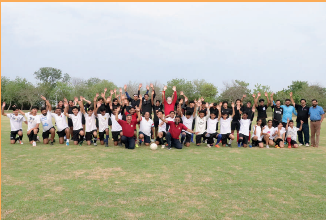
WE HAVE A FOOTBALL LEGACY

The league was revived this year with Sagar United and Sagar Trailblazers contesting in the finals. The finals was won by the Sagar United.