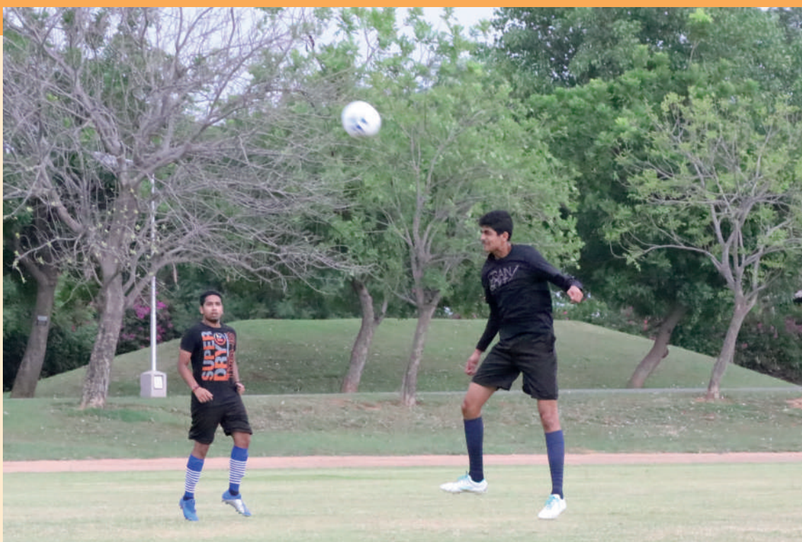
BEST MODE ACTIVATED