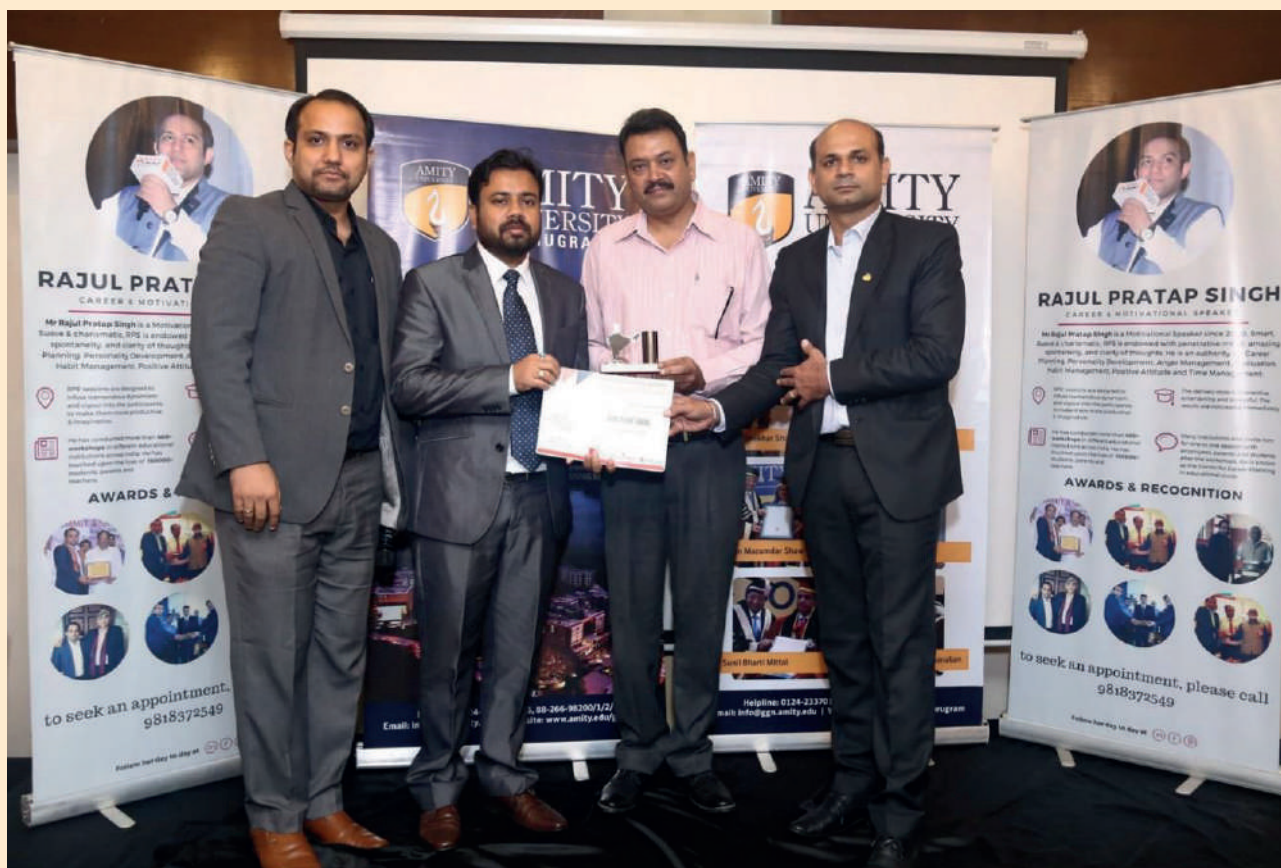
MISSIONS ARE MADE POSSIBLE WITH GREAT MENTORS...