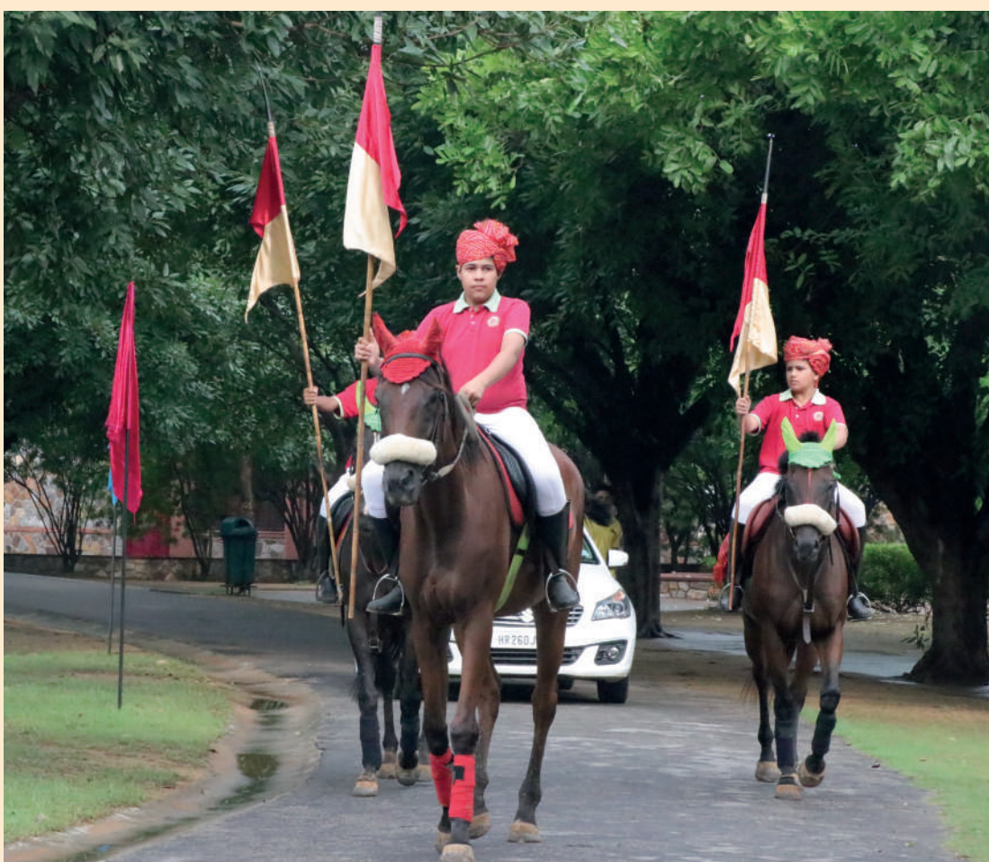
CHIEF GUEST BEING ESCORTED BY THE EQUESTRIAN'S