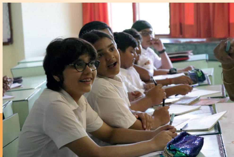
EVER IMAGINED POETRY COULD BE THAT FUN?