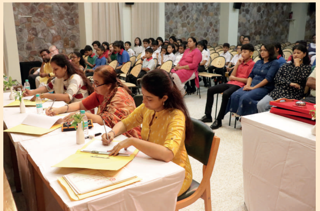
A TOUGH JOB FOR THE JUDGES!