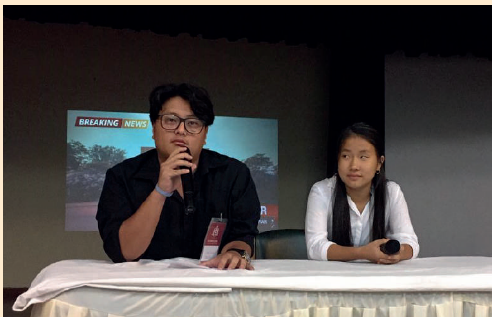
ACTIVE PARTICIPATION BY STUDENTS IN THE TWO-DAY WORKSHOP