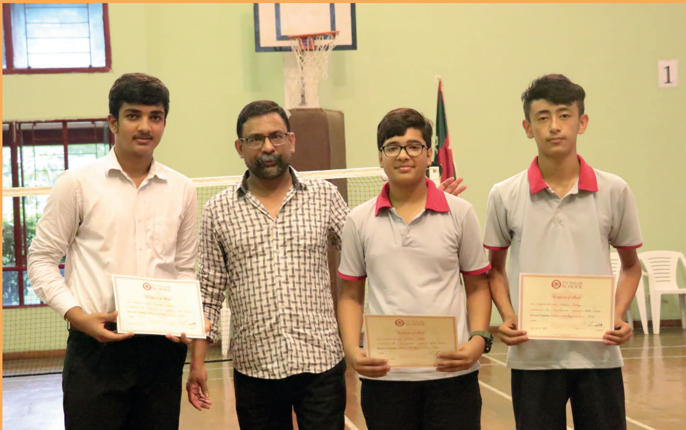
VICTORY IS IN HAVING DONE YOUR BEST