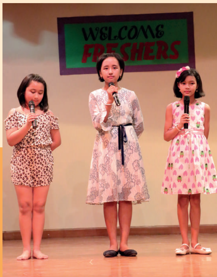
DELIGHTFUL AND MELODIOUS