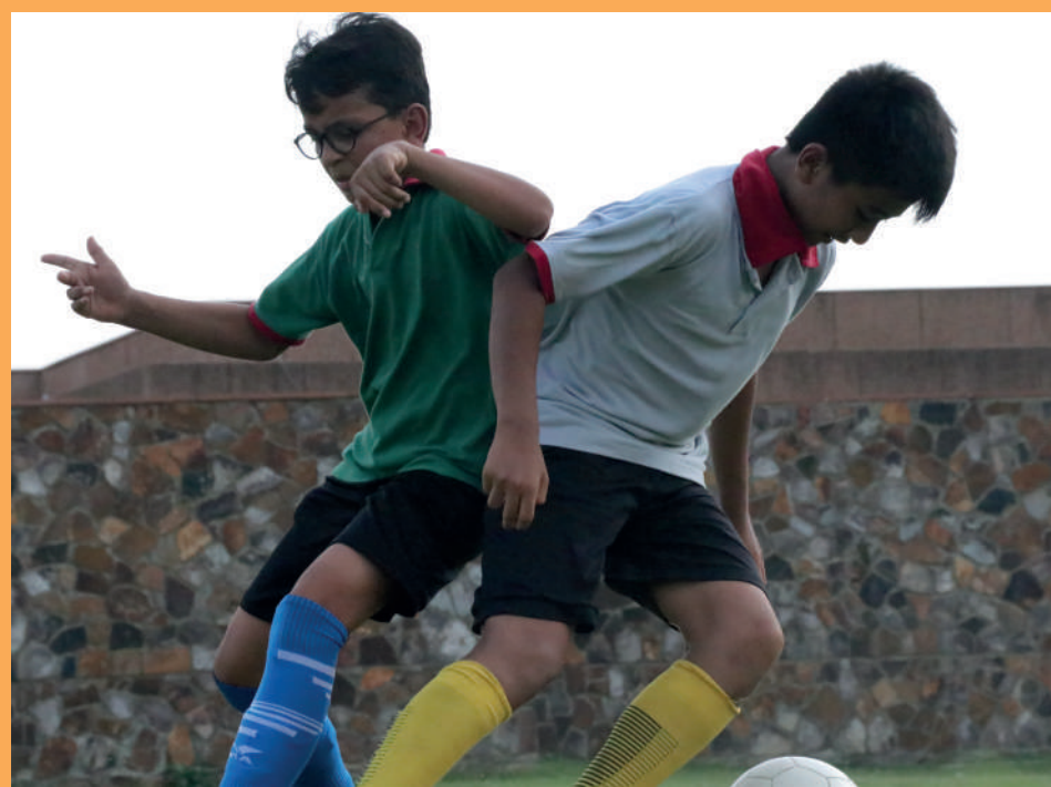
BEND IT LIKE BECKHAM!