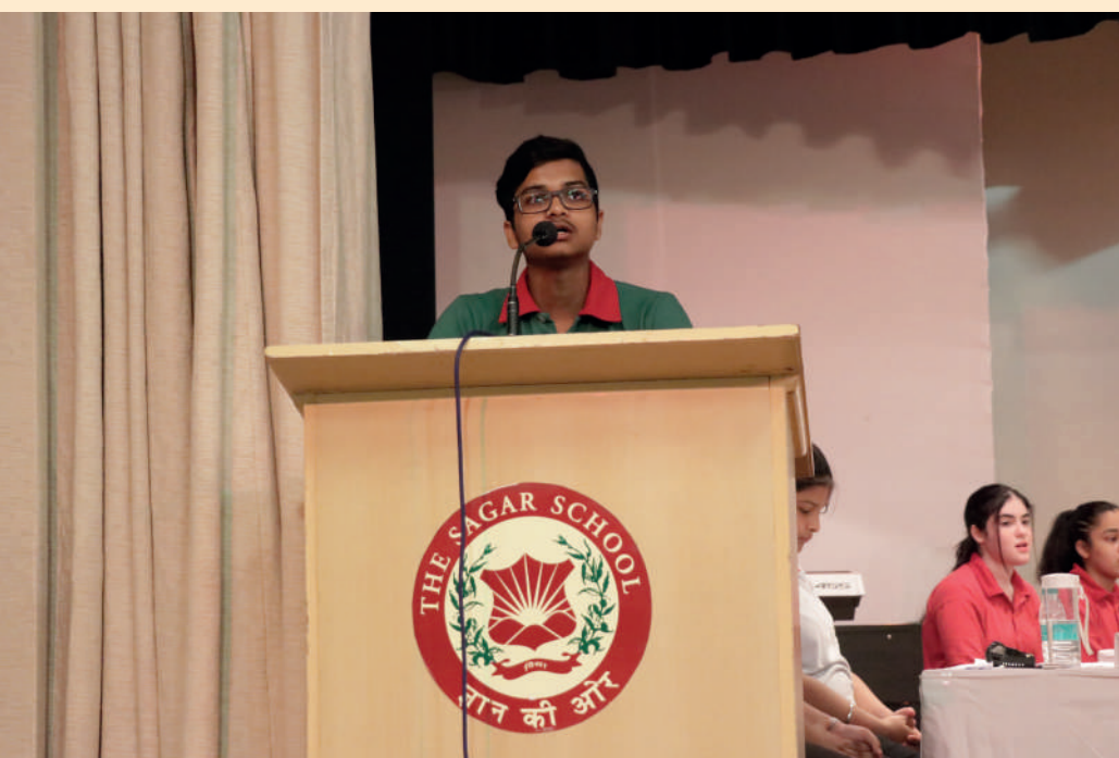
CONFIDENT SPEAKER MAKING A MARK