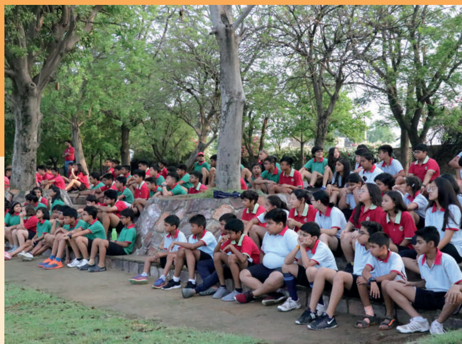
IT'S NOT ONLY THE GAME, IT'S AN EMOTION...