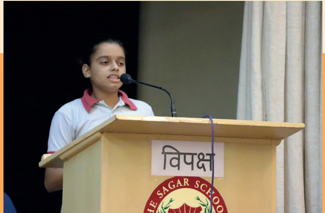
BOOKISH EDUCATION BETTER THAN EXPERIENTIAL EDUCATION?... I DISAGREE