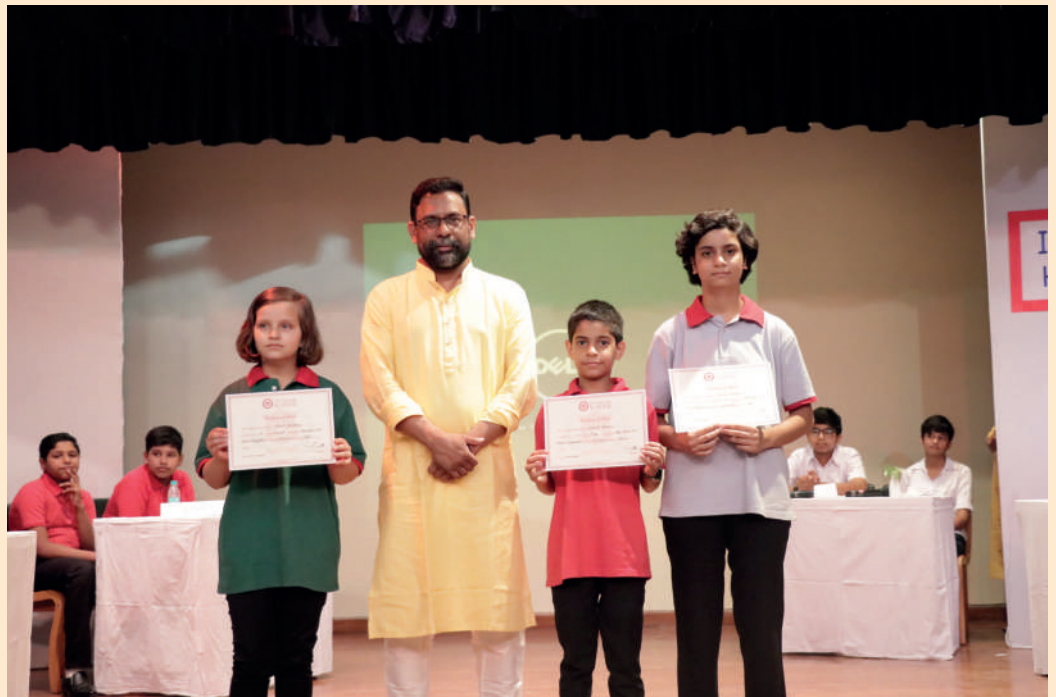
BUDDING SPEAKERS BEING AWARDED