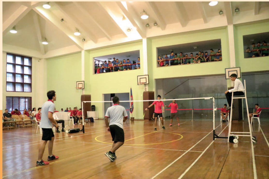
WE LET THE RACQUETS DO THE TALKING