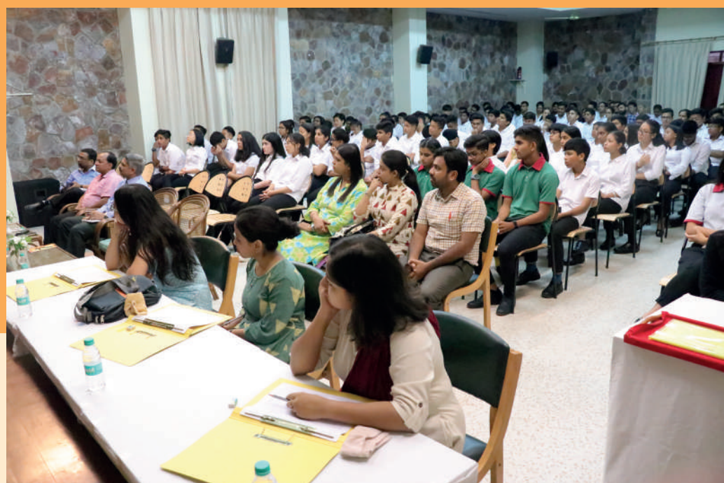
LISTENERS IN RAPT ATTENTION!