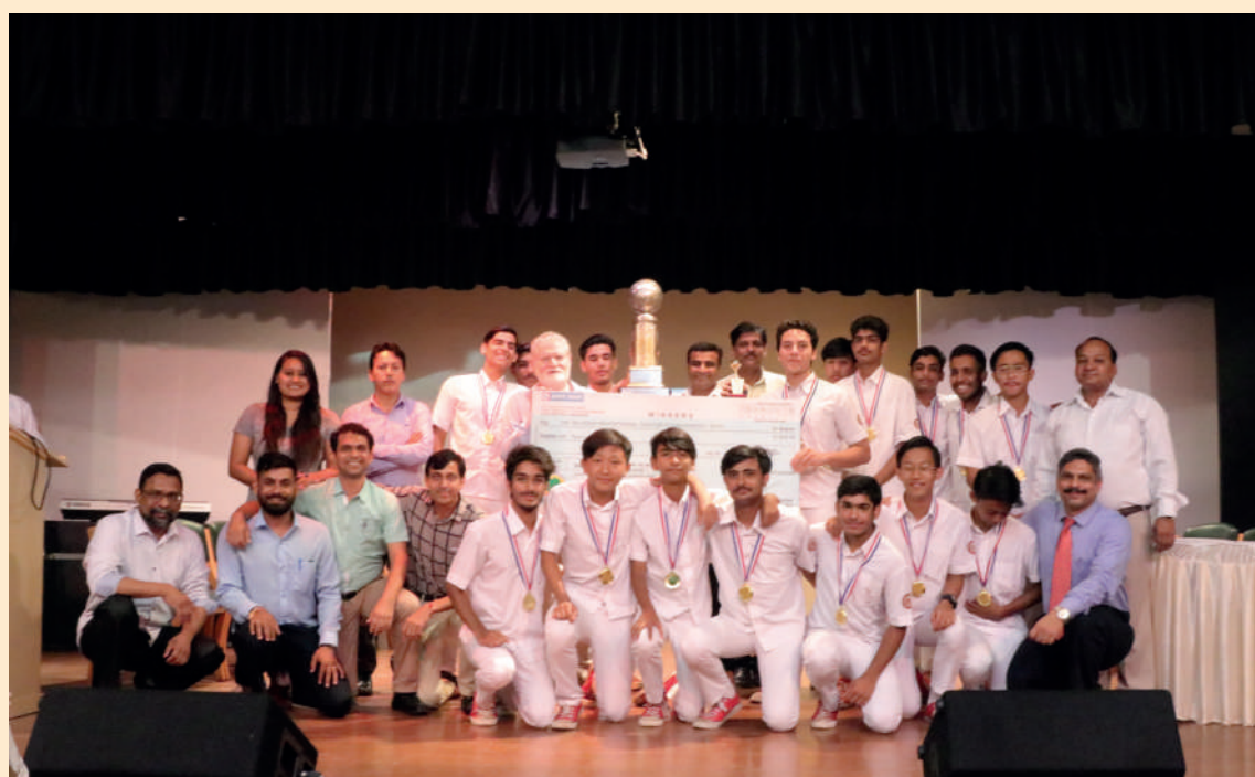
TEAMWORK MAKES THE DREAM WORK... THE CHAMPIONS!

A double whammy for me – I was adjudged the 'Best Goalkeeper' in the tournament.