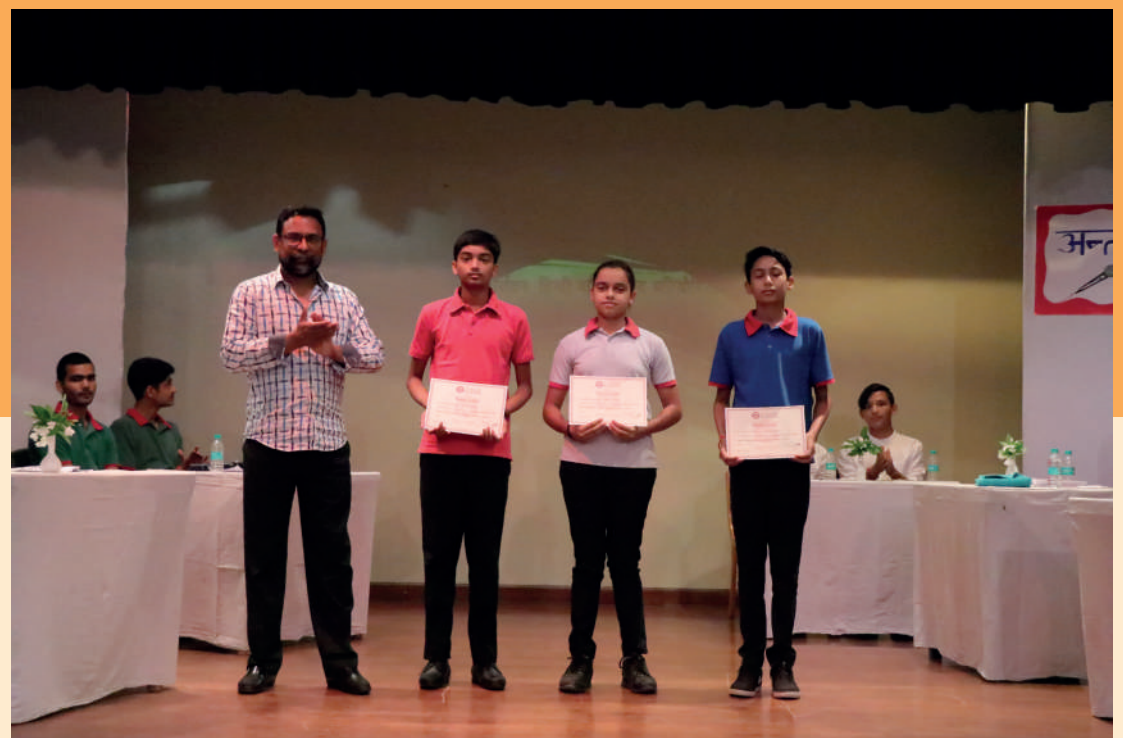
AND THE WINNERS ARE!