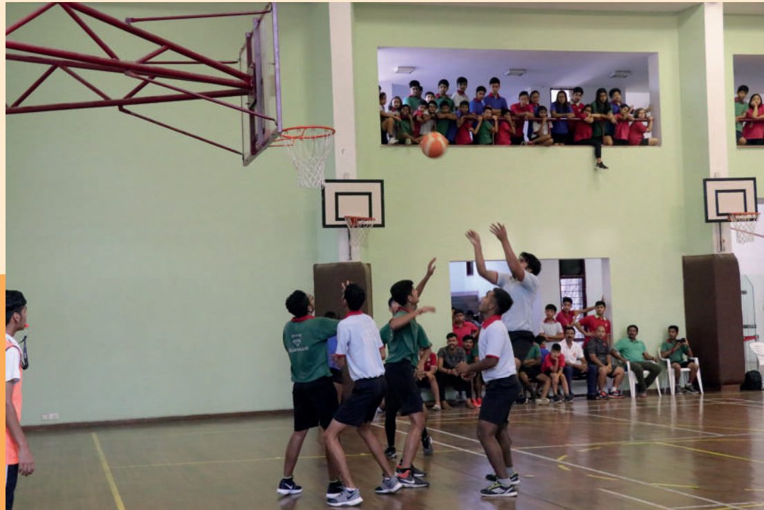
ACTION IN FULL SWING

“Success comes from knowing that you did your best to become the best that you are capable of becoming.” The Inter House Basketball Championship was a well contested event in which Emeralds stole the show, followed by Diamonds in second.