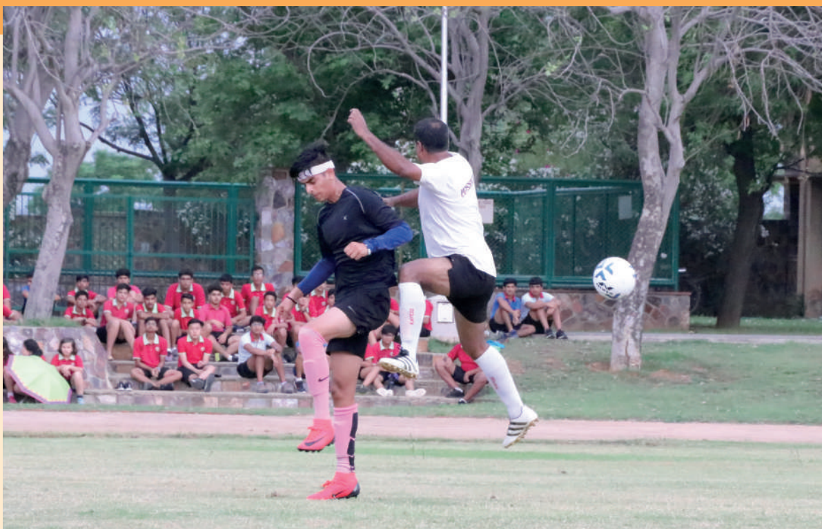
HUSTLE, HIT AND WIN!