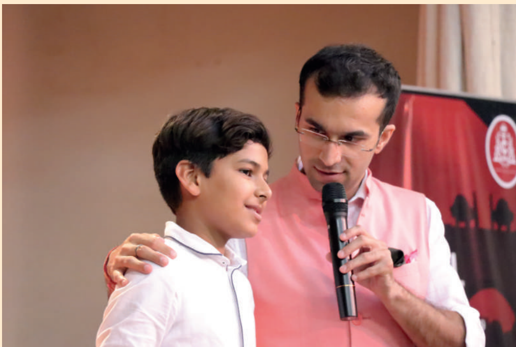
THE BEGINNING OF A GREAT EXPERIENTIAL PHENOMENON...