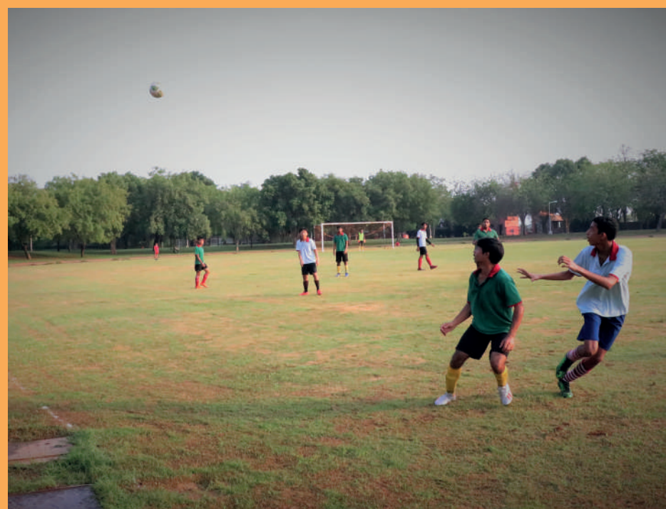
PLAY LIKE A RAVEN ABOVE THE CROWD...