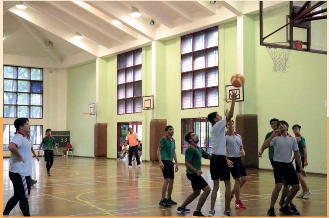
PRACTICE MAKES A GOOD SPORTSMAN...