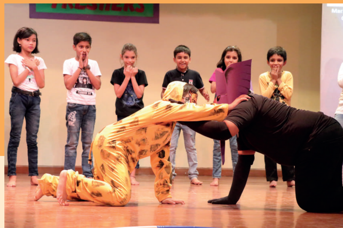
THE YOUNGEST MEMBERS ROCK THE STAGE!