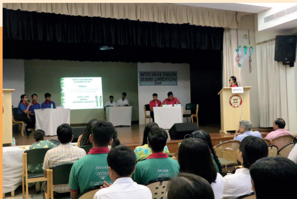
A FIERY REBUTTAL ROUND

The Best Speaker and the Most Promising Speakers were felicitated by the Principal.