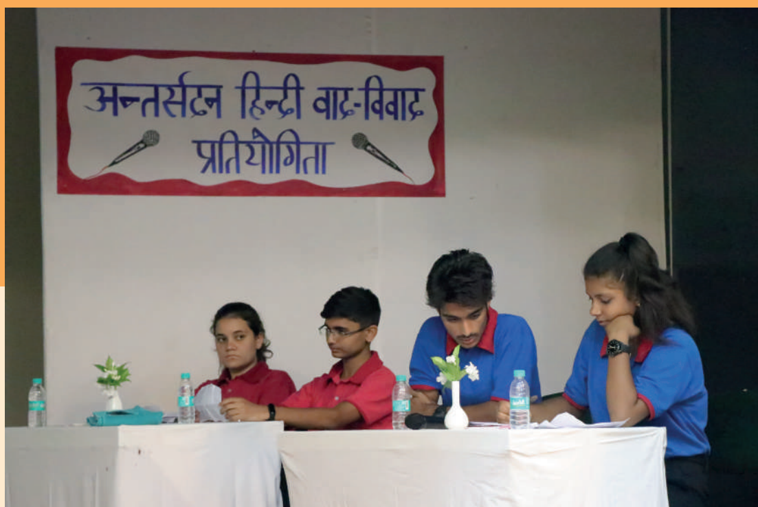
WELL SET TO ARGUE!