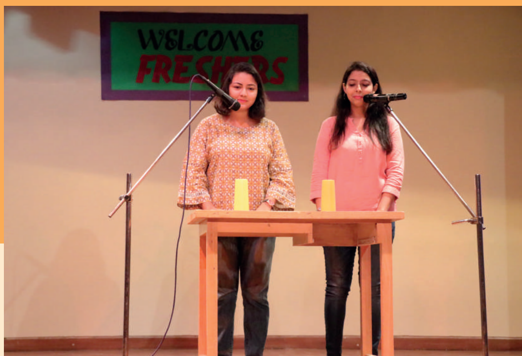
NO LESS THAN ANNA KENDRICK! MESMERISING THE AUDIENCE WITH 'WHEN I AM GONE'