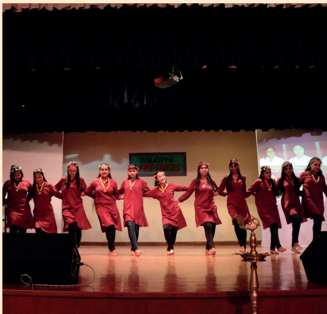
TUNED TO THE SAME BEAT