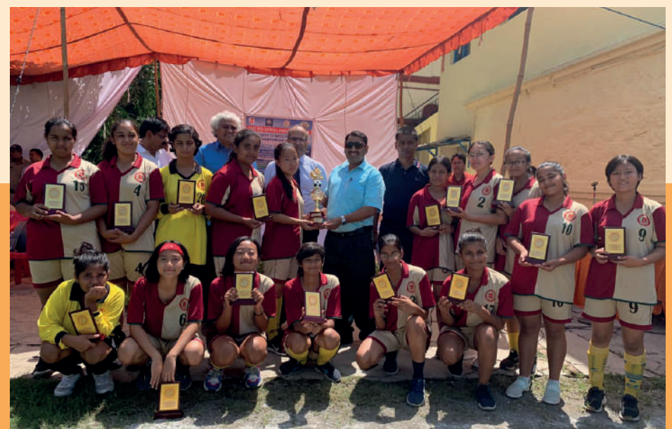
WELL...WE WOULD BE BACK WITH A BANG!