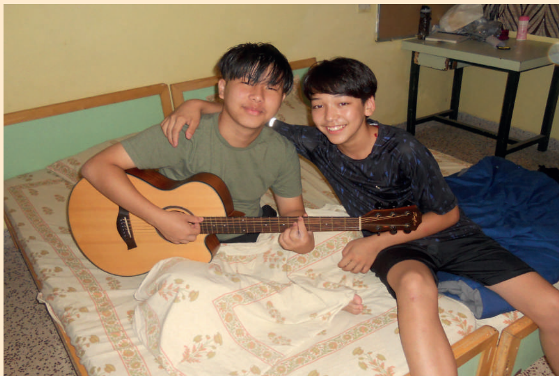
TOGETHER WE CREATE MEMORIES FOR LIFE