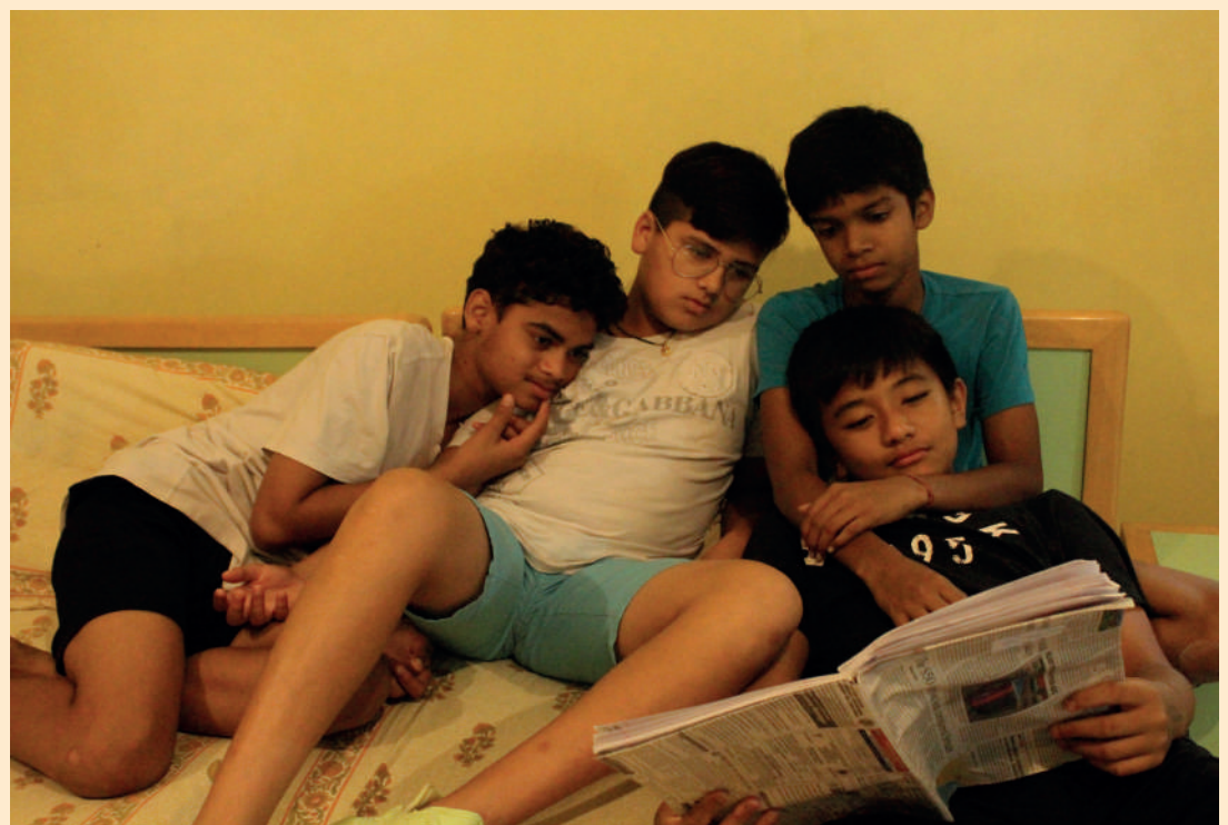
MOMENTS TO BE CHERISHED FOREVER...