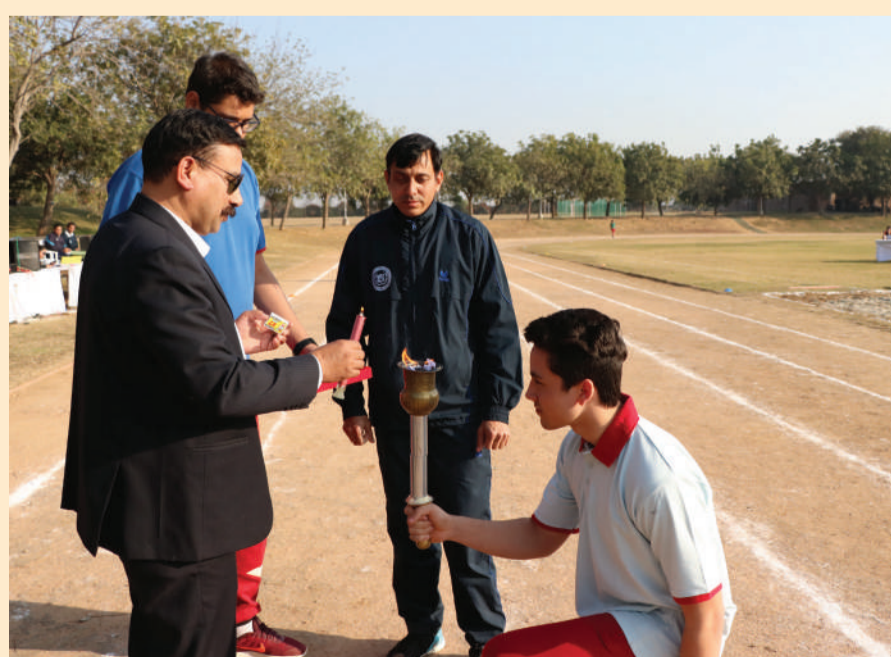
LIGHTING THE TORCH...

The championship was held in three categories; ‘A’ Division forming up with boys under-19; ‘B’ Division consisting of boys under-14; and ‘C’ Division comprising all the girls. In the three days’ championship, the standings of Houses changed many times over. While Emeralds led the first day, it was eventually the Sapphires who outshone the others on the final day. They beat Diamonds by a reasonable margin in the end for the top slot, followed by Emeralds and Rubies.