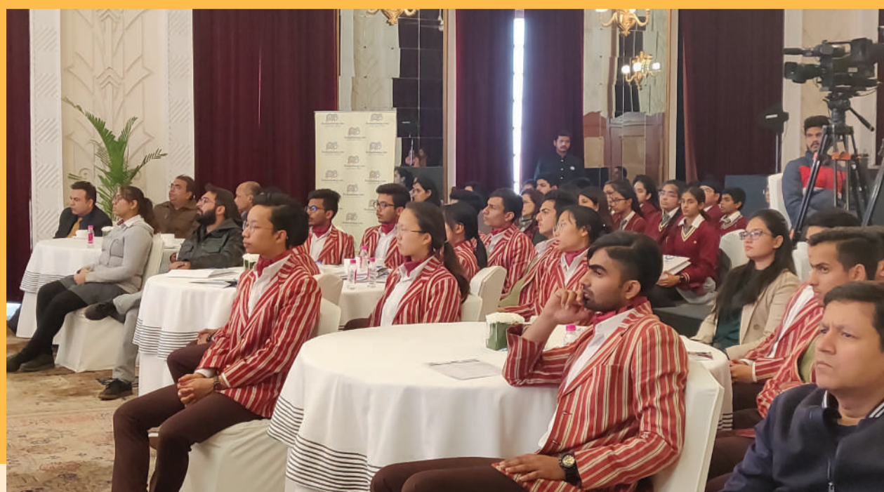
SAGARIANS ASPIRING TO STUDY ABROAD...

One Globe 2019 was held on February 1 and 2, 2019 in New Delhi. Our senior students (Class XII) attended this event with a view to exploring study abroad options after their schooling. At the conference, students were briefed on the procedures to secure admission into foreign universities by the faculty of those universities. Amongst many things, the faculty spoke about, various courses being offered, academic requirements for entry, the finances and how to put forward a letter to universities for scholarships, how to prepare and go about SAT & TOEFL exams.