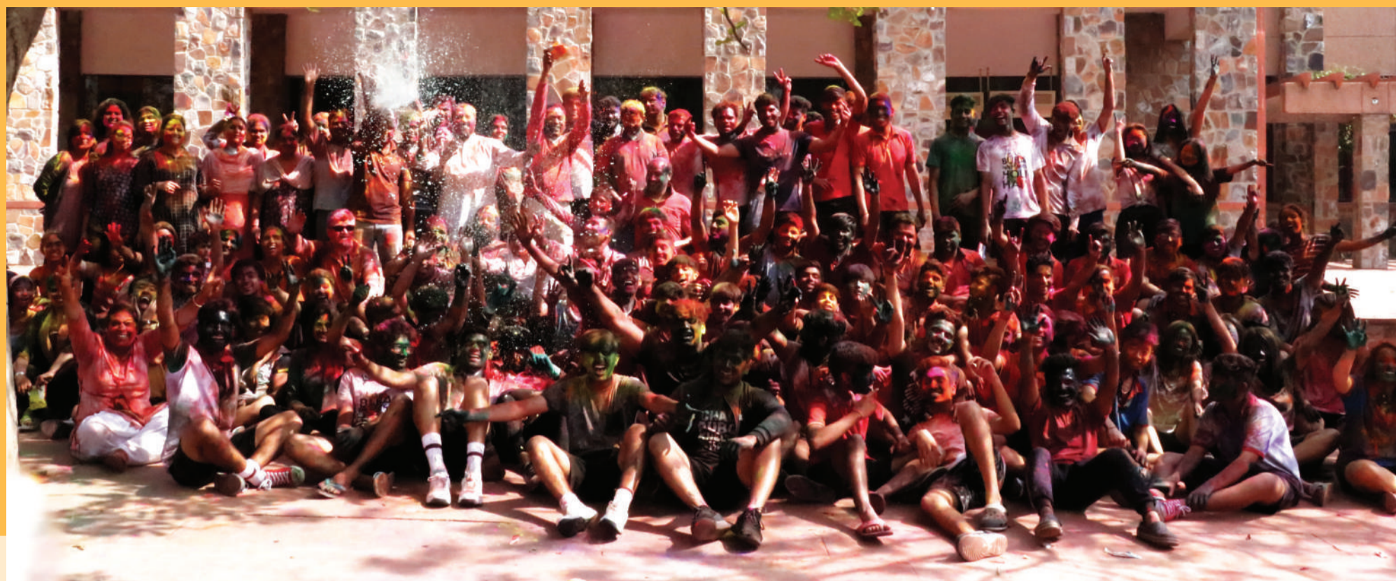
THE COLOURFUL COMMUNITY – LITERALLY!

As the spring arrives, Sagarians reach out to unwind and de-stress themselves, bonding over the tinctures of gulal, gujiyas and thandai! Very fittingly, the students and teachers ganged up in their own ways to splash colours, dance and rejoice the music. Such mornings filled with mirth and merriment amidst the board exam stress is an exemplary Sagarian trait of ‘grace under pressure’.