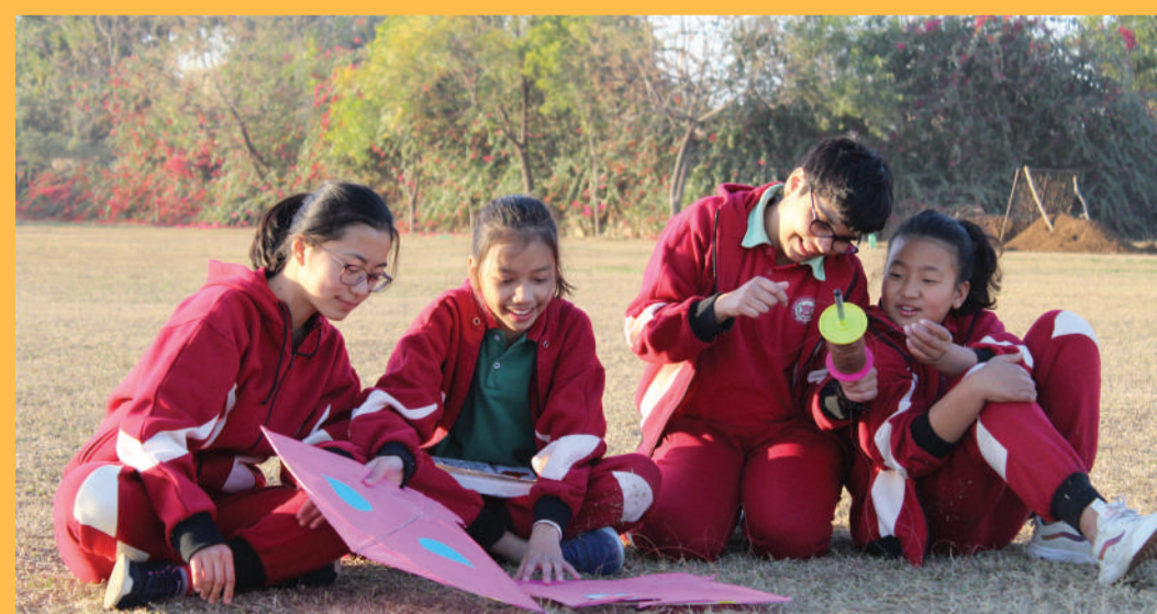
KITES ON MAKAR SANKRANTI