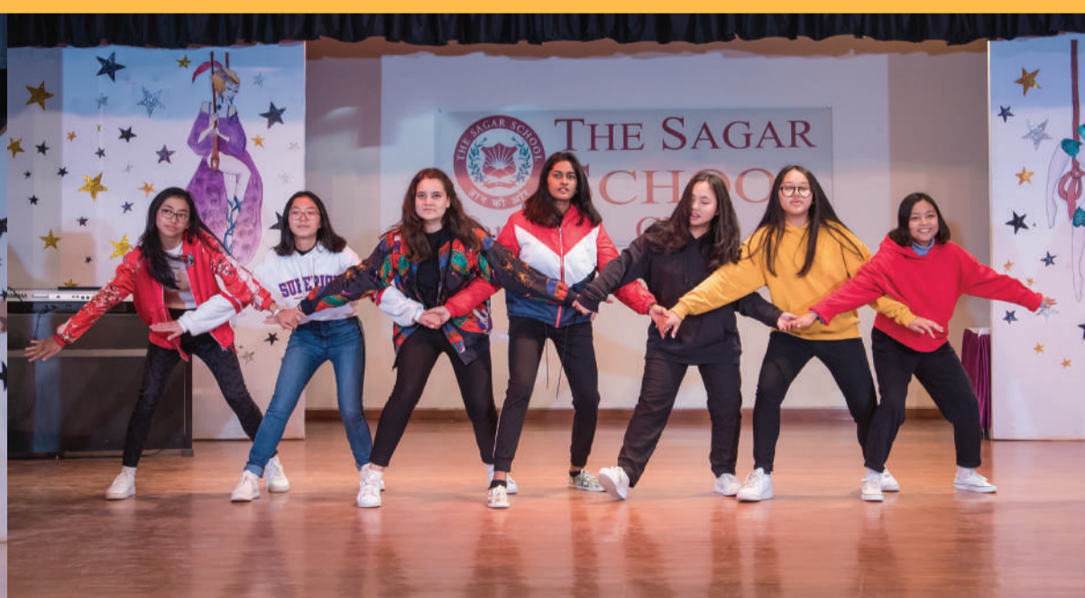
HUM KISI SE KUM NAHIN – DANCERS ON STAGE!