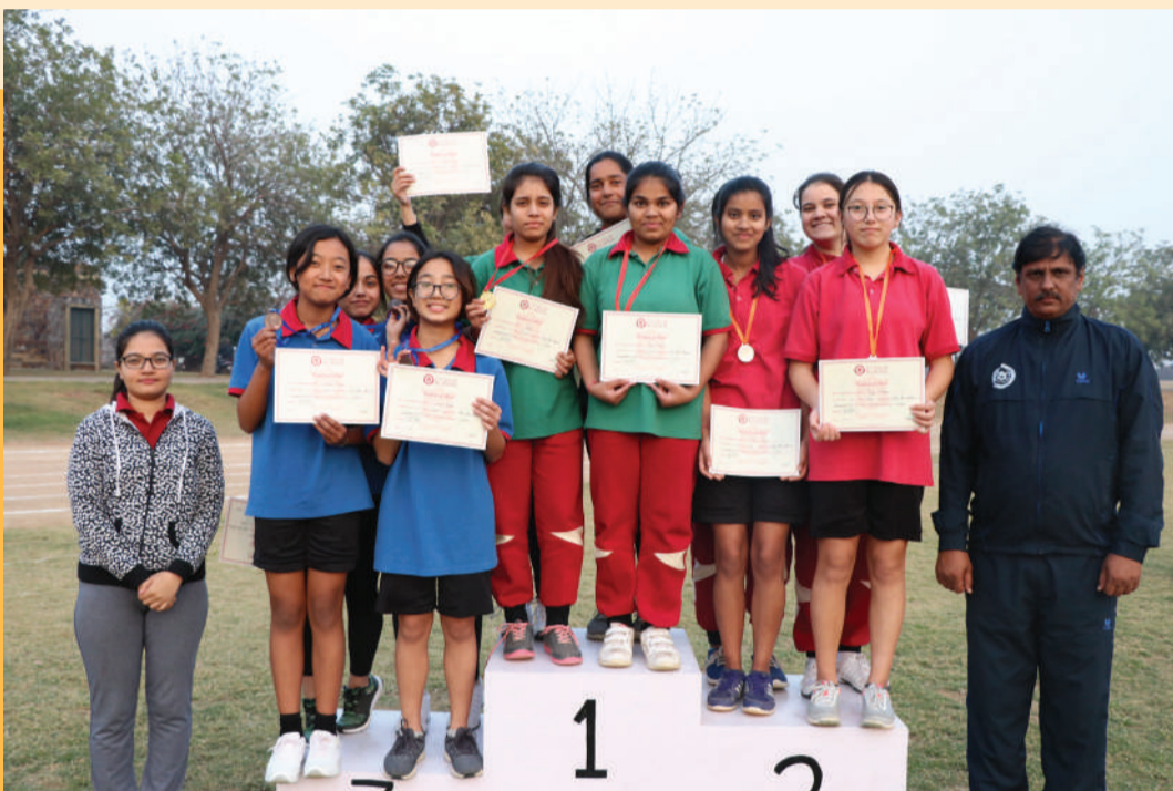
THE RELAY RUNNERS...