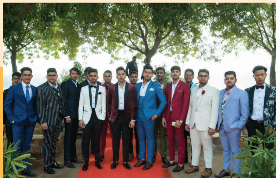
YOUNG MEN STRIKING A POSE