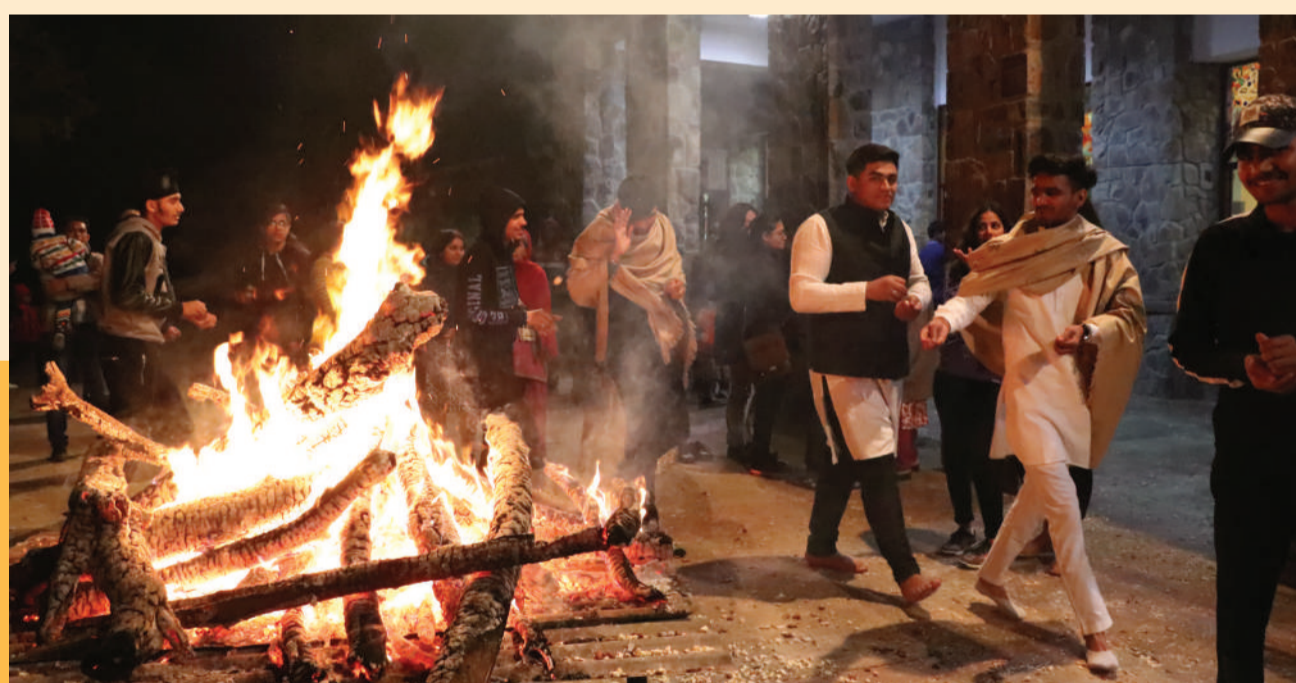
SAGARIANS KNOW THE RITUALS

Spreading smiles and joy with the bonfire, folk music, rewari and peanuts, Lohri was celebrated in the peak of winter cold. The whole school joined in the togetherness and festivity filling all their hearts with warmth and hope. The next day, marking the occasion of Makar Sankranti, the students as well as their teachers indulged in the exciting kite flying show. The soaring kites dotting high up in the sky was a picture-perfect sight!