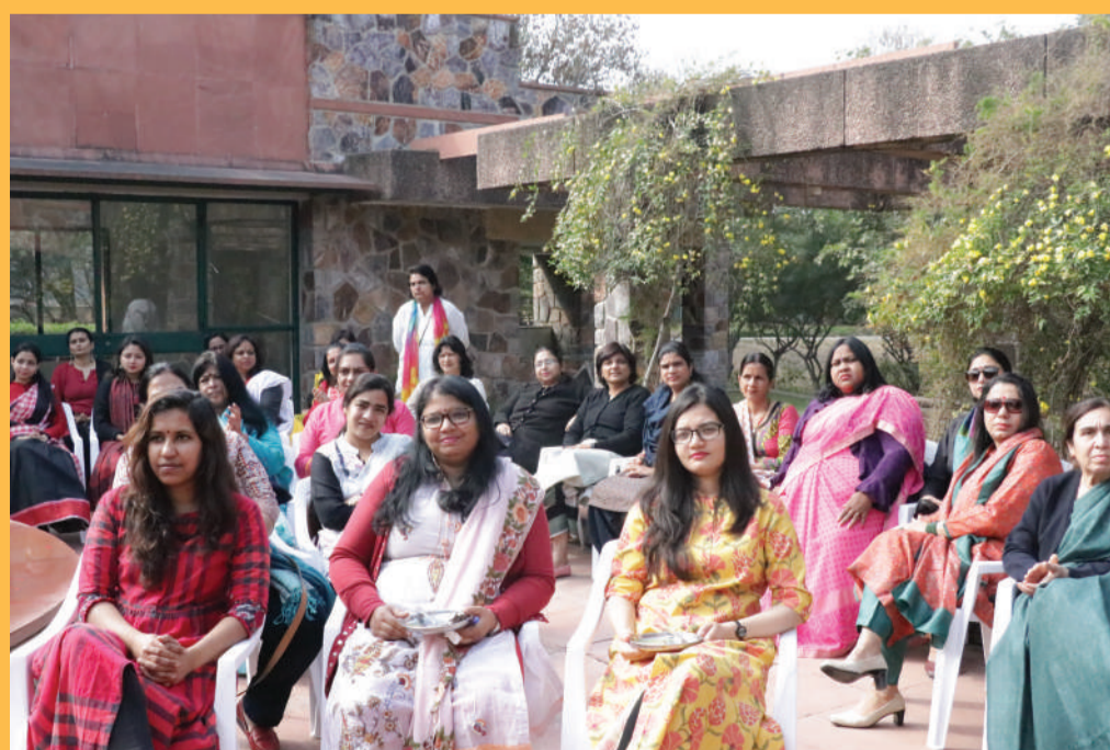
WOMEN'S DAY CELEBRATIONS