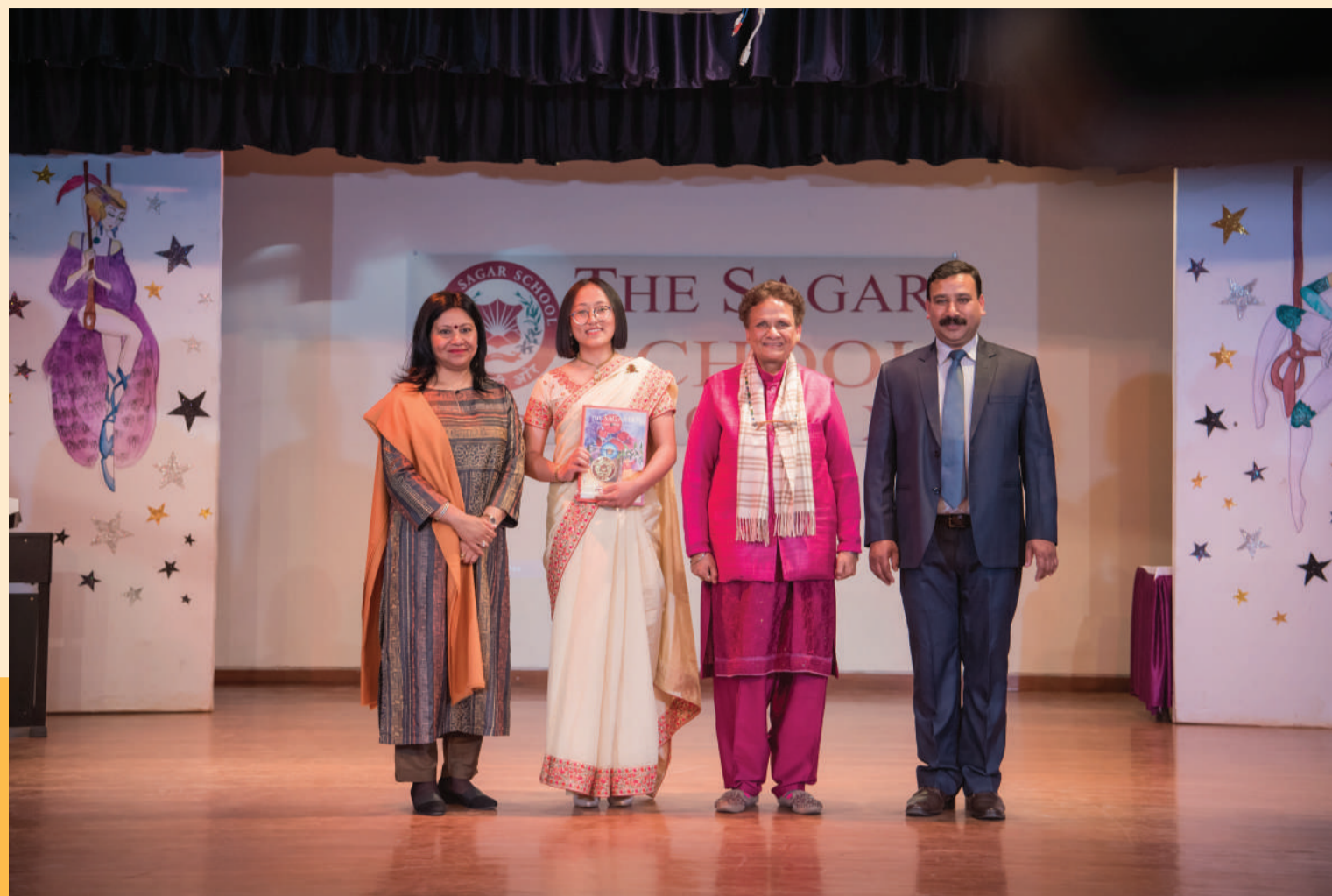
RECEIVING THE SAGARIAN BADGE AND THE MAGAZINE

The grand event was followed by a football match between the outgoing class and the rest of TSS. The match went to the Class of 2019 as a befitting send off from the sports field.