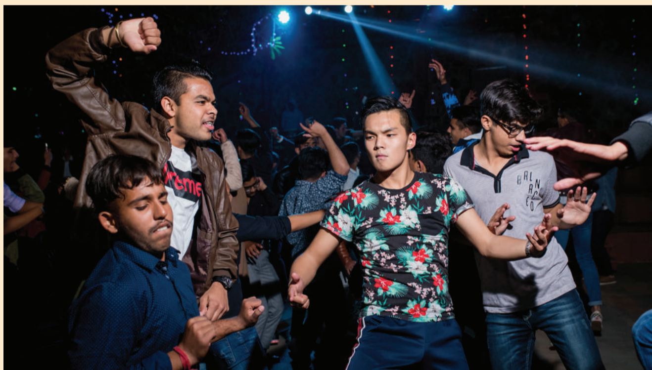
YOU CAN'T TOUCH THIS...MC HAMMER STYLE!