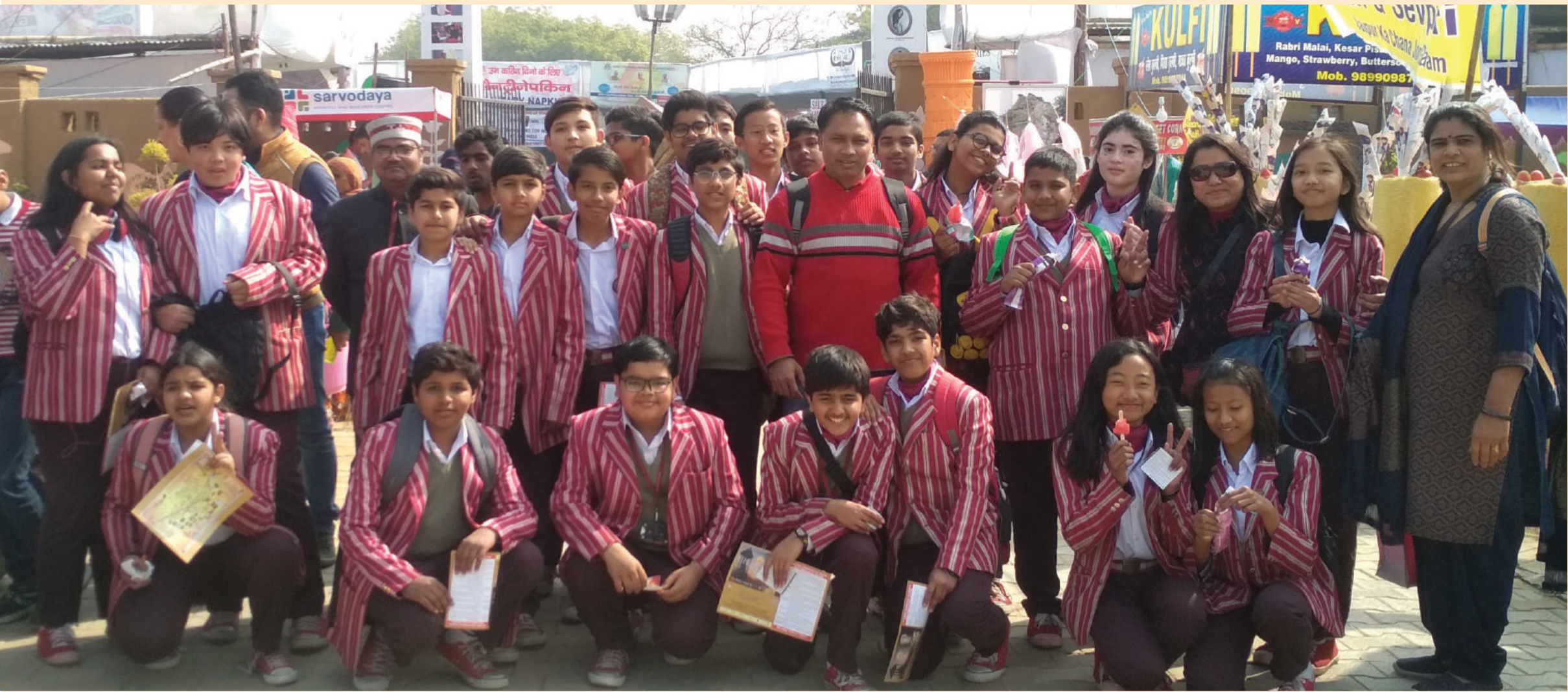
SAGARIANS AT SURAJKUND MELA...