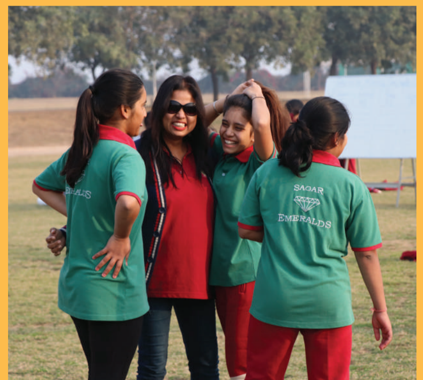
EMERALD GIRS AFTER WINNING A RACE...