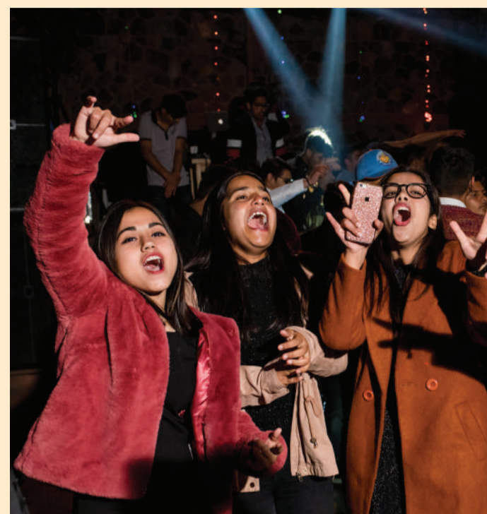
IT'S SELFIE TIME!