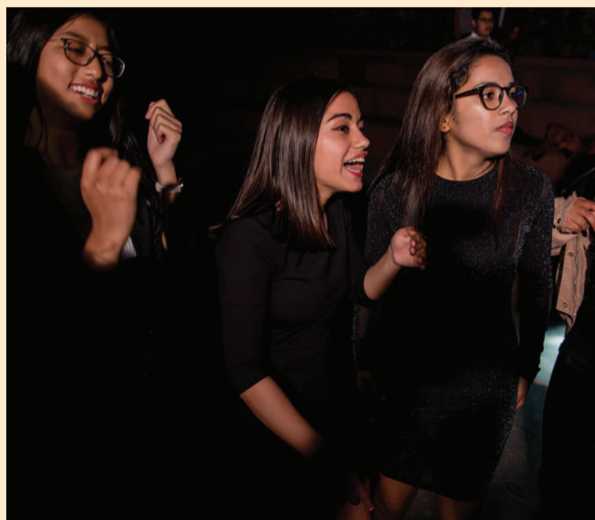
JARA-HAT-KE DANCERS OF TSS...