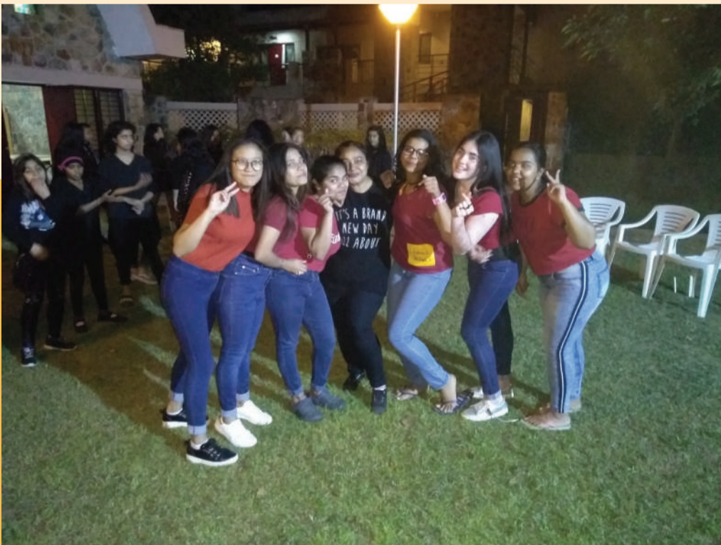
PARTY TIME AFTER WINNING!