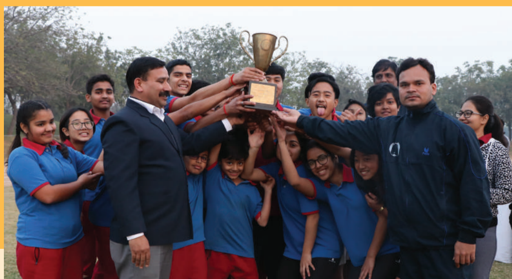
SAPPHIRES SAPPHIRES ALL THE WAY...