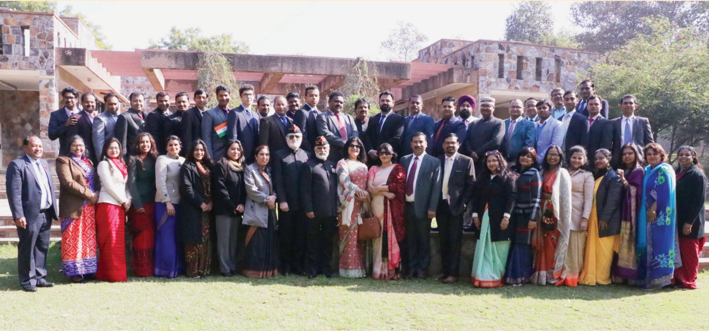
THE PROUD STAFF POSING WITH THE CHIEF GUEST ON REPUBLIC DAY