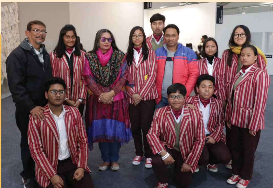
WITH MS. SHABANA AZMI AT THE ART FAIR

Our students had a chance to meet eminent literary and theatre personalities including Mr. Javed Akhtar and Ms. Shabana Azmi.