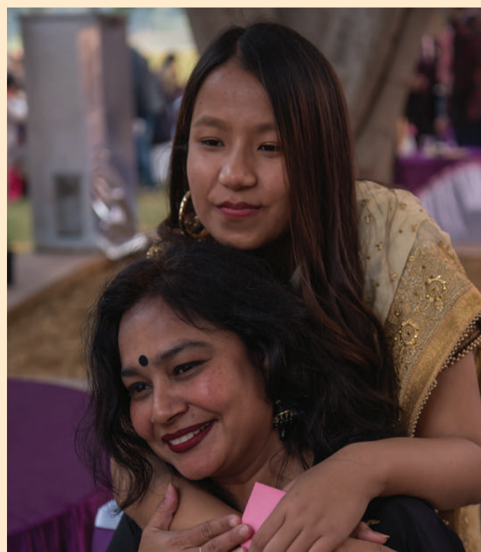
LIFE LONG BONDS...

In the end, the Chief Guest expressed her overwhelming appreciation for the entire show – the way the students of outgoing class conducted themselves and the XI-graders seeing them off – being so sublime and dignified. She further expressed her awe for the way TSS cares and brings up their children.