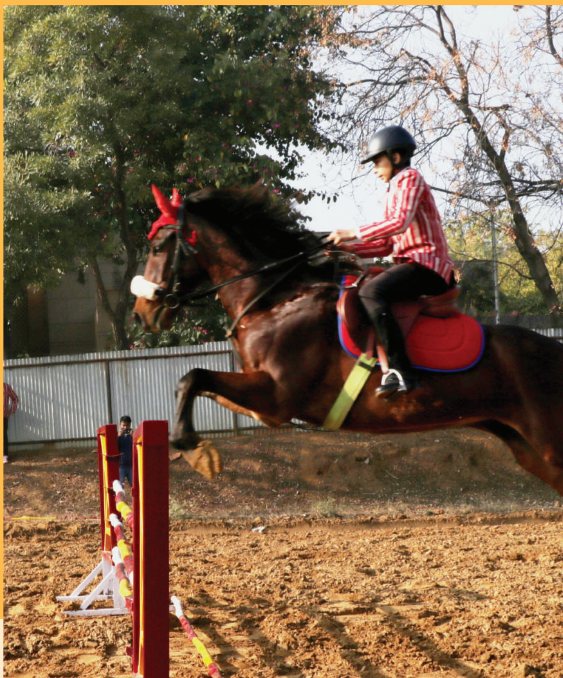
IF YOU HAVE GAINED THE TRUST OF A HORSE, YOU GAINED A FRIEND FOR LIFE