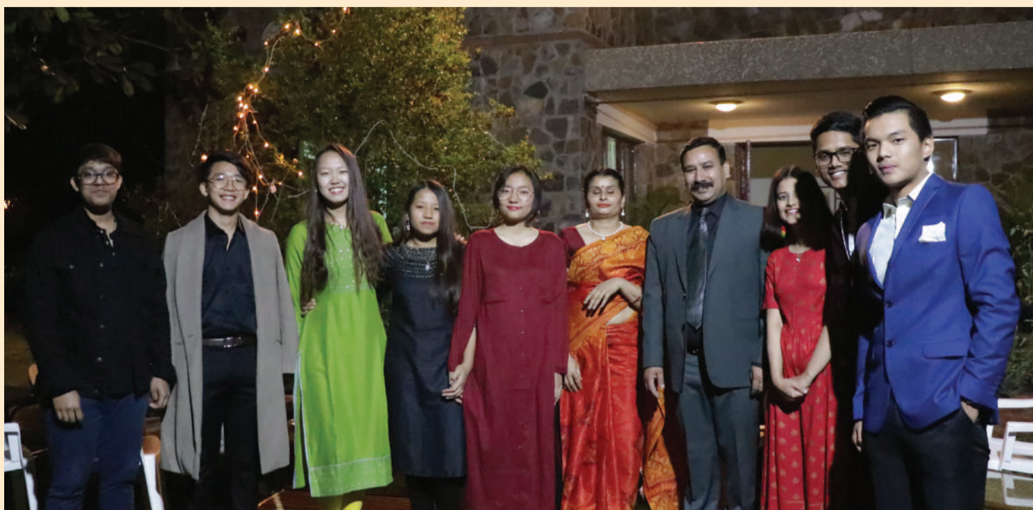
AT THE LAWNS OF PRINCIPAL'S RESIDENCE