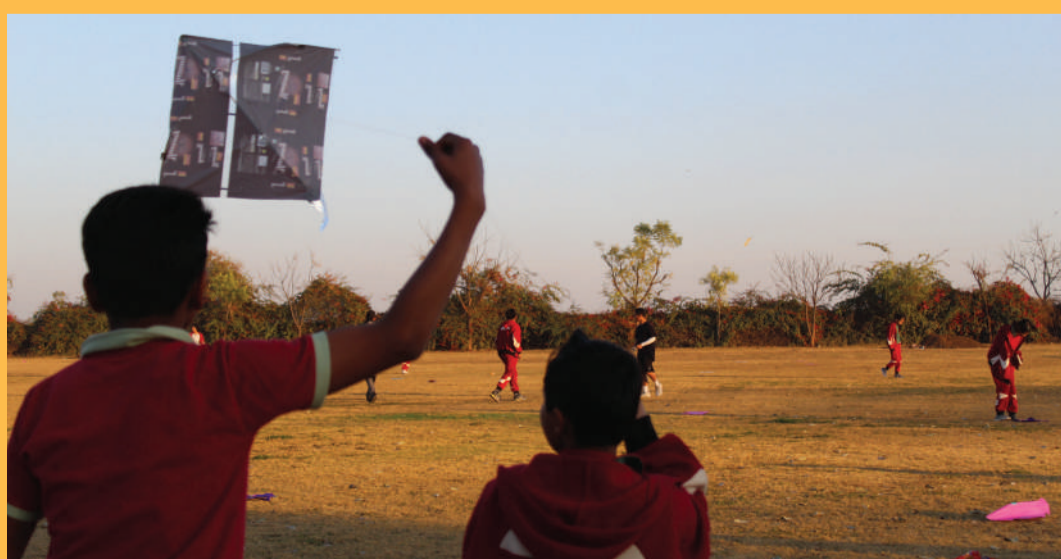
TRYING TO SOAR IT HIGH