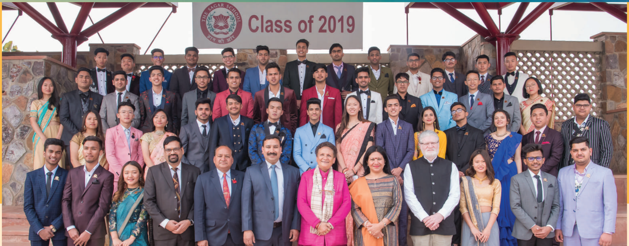
FARE THE WELL - CLASS OF 2019

RANKED No. 1 CO-ED BOARDING SCHOOL IN RAJASTHAN BY EDUCATION WORLD AND AMONGST BEST BOARDING CO-ED SCHOOLS IN THE COUNTRY