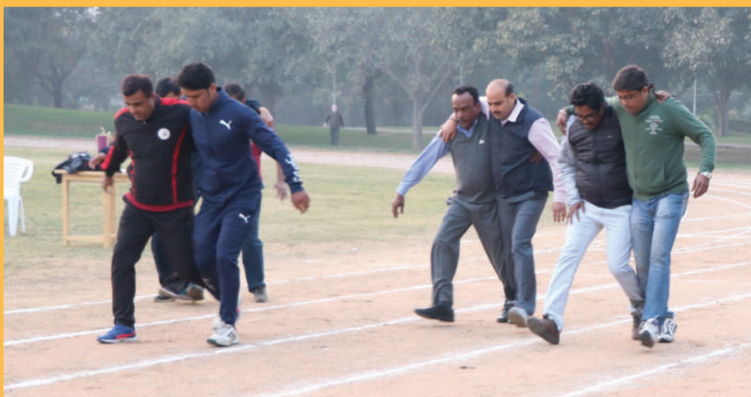
SPIRITED OUTING – TEACHERS IN THREE LEGGED RACE...