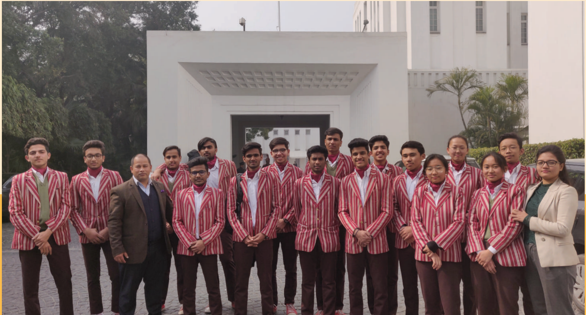
IN FRONT OF IMPERIAL HOTEL, DELHI – ONE GLOBE FORUM VENUE

One Globe Forum is an annual thought leadership forum, which focuses on exploring the intersection of technology, education, science, innovation, entrepreneurship, urbanisation, smart cities, skills development, security, health and regional collaboration, and their role in enabling economic growth to build a 21 st -century knowledge economy.