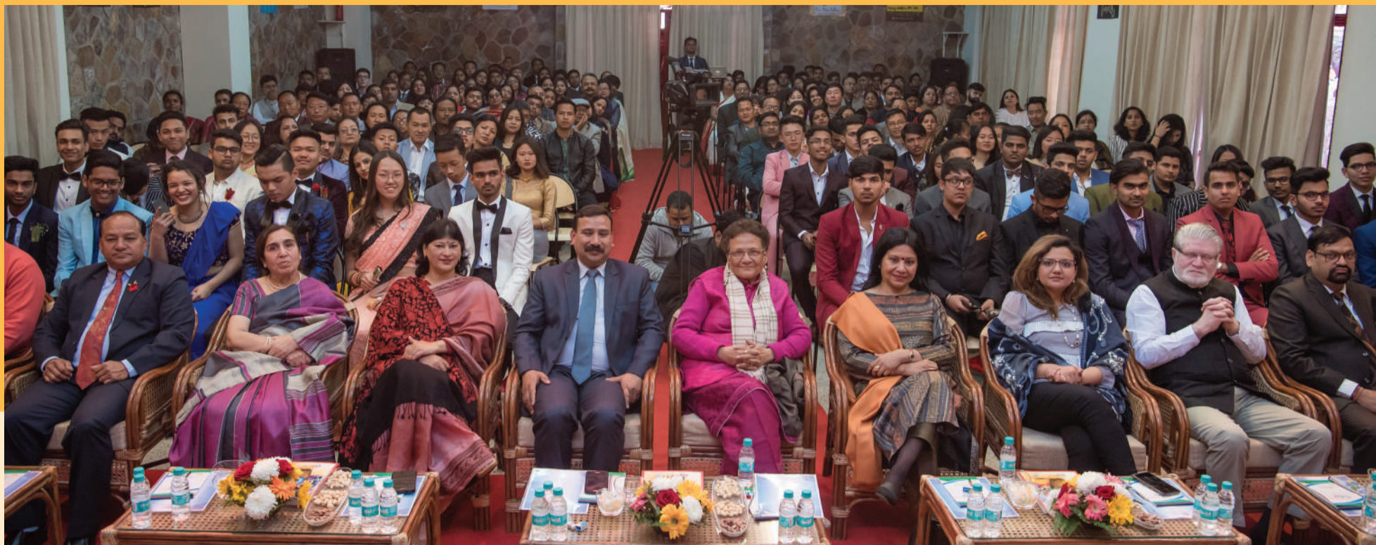
THE CHIEF GUEST AT THE FAREWELL FUNCTION

“The future belongs to those who believe in the beauty of their dreams.” – Eleanor Roosevelt