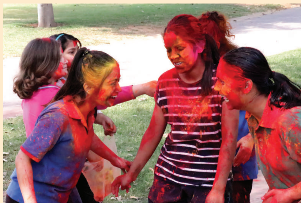
BURA NA MANO HOLI HAI...