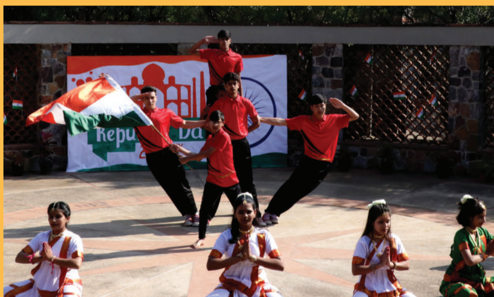
MAA TUJHE SALAAM!