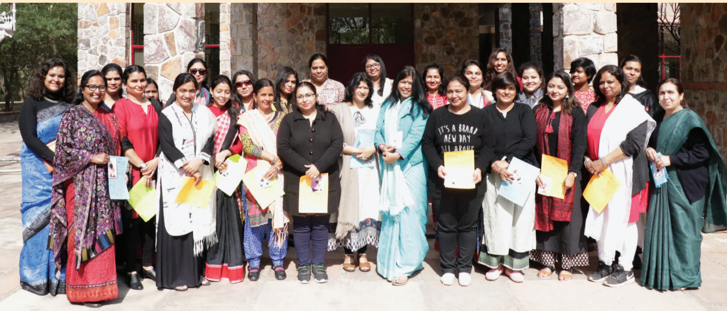
SAGARIAN LADIES ON WOMEN'S DAY...

“Empower woman, empower the human community”