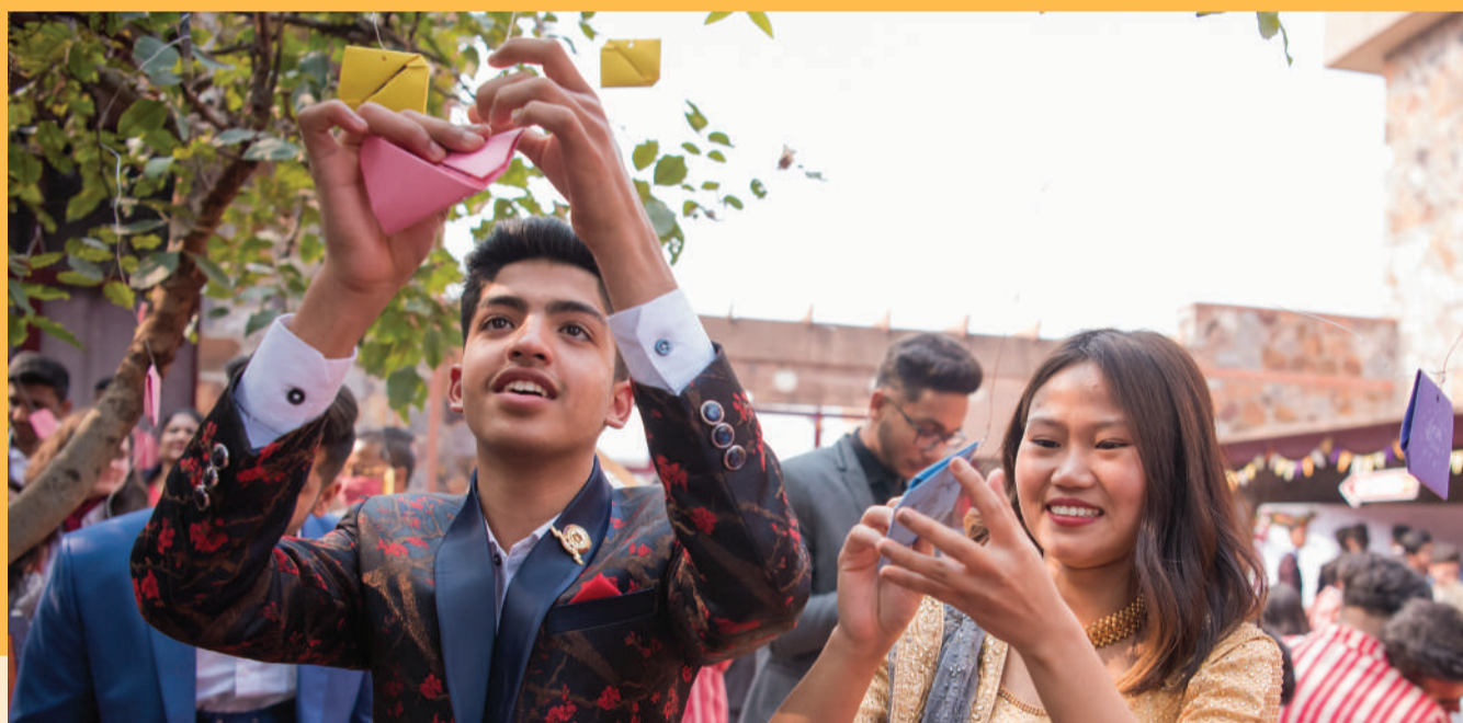
TIME FOR A SELFIE