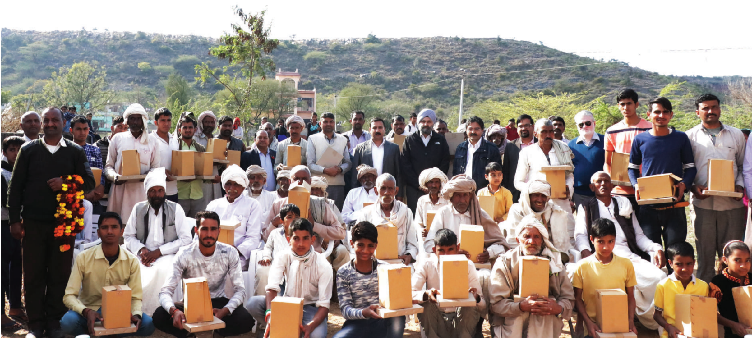
VILLAGERS POSING WITH THEIR LAMPS...