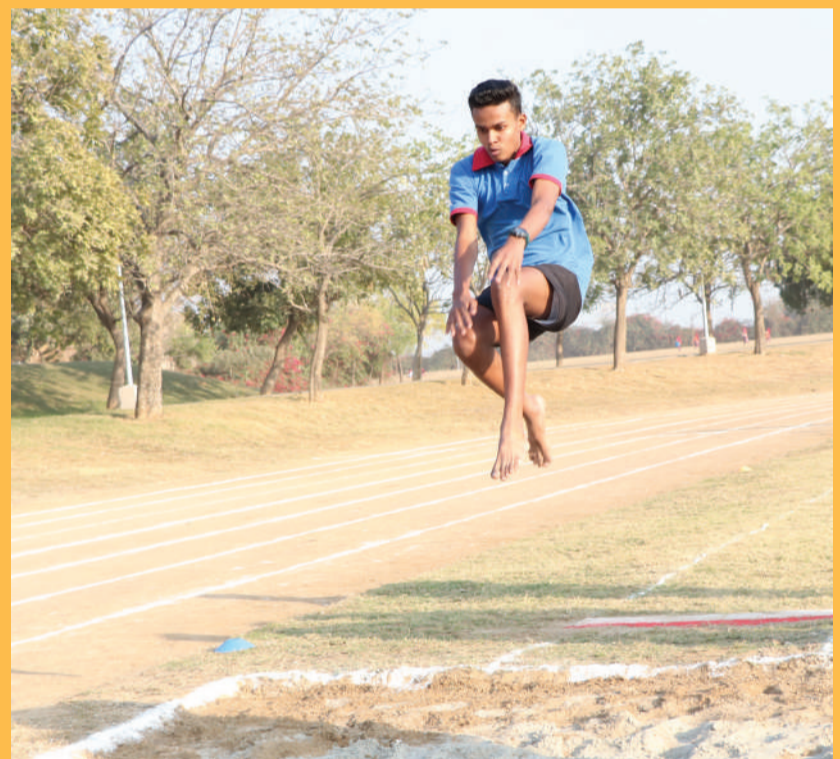
FABY THE FABULOUS...A BUDDING ATHLETE