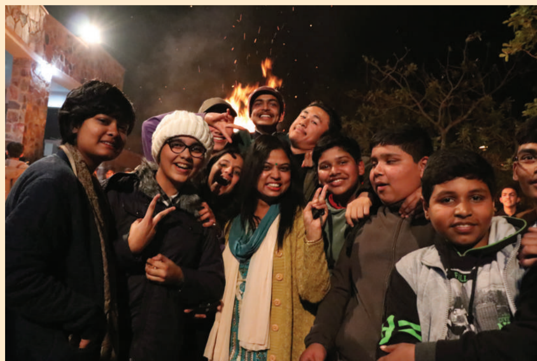
SUNDRI MUNDRI HOYE!!

Spreading smiles and joy with the bonfire, folk music, rewari and peanuts, Lohri was celebrated in the peak of winter cold. The whole school joined in the togetherness and festivity filling all their hearts with warmth and hope. The next day, marking the occasion of Makar Sankranti, the students as well as their teachers indulged in the exciting kite flying show. The soaring kites dotting high up in the sky was a picture-perfect sight!