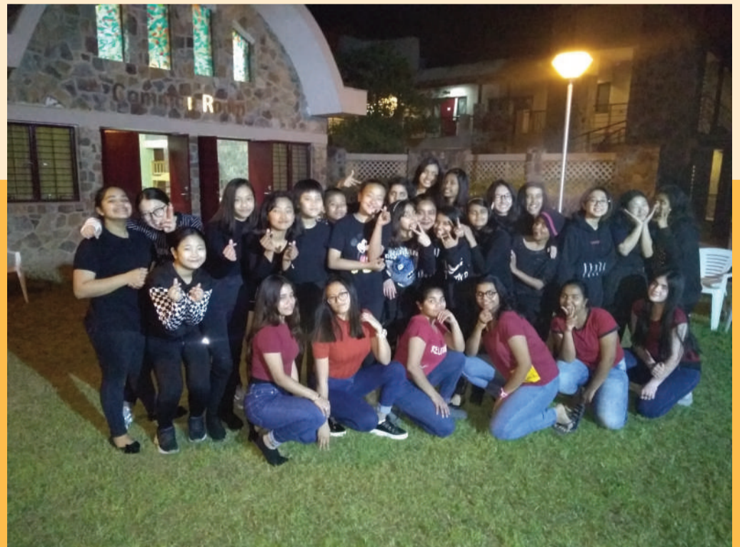
JUNIOR GIRLS POSING FOR A CLICK...