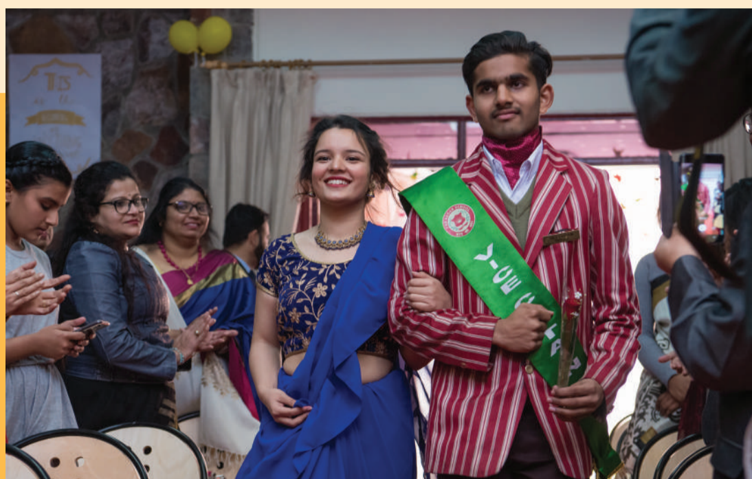
HEAD BOY AND HEAD GIRL BEING ESCORTED