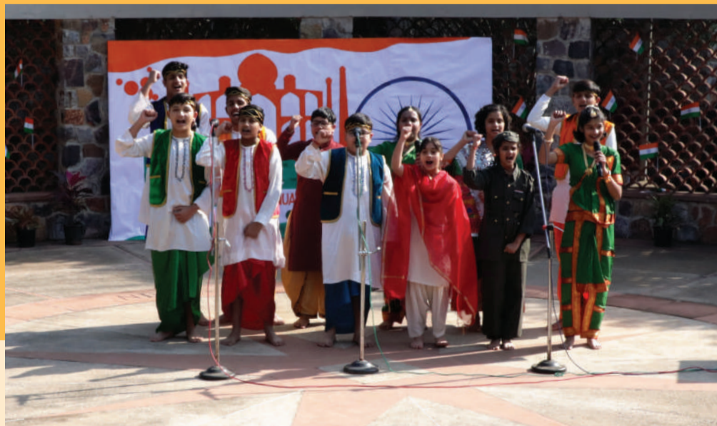
PATRIOTIC FERVOUR – A SONG PERFORMANCE