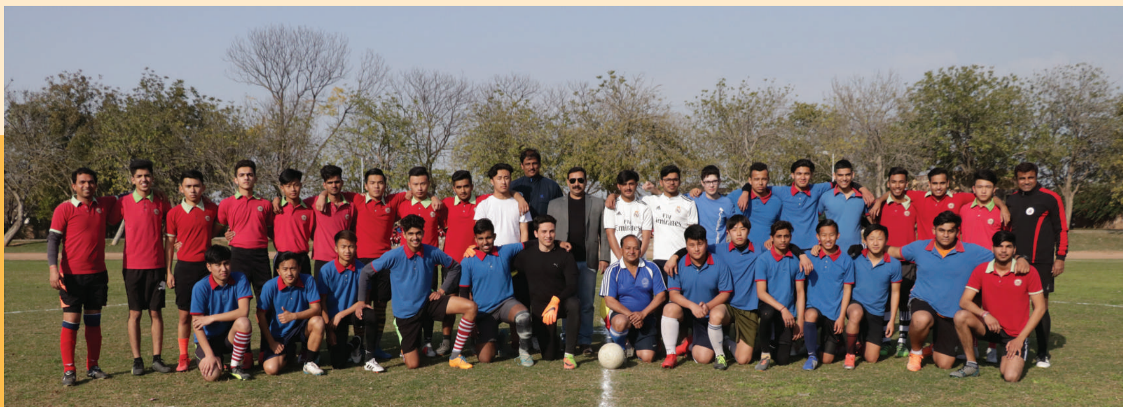
THE FAREWELL FOOTBALL MATCH...A MEMORABLE FAREWELL