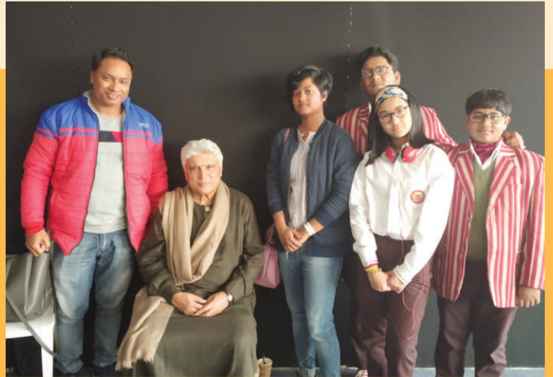
WITH MR. JAVED AKHTAR AT THE ART FAIR...