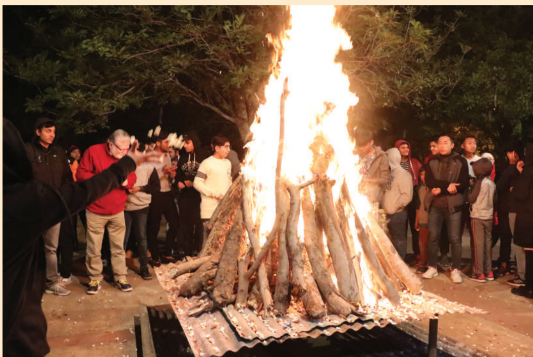
NOTHING LIKE A BONFIRE IN WINTER