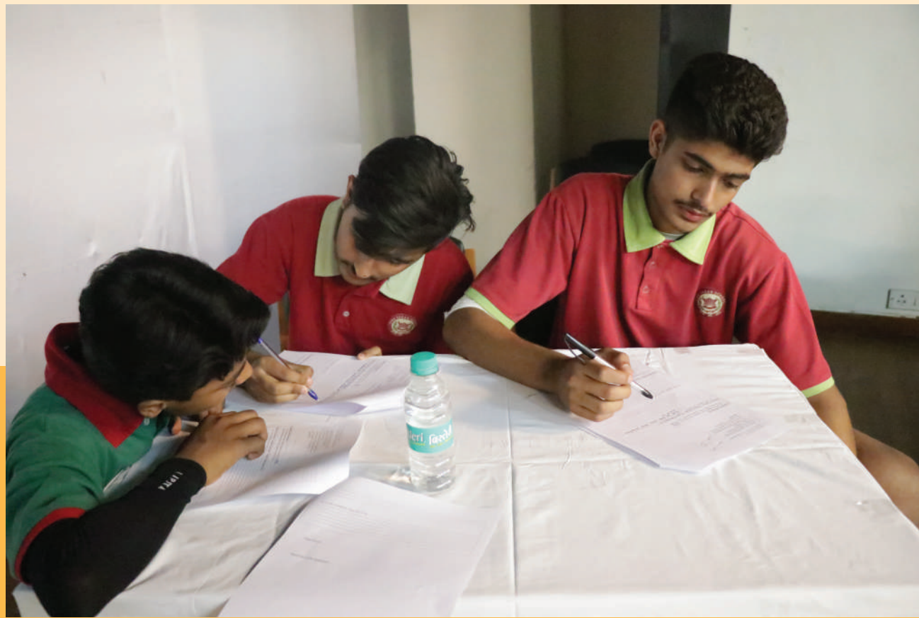
FILLING THE QUESTIONNAIRE