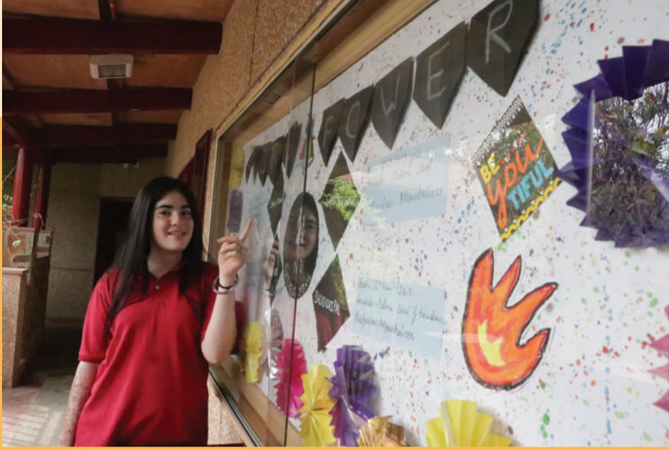
I JUST LOVED DOING THIS BOARD!