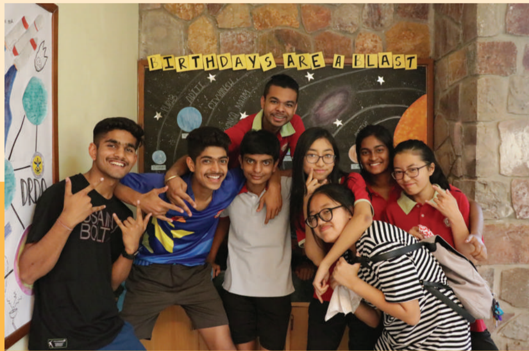
BIRTHDAYS ARE A BLAST - WHAT A THEME!