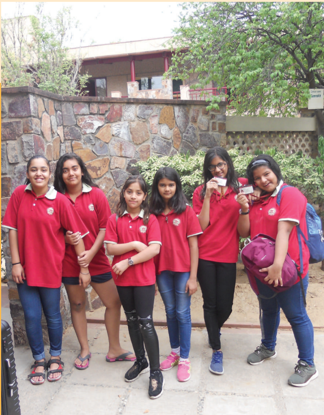
DEPARTING FOR THE SUMMER VACATION