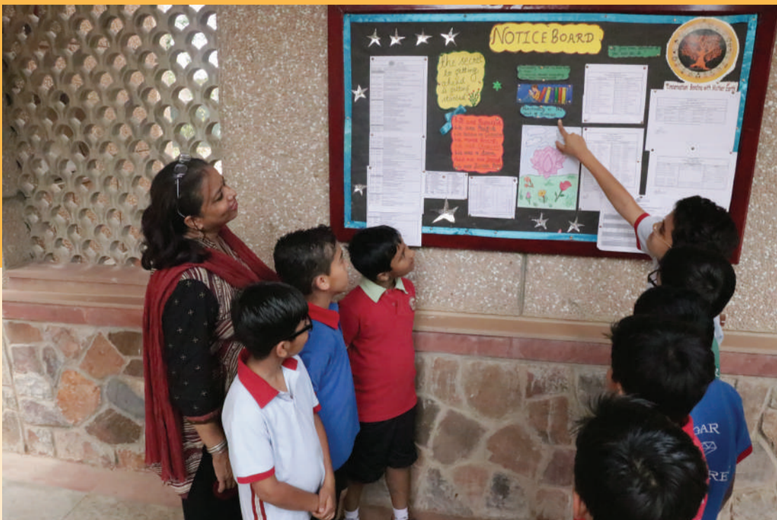
LEST THE JUDGES FORGET TO NOTICE... FUN...