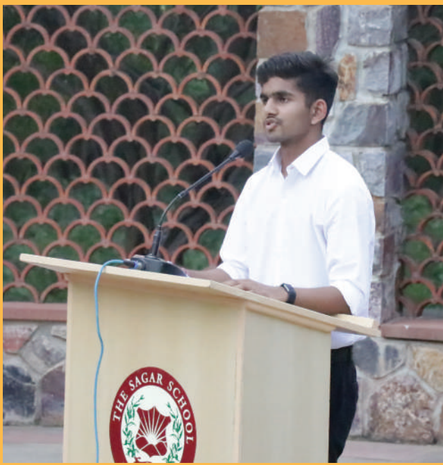
YOU CAN TRUST ME TO SHOULDER THE RESPONSIBILITY