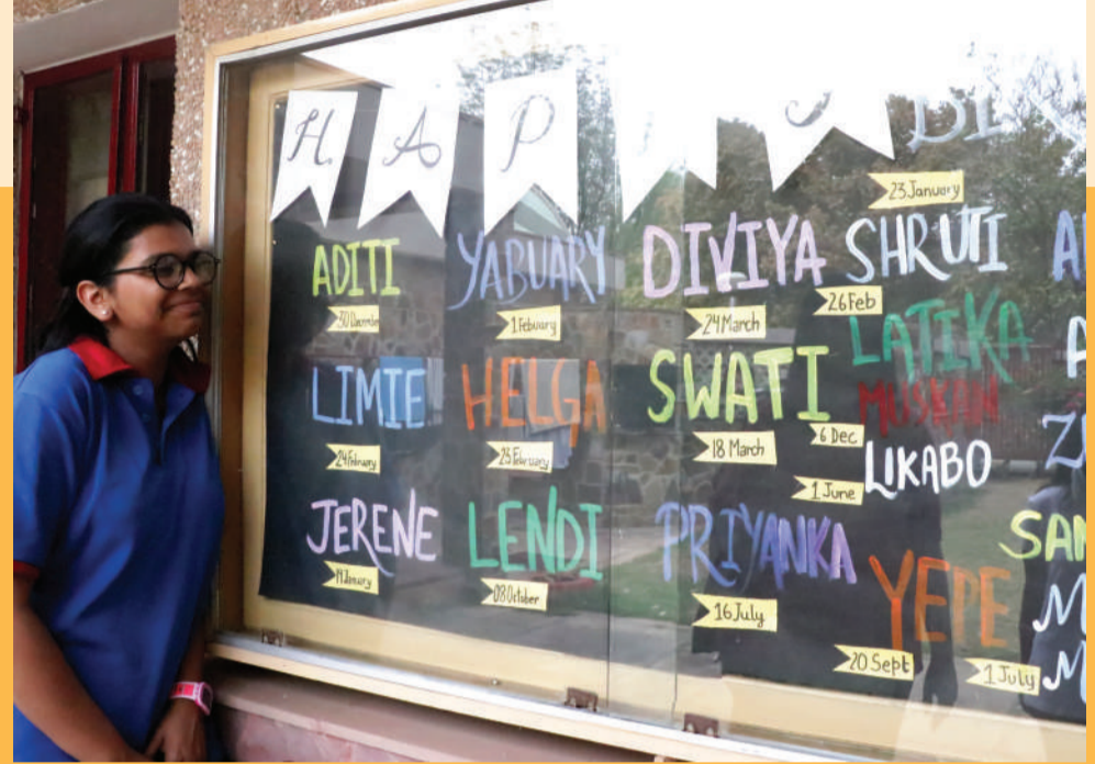
AND SO DID I...