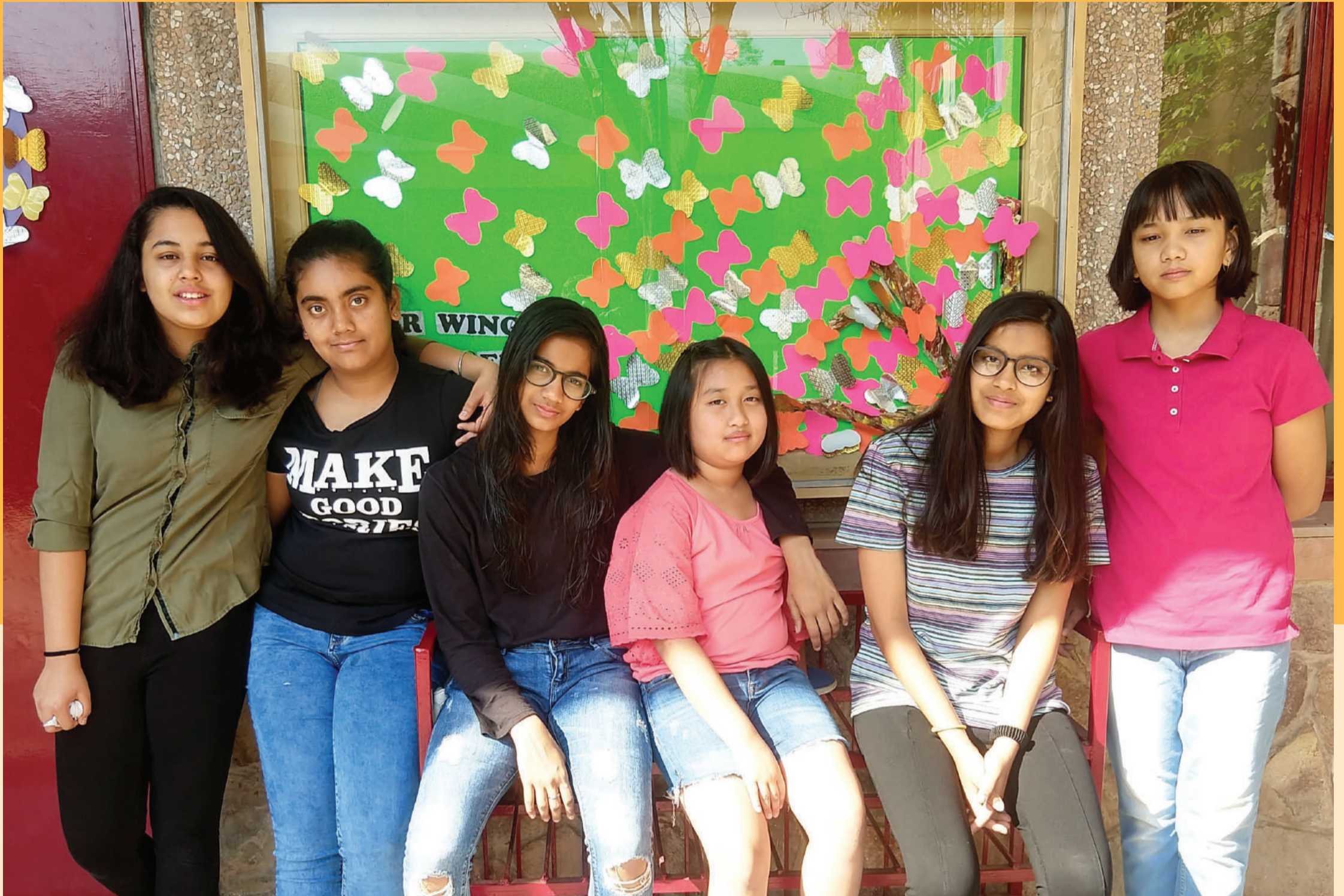
GIRLS POSING IN FRONT OF THEIR BOARD