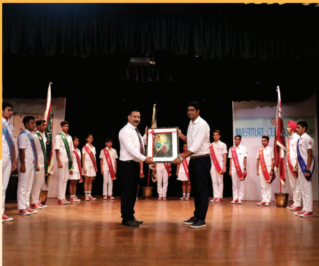
MOMENT OF PRIDE