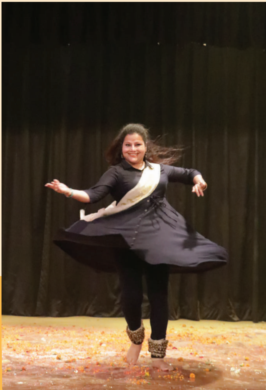
A GLORIOUS PERFORMANCE