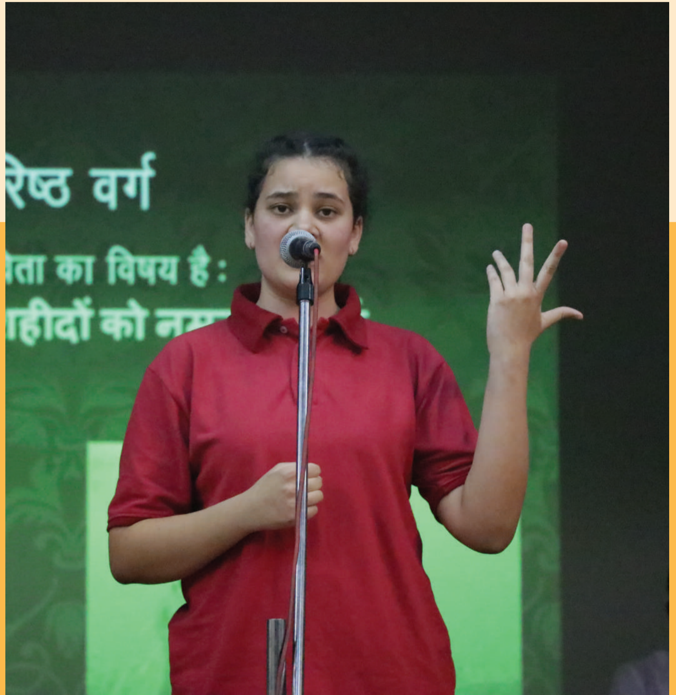
THE HEAD GIRL RECITING HINDI POEM...