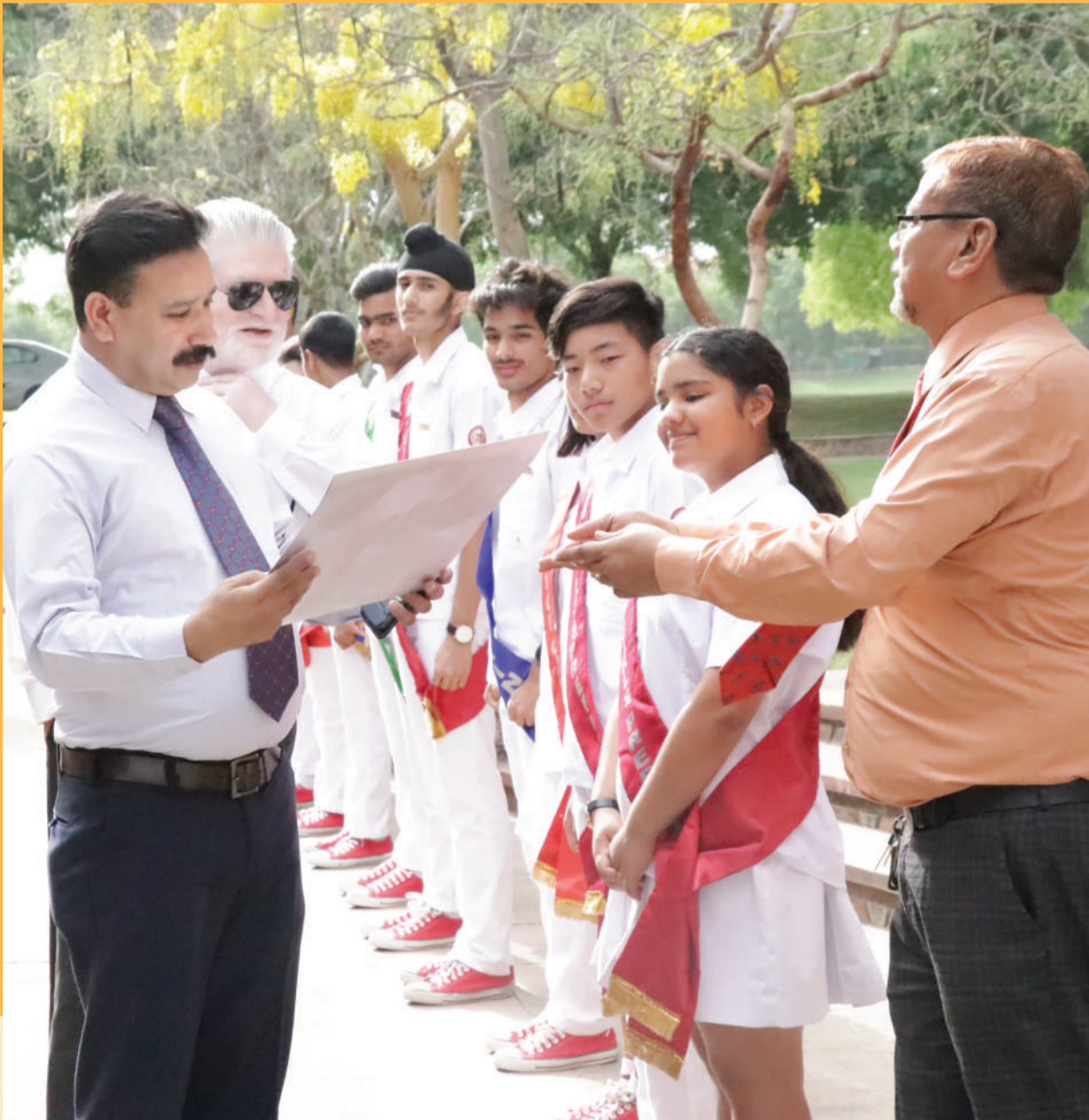
A SPECIAL CARD FROM THE STAFF