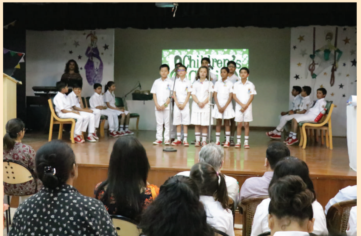
A DELIGHTFUL PERFORMANCE BY THE STUDENT CHOIR