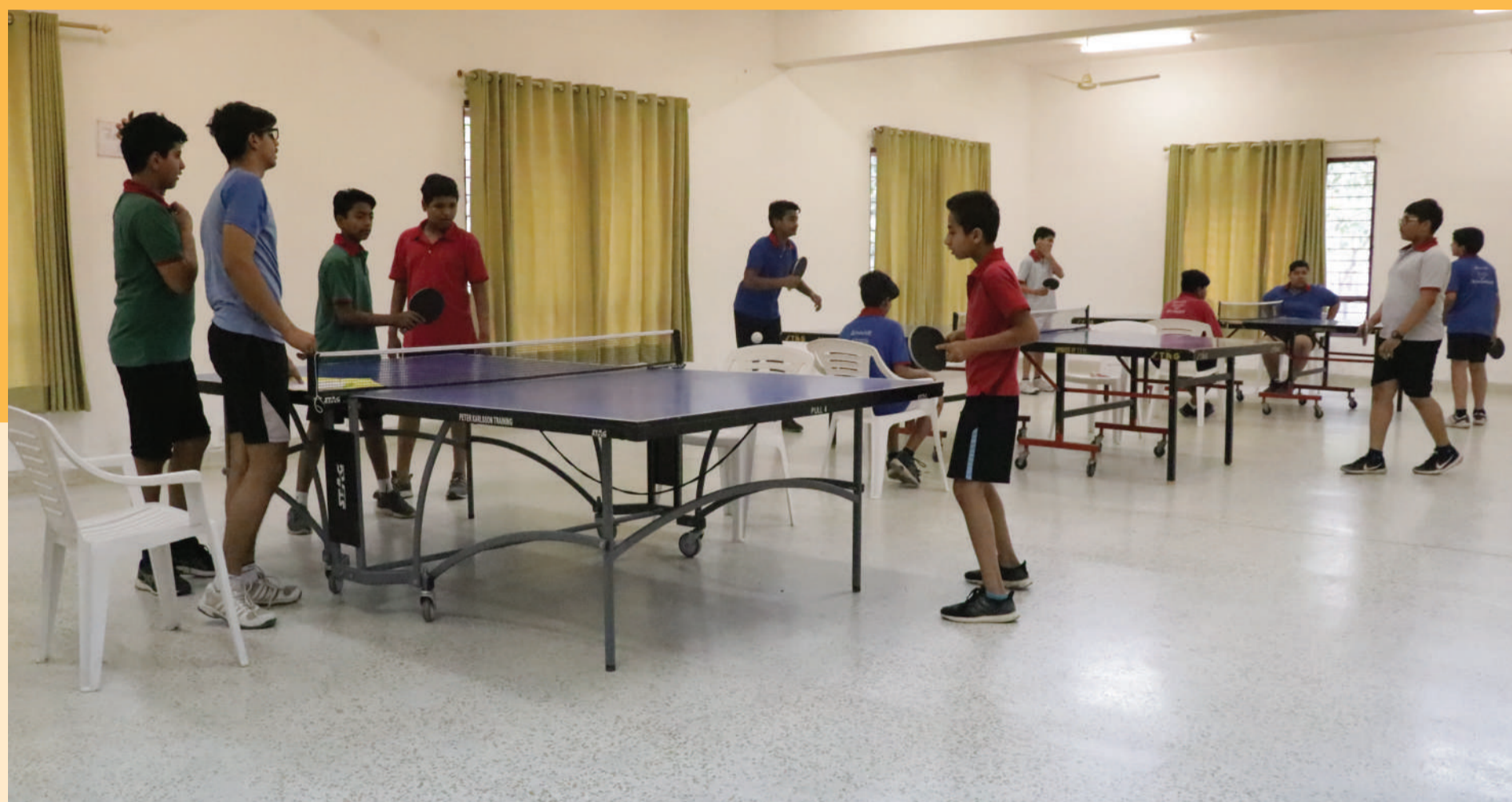
FIRST SERVE OF THE MATCH...

The Inter- House Table Tennis championship was also conducted on League Cum Knock Out basis, but in Five Groups. Group – A Under –19 Boys; Group – B Under – 17 Boys; Group – C Under –14 Boys; Group – D Under –19 Girls and Group – E Under –14 Girls. This championship was won by the Rubies followed by Sapphires, Diamonds and Emeralds.