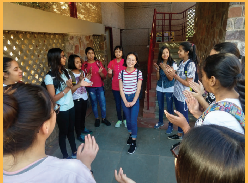
NEW STUDENTS ON THE FIRST WORKING DAY