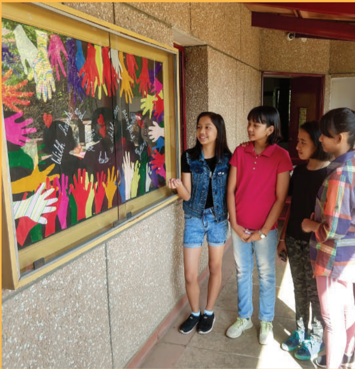
ADMIRING THE BOARD!