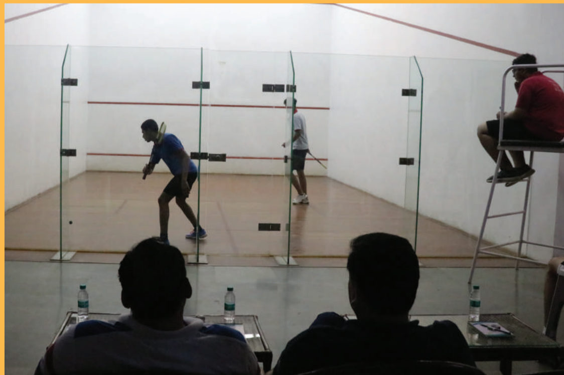
INTER-HOUSE SQUASH... LET THE MATCH BEGIN!