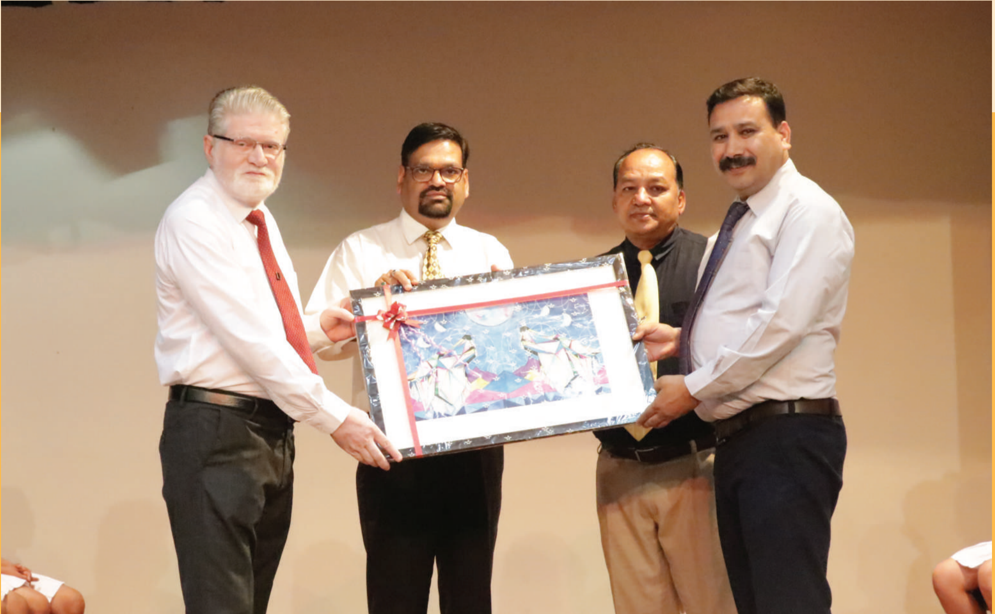
TO REMIND YOU OF US – A PAINTING BY A STUDENT