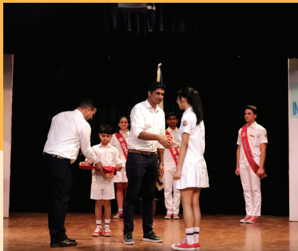
THE CHIEF GUEST BEING HONOURED WITH A MEMENTO