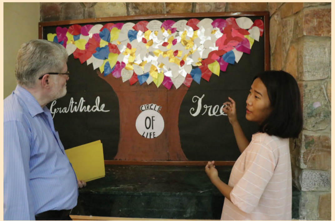
THE CIRCLE OF LIFE!