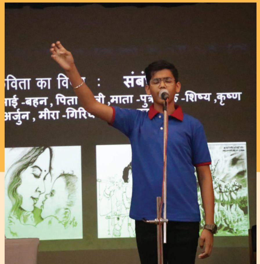
SOULFUL RENDITION .....