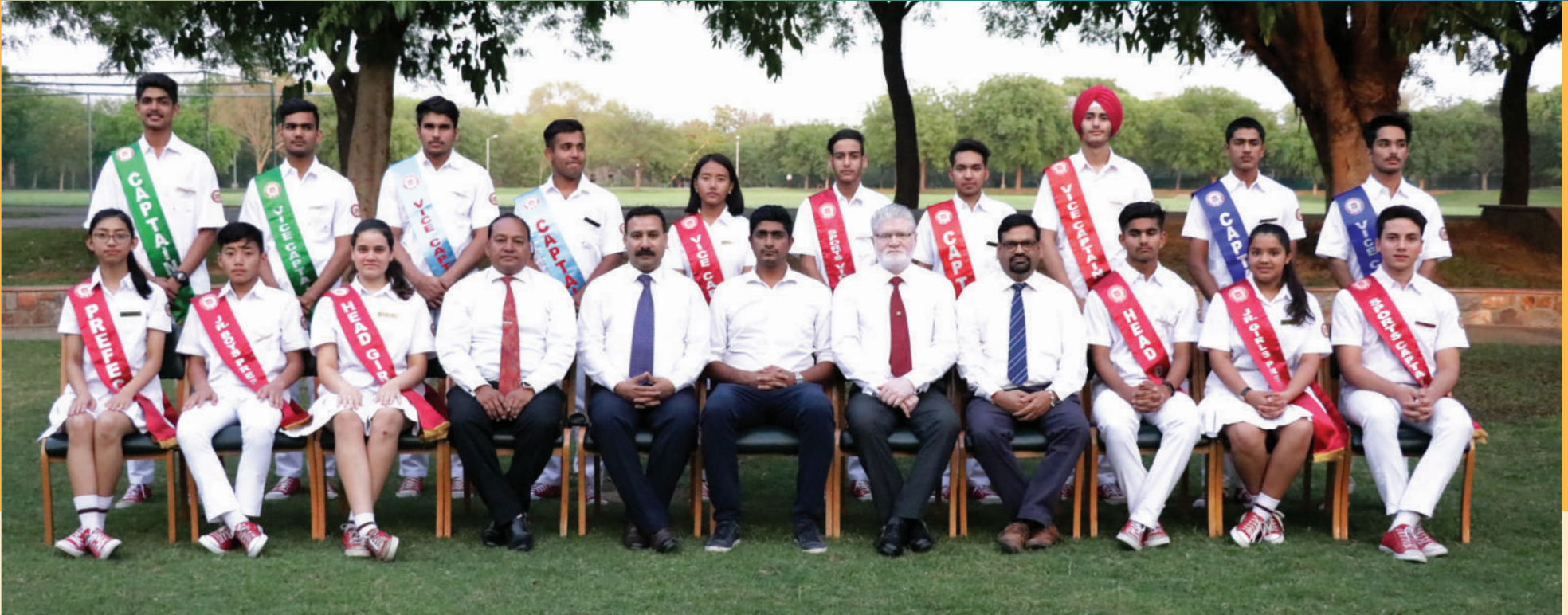
THE STUDENTS' COUNCIL AFTER SWEARING IN

RANKED AMONGST THE TOP CO-EDUCATIONAL BOARDING SCHOOLS IN THE COUNTRY & No. 1 CO-ED BOARDING SCHOOL IN RAJASTHAN FOR 6 CONSECUTIVE YEARS