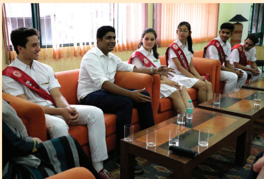
AND INFORMAL CHAT...