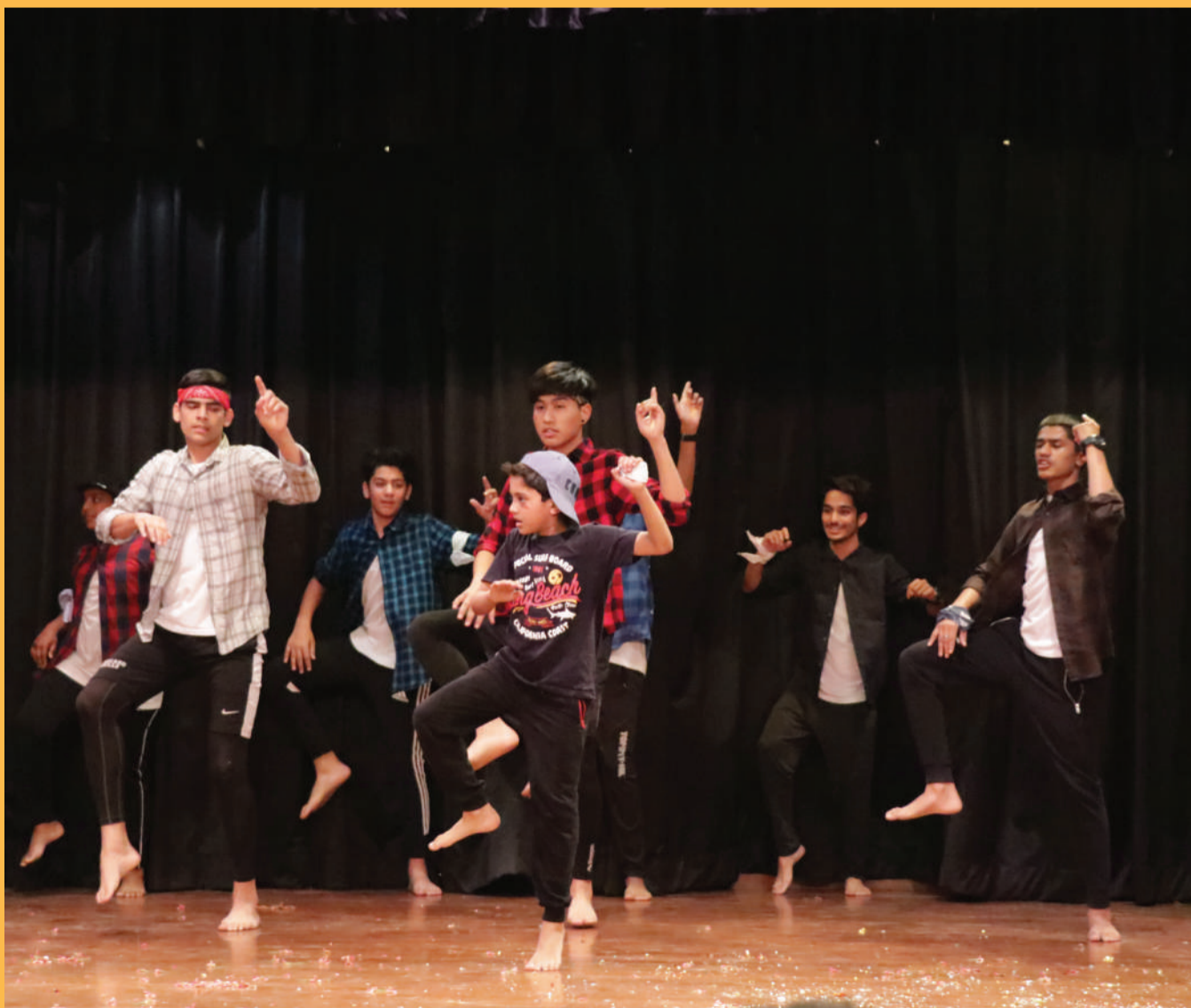
STUDENTS PUTTING THE STAGE ON FIRE!