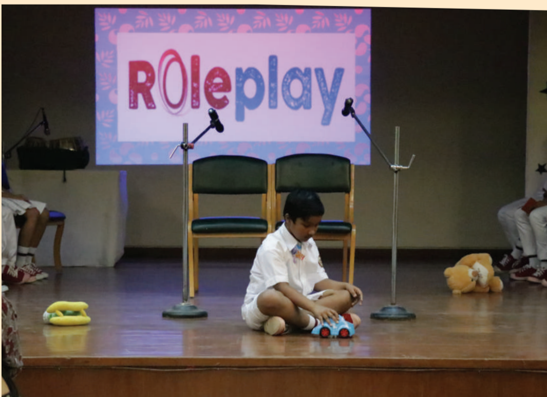
AUTISM IS NOT A DISABILITY...