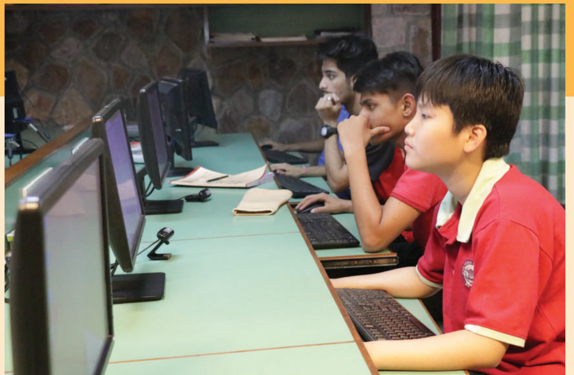
VOTING IS MY RIGHT – I KNOW MY RESPONSIBILITIES TOO!