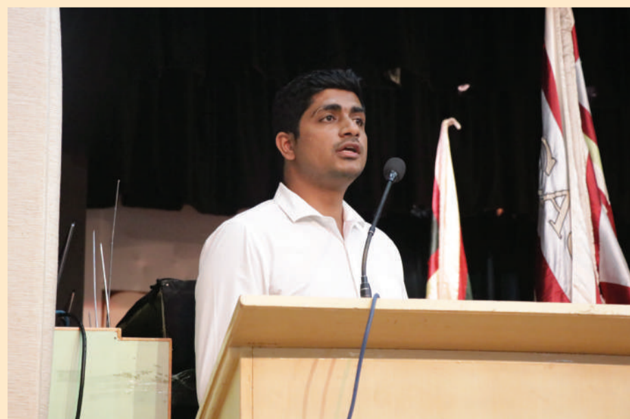
THE YOUTHFUL CONNECT – FORMAL SPEECH...