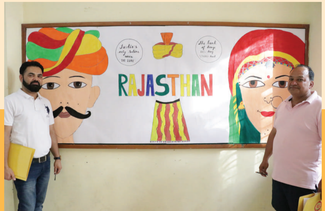
IMAGINATIVE AND ARTISTIC