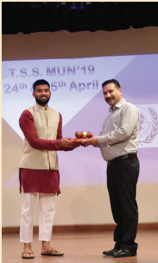
RECEIVING THE AWARD