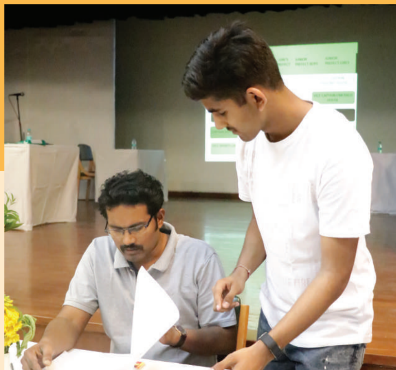
ELECTION COMMISSION AT WORK