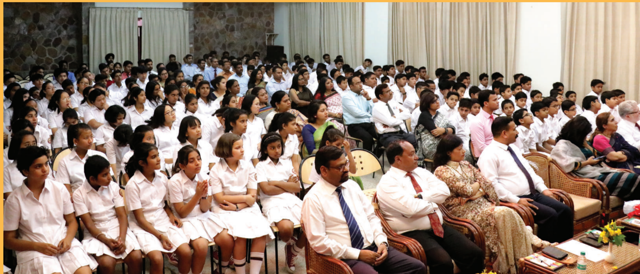
WITNESSING THE OATH TAKING

“Our best wishes to our Students’ Council!”