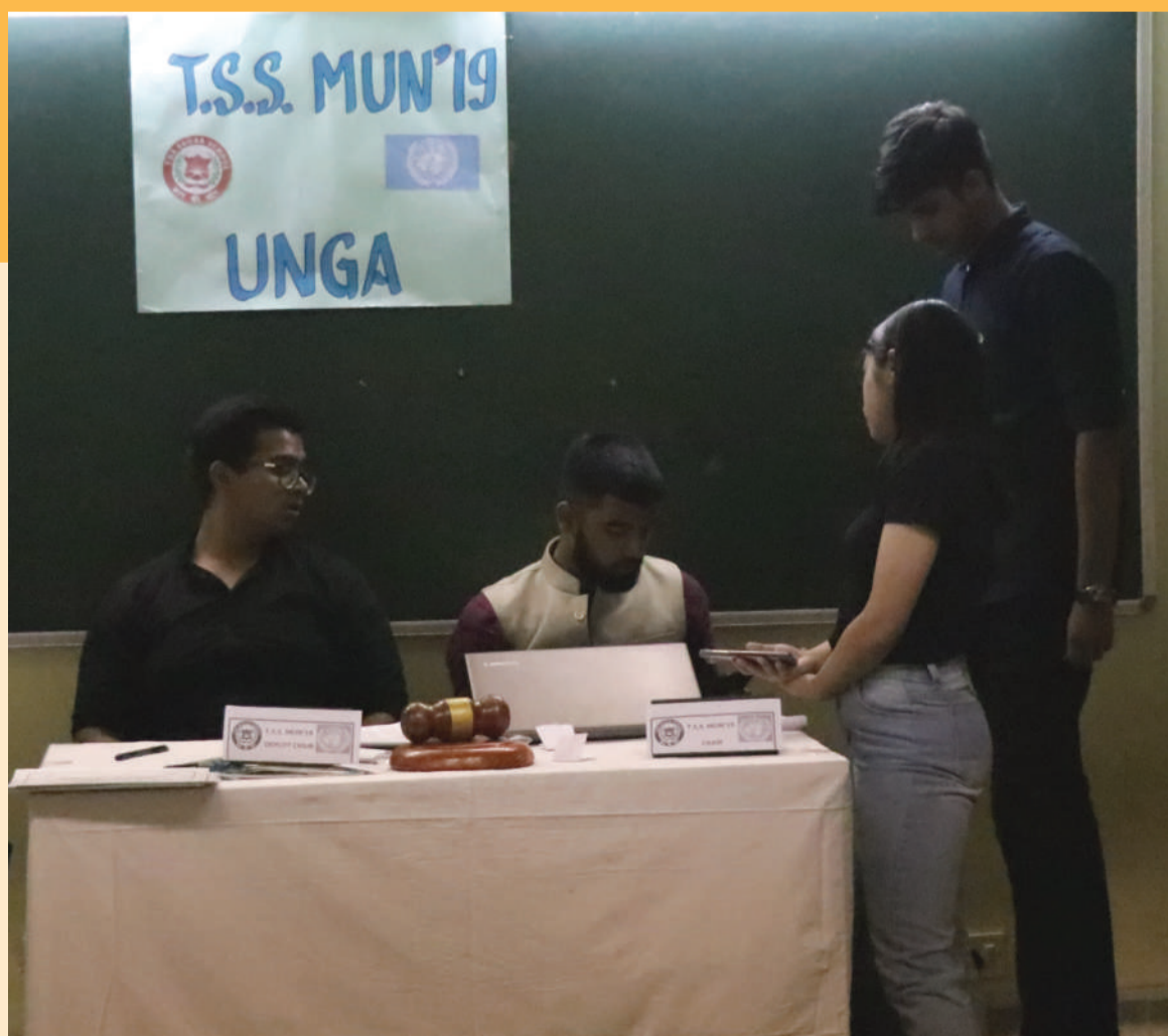
THE MUN HEADQUARTERS