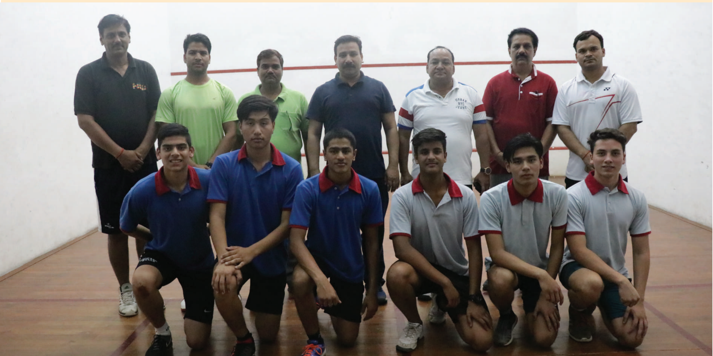
FINALISTS POSING BEFORE THE MATCH

In April, we had two Inter-House fixtures, both in racquet sports.