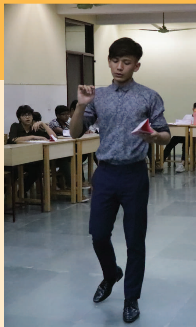
PREPARING FOR A PRESENTATION...