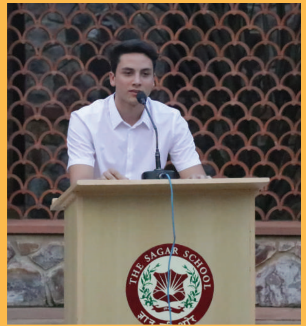
VOTE FOR ME BECAUSE I AM THE BEST IN SPORTS