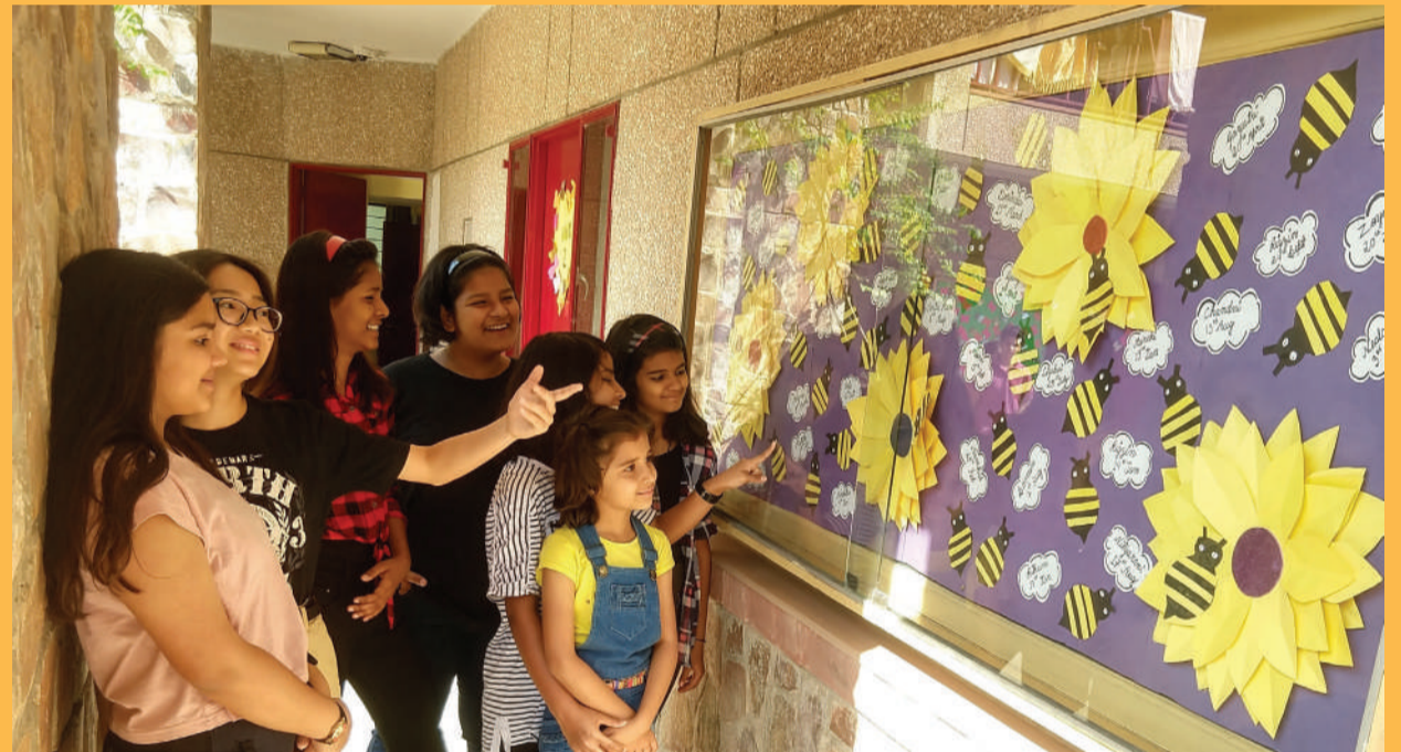
SHOWING OFF THEIR COLOURFUL ARTWORK...