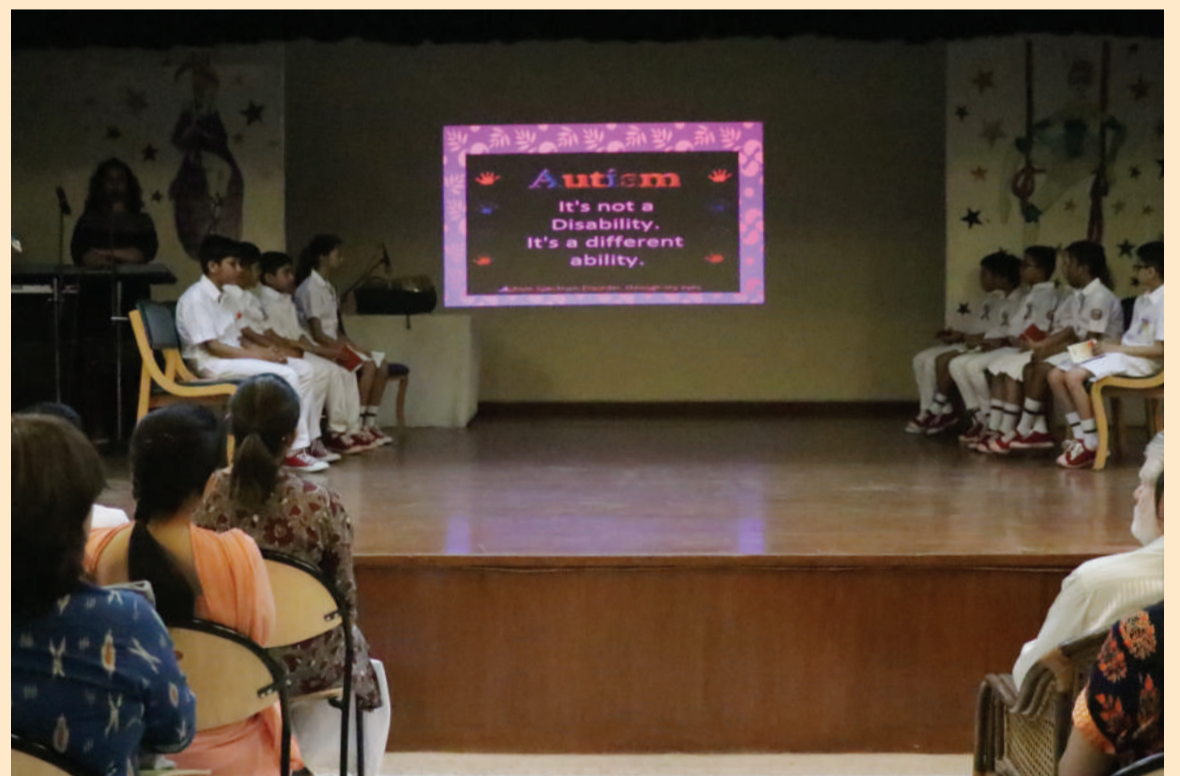
THOUGHT FOR THE DAY