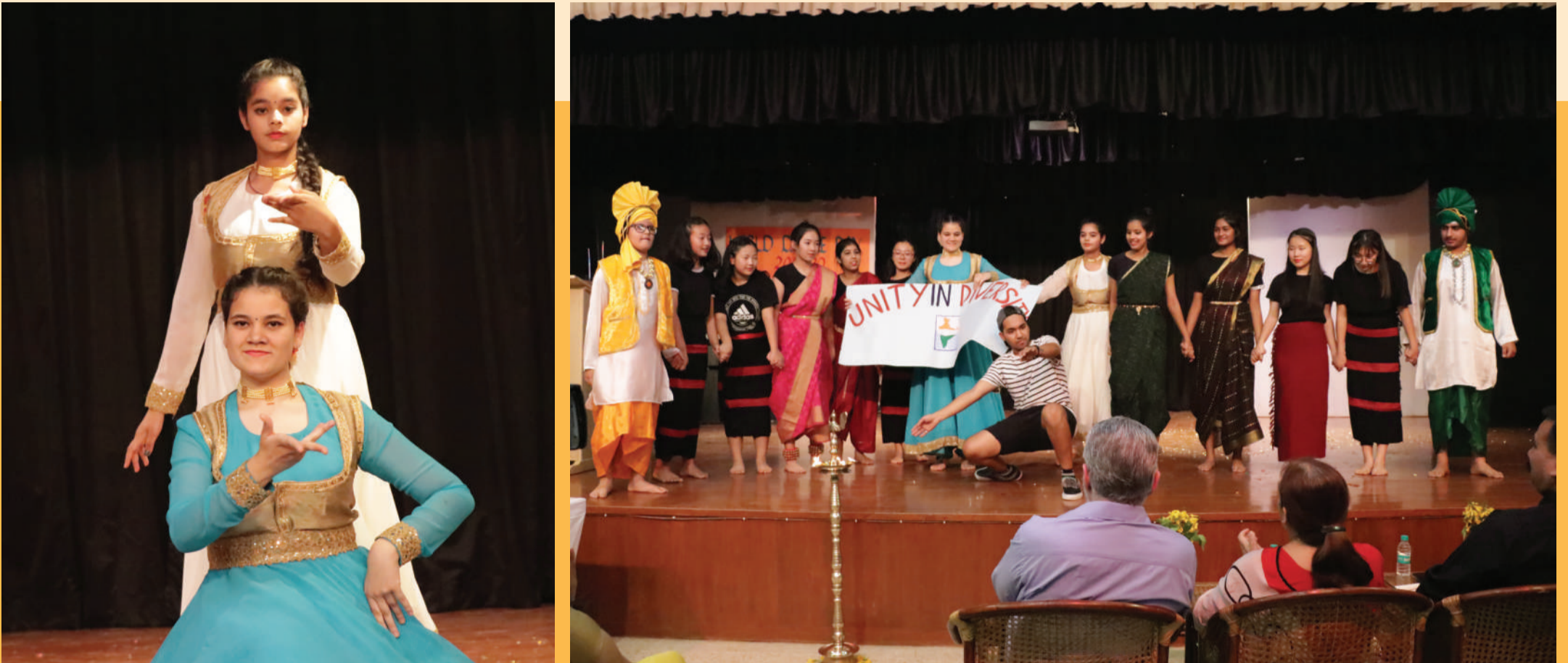
A SYMPHONY OF INDIAN DANCES BY THE RUBIES... FROM KATHAK TO BHANGRA AND BIHU

In 1982 the Dance Committee of International Theatre Institute founded International Dance Day to be celebrated every year on the 29th April, the birthday of Jean-Georges Noverre (1727-1810), creator of modern ballet.