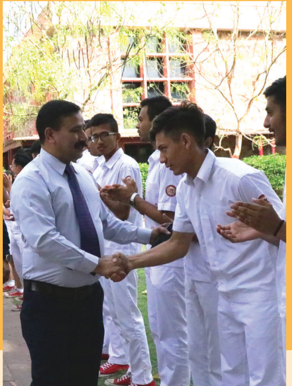
SINGING "HE IS A JOLLY GOOD FELLOW"