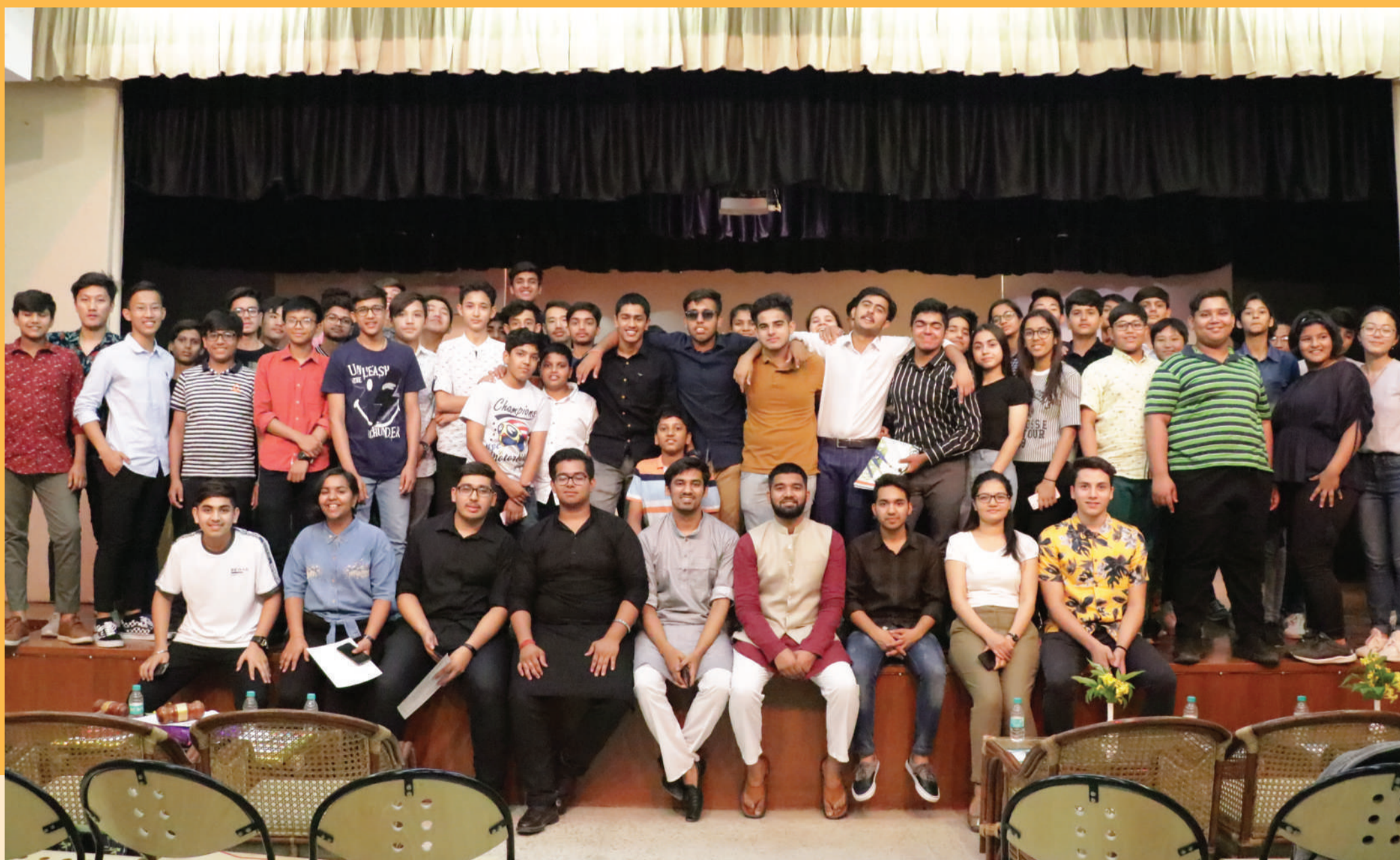
PARTICIPANTS AFTER THE EVENT...

“Can you imagine ninth and tenth graders discussing the Iran Nuclear Deal at the IAEA as delegates of Iran and P5 of the Security Council?”