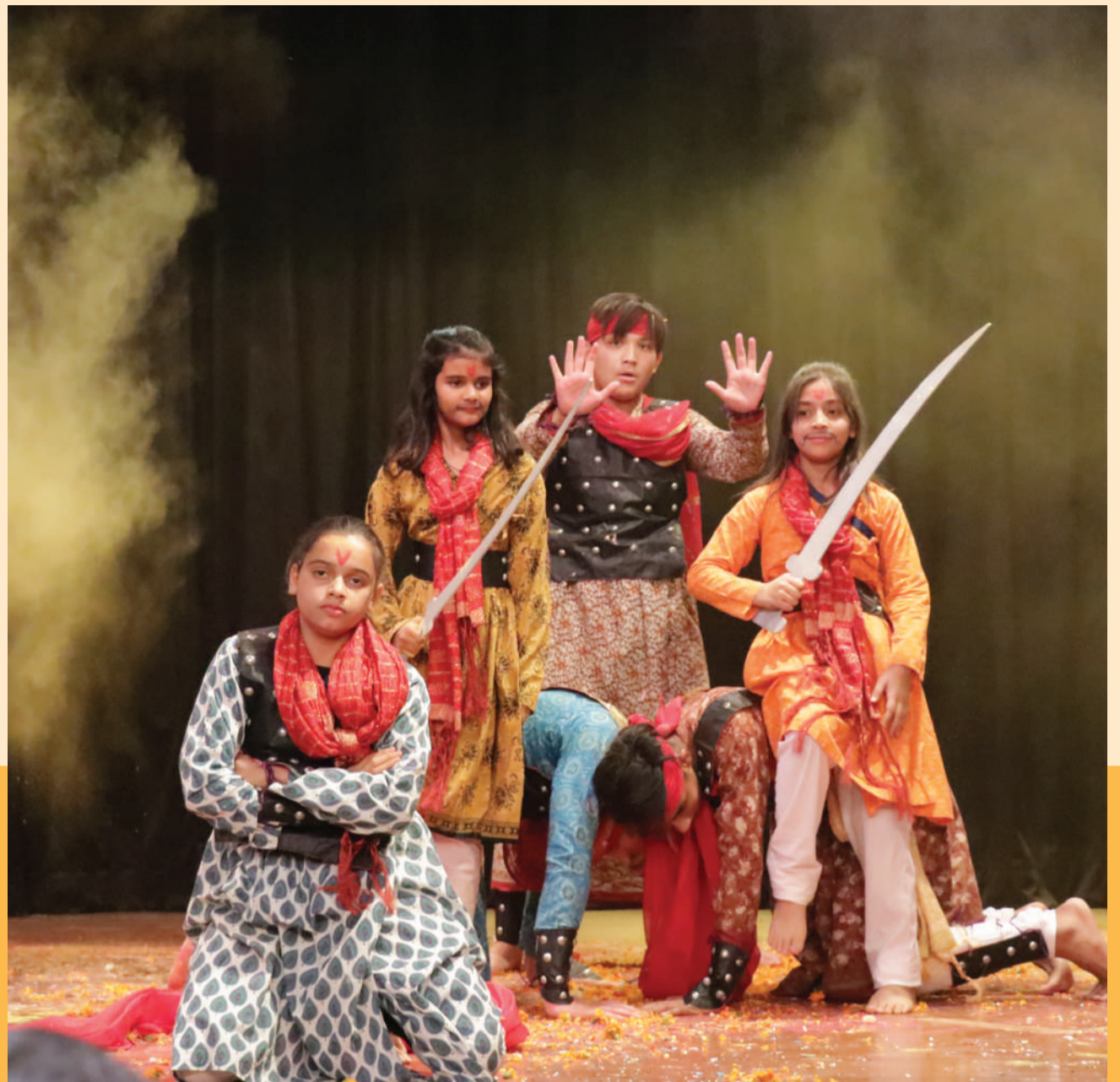
A GREAT COMBINATION OF ENERGY AND COLOUR...