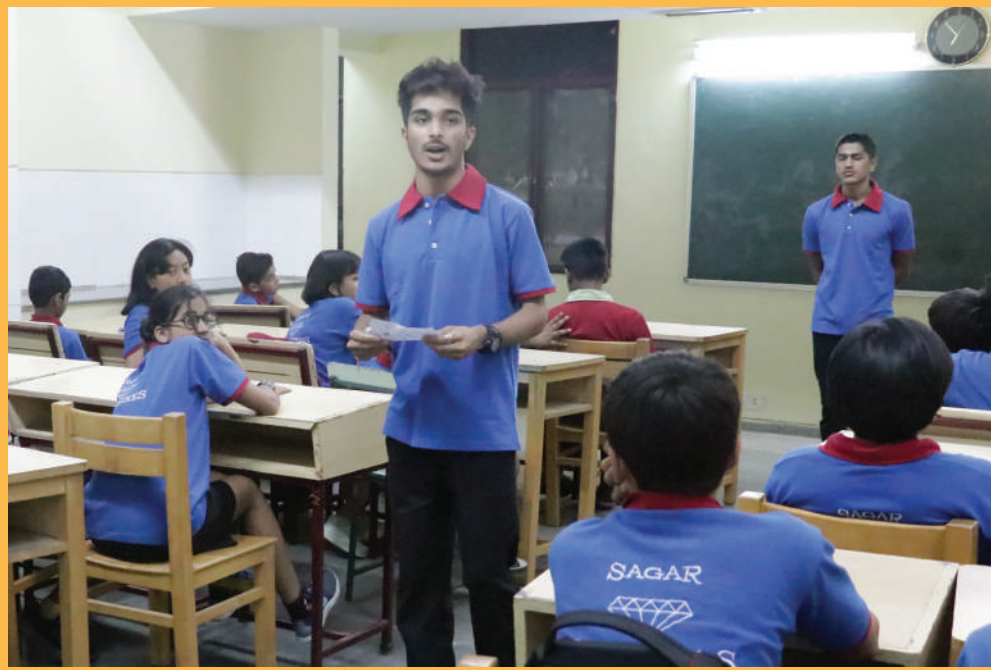
TOGETHER WE SHALL RECLAIM OUR TOP POSITION!