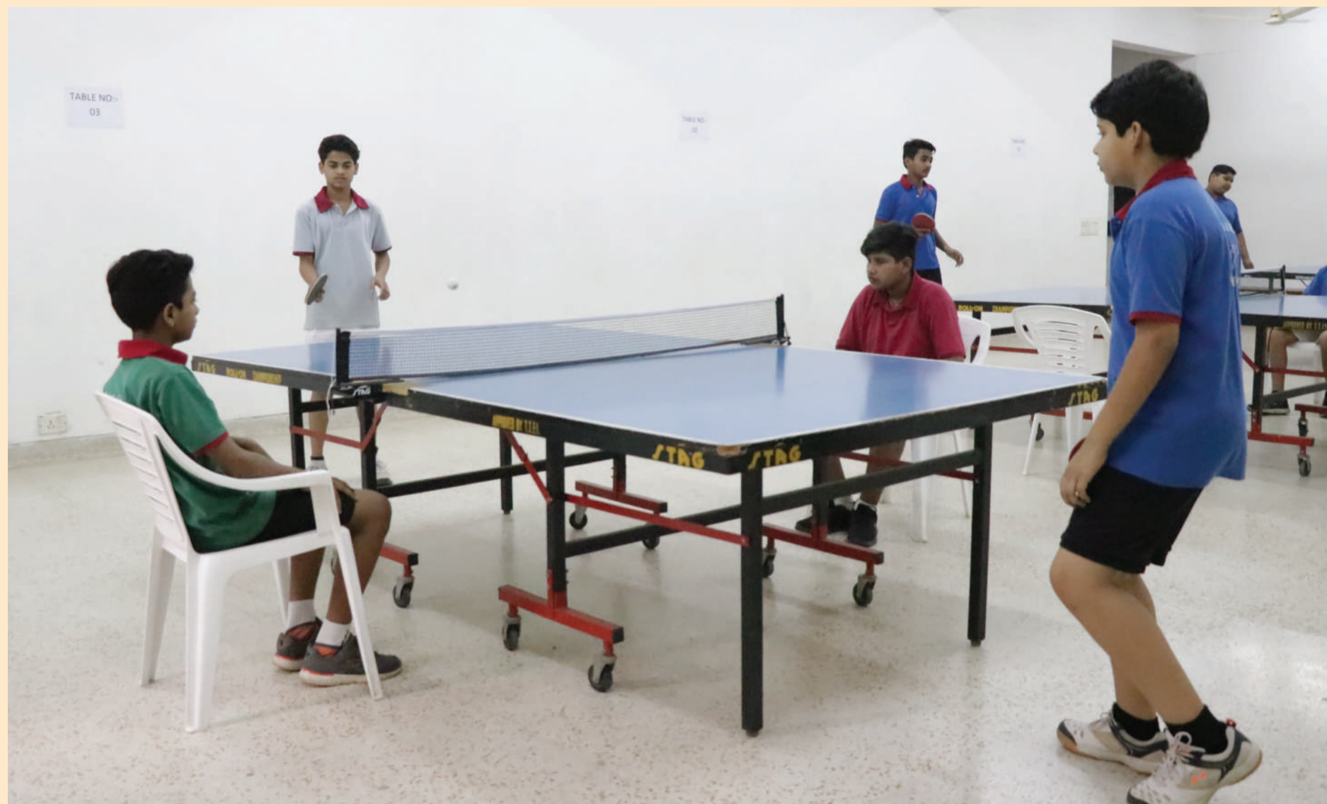
MATCH ON AN INTENSE SWING