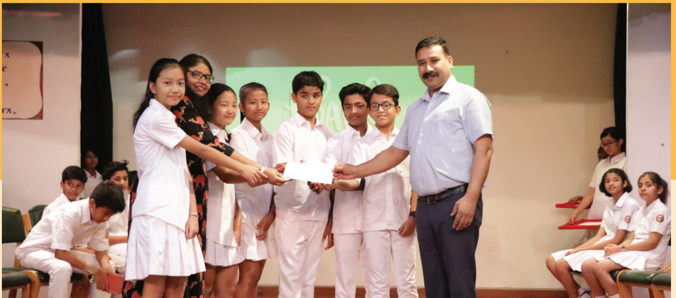
GETTING THE REWARD OF HARD WORK...