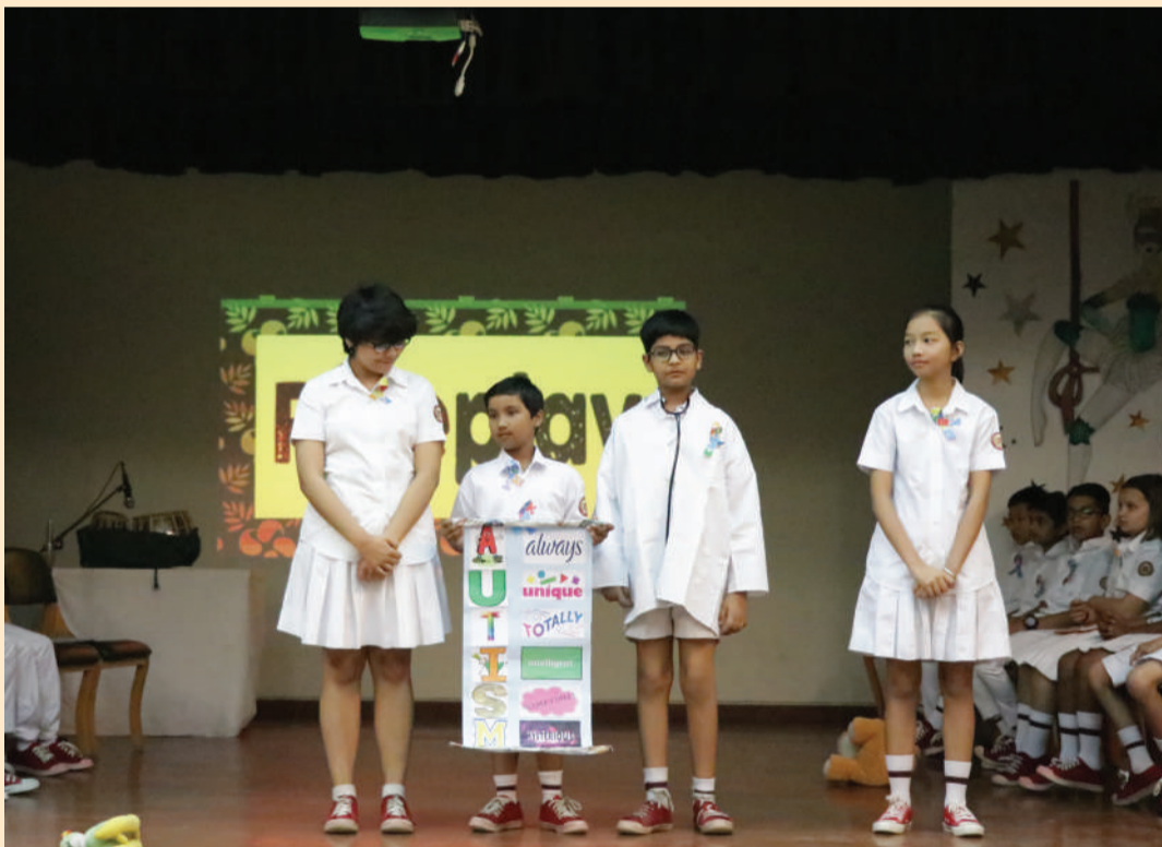
THE YOUNG ARTISTS AT THEIR THEATRIC BEST...