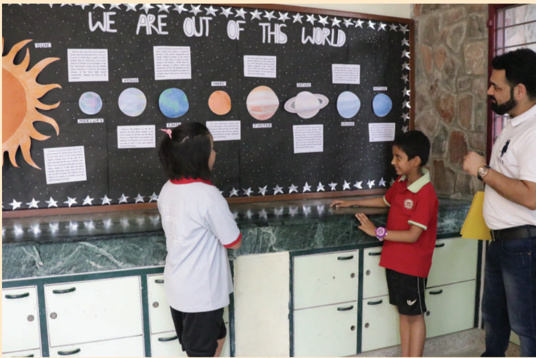
"WE ARE OUT OF THE WORLD" THEY SAY...WELL, THEY ARE!