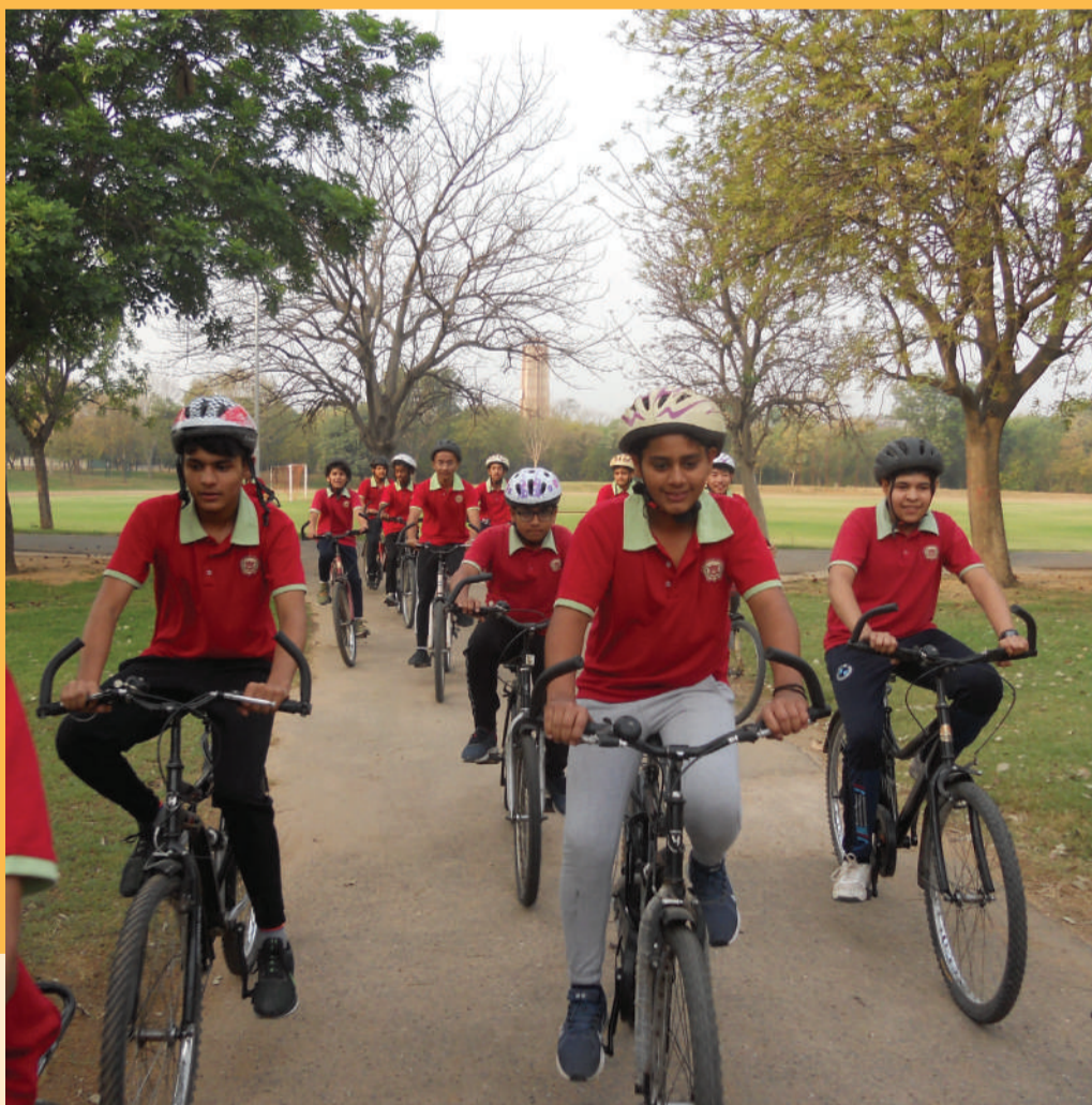
TIME FOR A FUN RIDE...