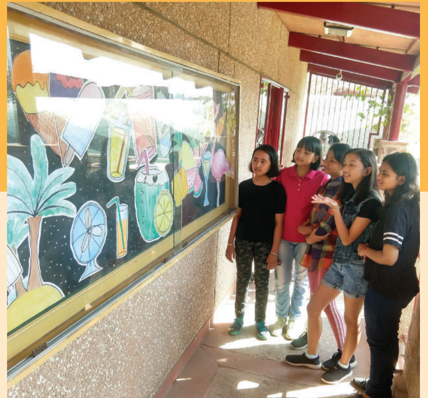
PROUD OF THEIR BOARD DECORATIONS!