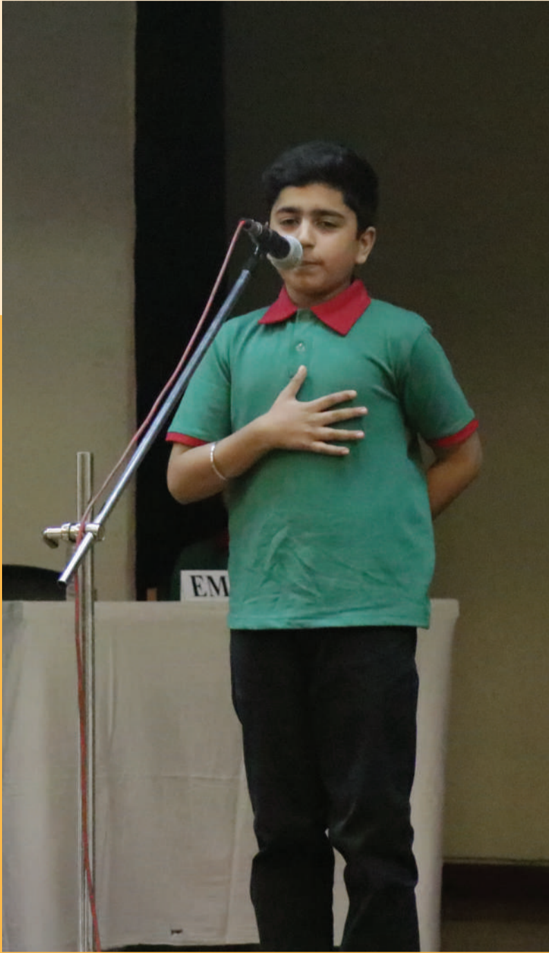
RECITING A POEM COMES NATURALLY TO ME!