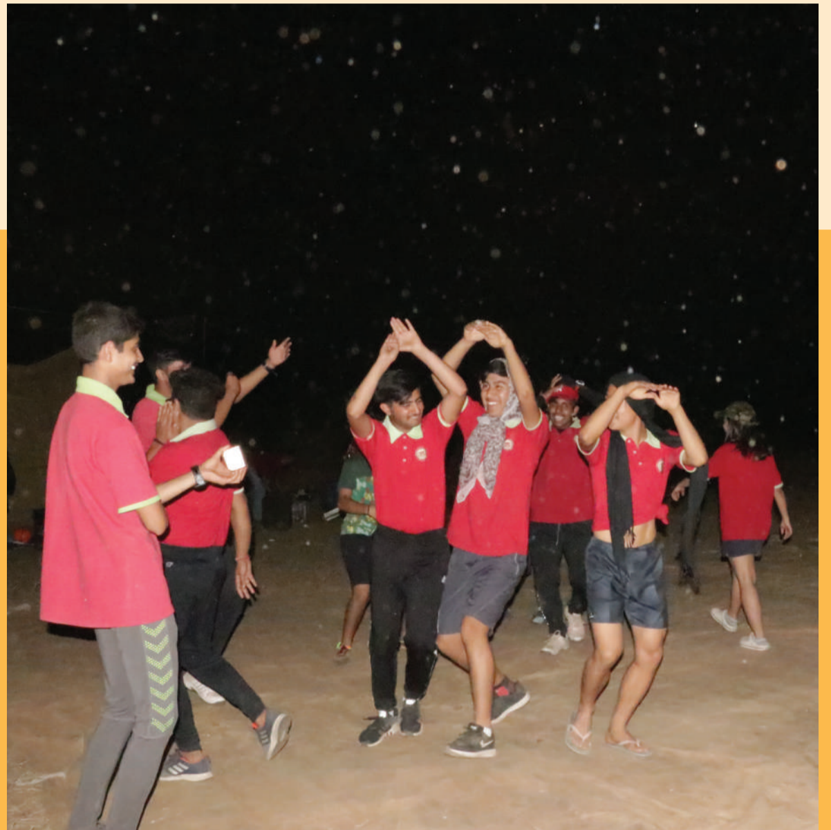
WHEN OPEN SKY IS THE ROOF...