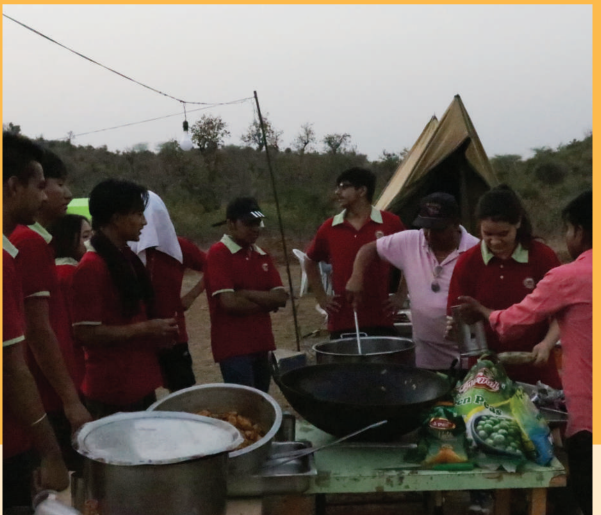
THE CAMP KITCHEN – WHAT'S COOKING?