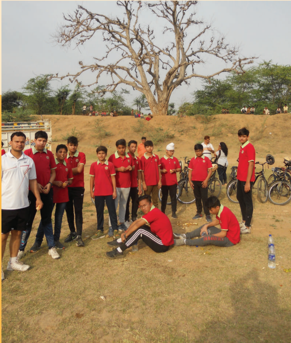
THE CYCLISTS ...